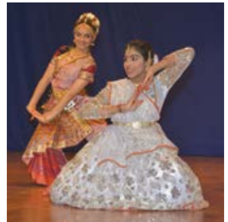
Winter House team