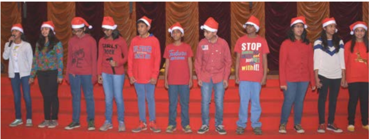
Children sing the traditional Christmas hymns