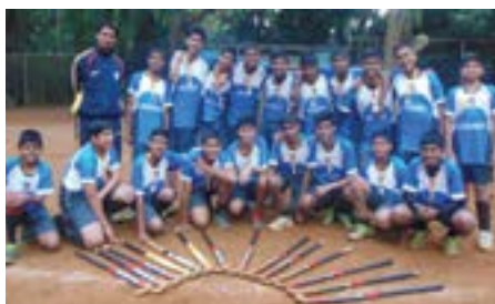
GSIS Hockey Team (U-16 yrs division)