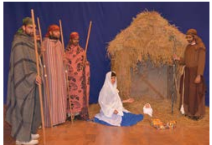
Teachers perform a Nativity Play