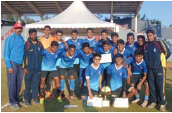
GSIS U-19 Boys' Football Team A