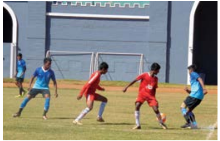
The football match in progress

In the final match, Good Shepherd International School - Team A defeated The Laidlaw Memorial School & Junior College and won the trophy. Score: 1 – 0