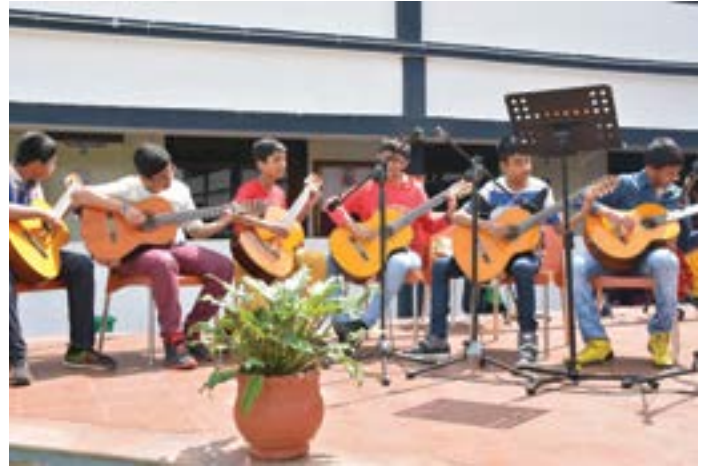
Students playing the guitar