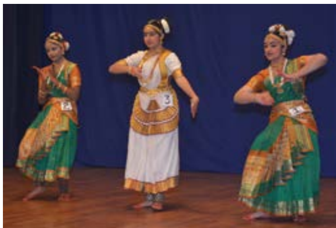
Summer House team