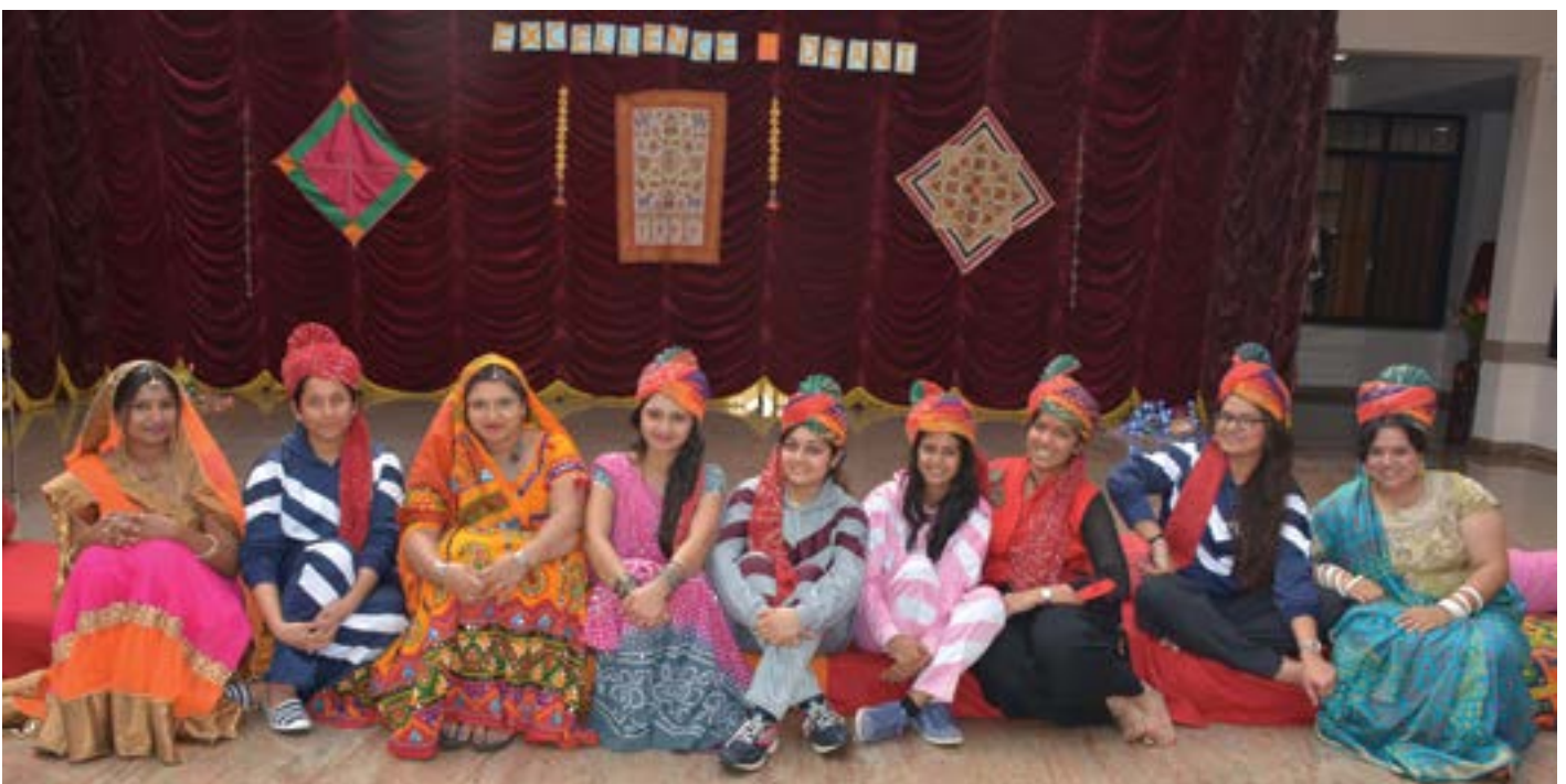
Team Excellence that served Rajasthani dishes