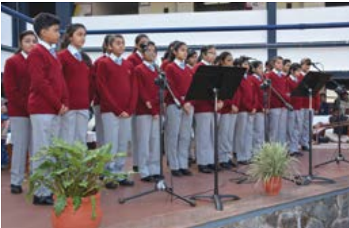
Students of Indian Music Choir singing patriotic songs

The Chief Guest of the day enlightened the audience about the meaning of Republic and the contributions of Dr. Bhimrao Ramji Ambedkar who was Independent India's first Law Minister and the principal architect of the Constitution of India. He campaigned against social discrimination against untouchables, supported the rights of women and motivated the young minds to be responsible Nation Builders.