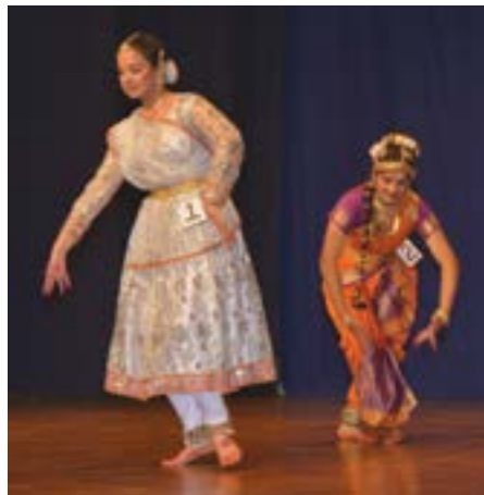
Summer House team