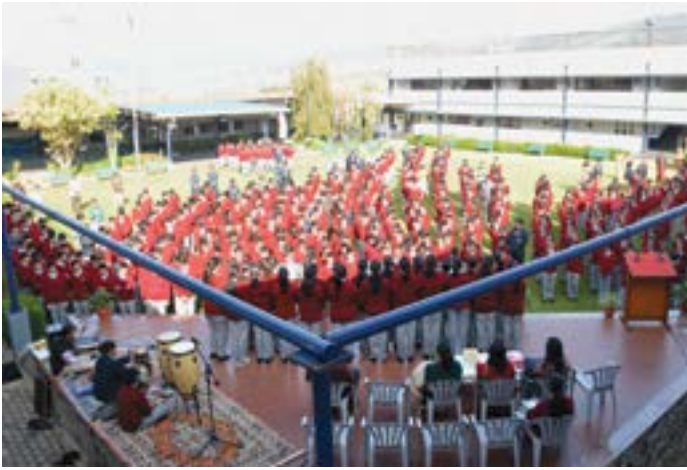
Students assembled on the greens of the co-curricular block