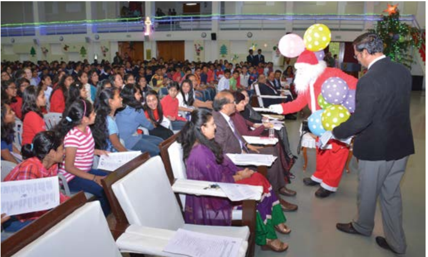
Santa distributing sweets and gifts during the Christmas Celebrations