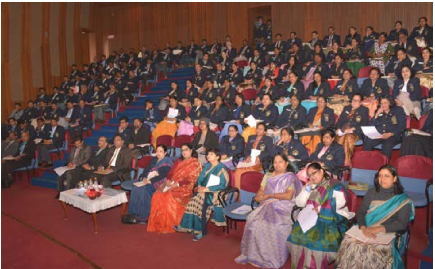
Members of the Staff attending the Faculty Orientation Programme