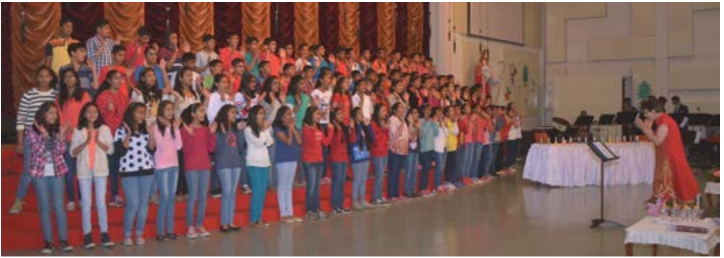
Choir students singing Christmas carols