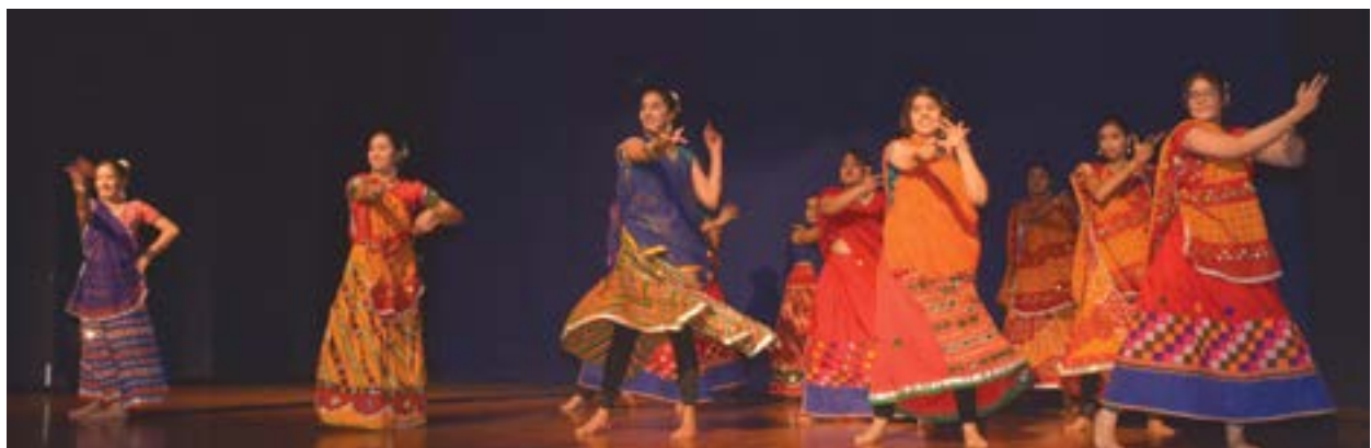
Spring House team