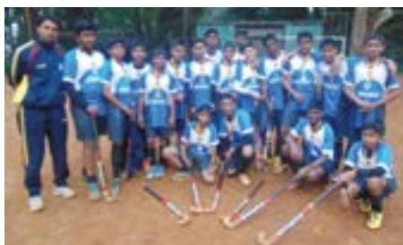
GSIS Hockey Team (U-14 yrs division)