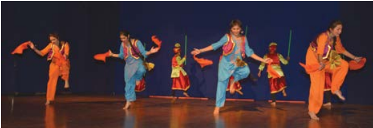
Winter House team