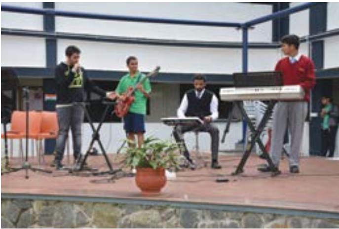
Students perform a musical show