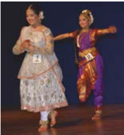
Autumn House team