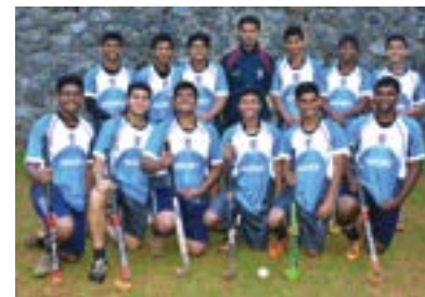
GSIS Hockey Team (U-19 yrs division)

The Annual Inter School Hockey Tournament for boys was held in Hebron School, Ooty, from 20 November to 24 November 2015.