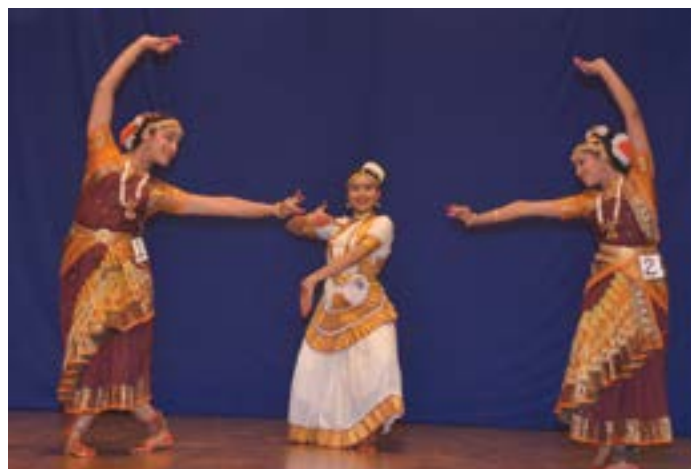
Winter House team