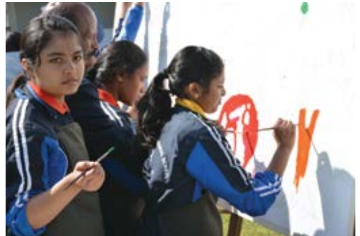
Students displaying their skills in drawing and painting