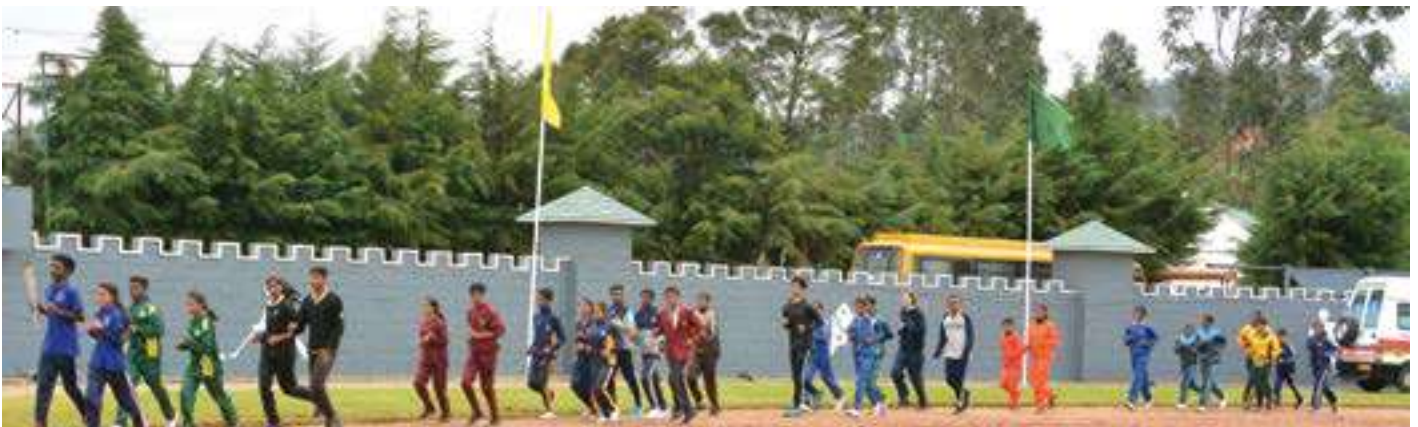
Athletic Torch Run