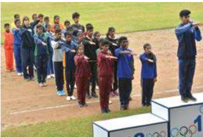
Athletes taking the Oath