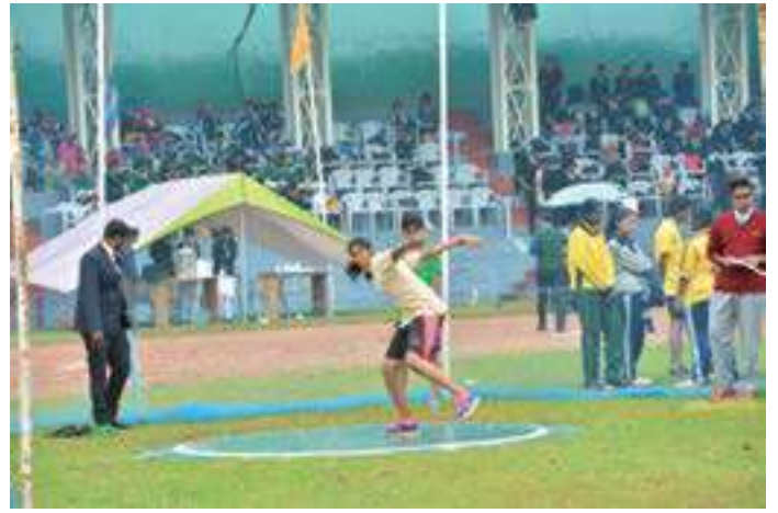
Girls' Discus throw