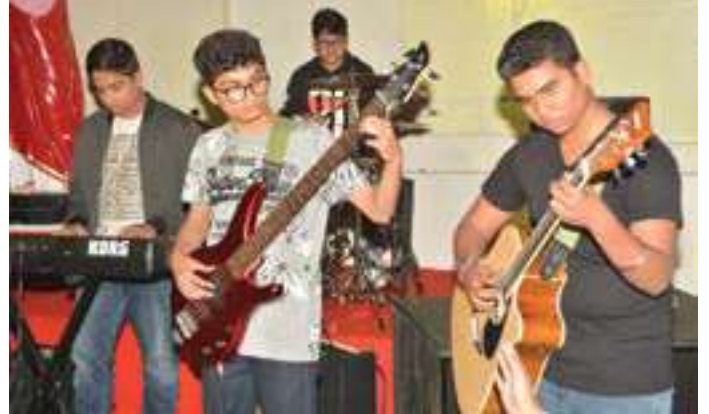
A musical presentation