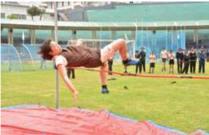
High Jump event in progress