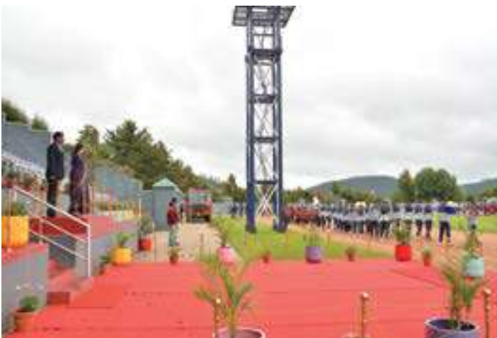
March Past of the athletes