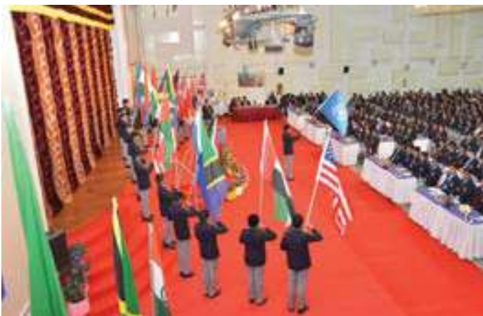
Flag presentation ceremony