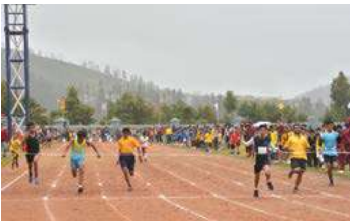
Boys participating in the 100-metre dash