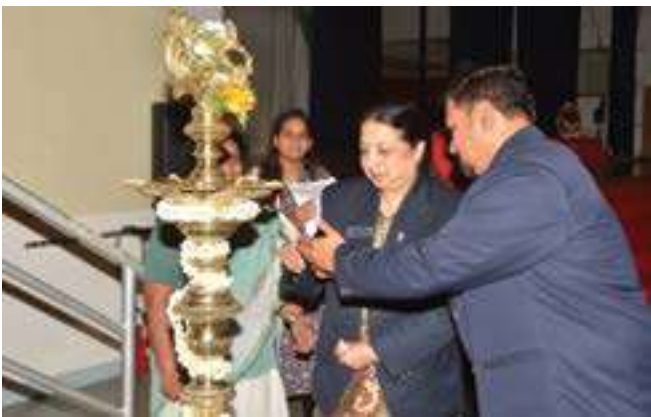
Lighting the lamp on the occasion of Hindi Diwas

Good Shepherd International School celebrated Hindi Diwas with great enthusiasm and gaiety. It was on 14 September 1949 that the Hindi language, written in Devnagari script, was adopted and approved as an official language of the Republic of India by the Constituent Assembly. Hindi Diwas is celebrated to give importance to Hindi which is widely spoken in India.