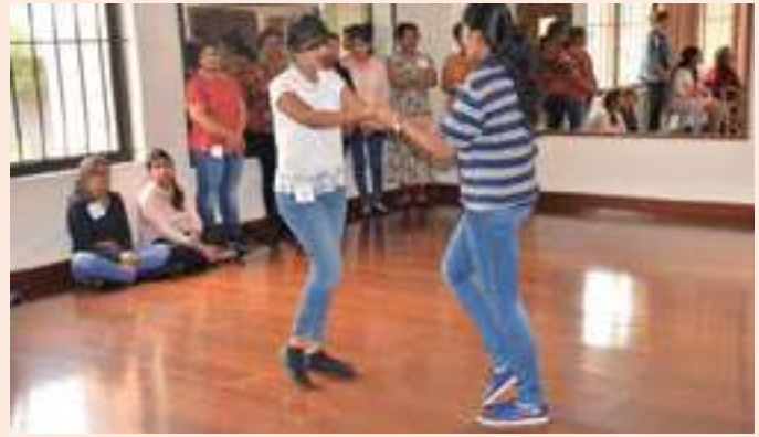
The 3 months' batch of girls learning to dance