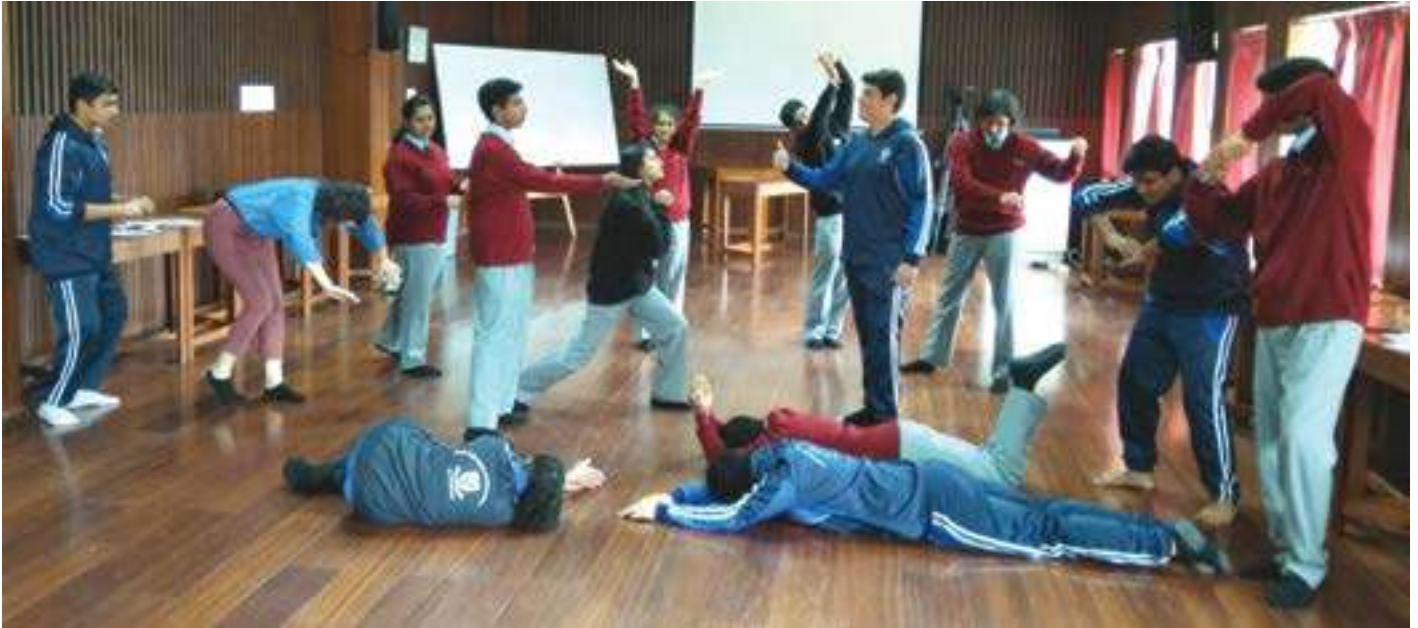
IB students of Literature and Performance participating in the theatre workshop