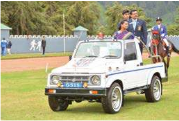
Inspection of the Guard of Honour