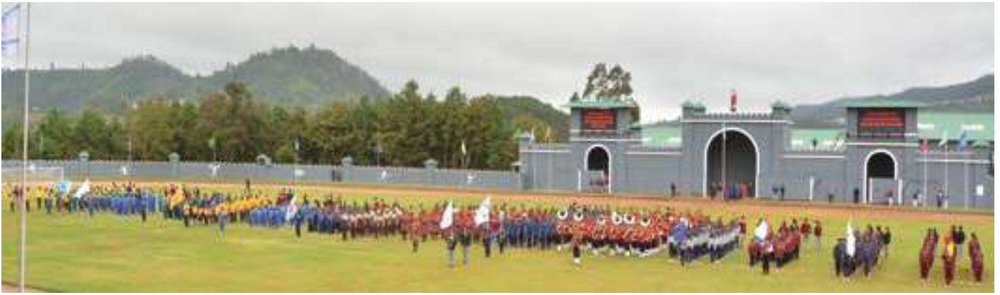
Students of participating schools assembled on the athletic field