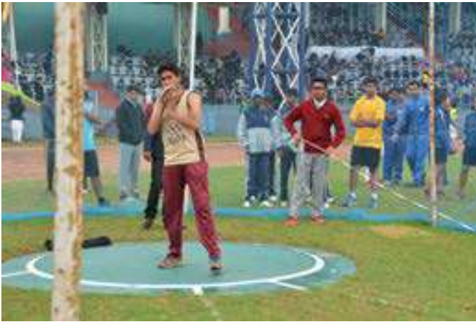
Boys' Discus throw