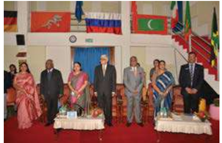
Mr Gopalkrishna Gandhi, IAS (Retd), during the inaugural ceremony

Every thought we think makes our future. The thoughts of today are the forts of tomorrow. Since the students are in Good Shepherd International School, they are constantly being moulded to become good global citizens. The Model United Nations provides a strong platform and forum to the children to formulate and express their thoughts and opinions on the various burning issues of the world.