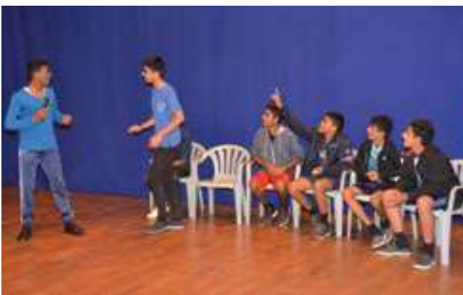
Senior boys presenting skits