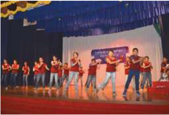
Junior students dancing to the tune of Hindi music