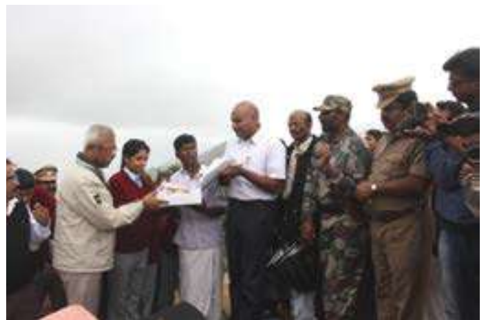
Distributing food to the people in the village

On the 6th of August 2017, a few of us from Grades 10, 11 and 12 visited Kinnakorai in the Nilgiris. We started off from school at 9.00 in the morning after having a sumptuous breakfast, not yet mindful of the value of the food. We had fun in the bus as we danced and played games. It took us two hours to reach our destination. Kinnakorai has several hattis . As soon as we alighted from the bus it started drizzling and so we could not spend much time in the open. We visited many hattis .