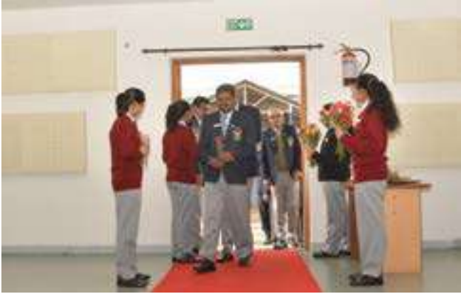
A warm welcome!