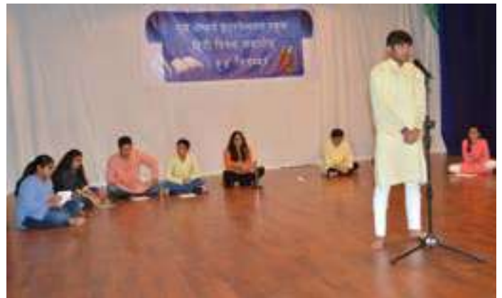
'Kavisammelan' in progress