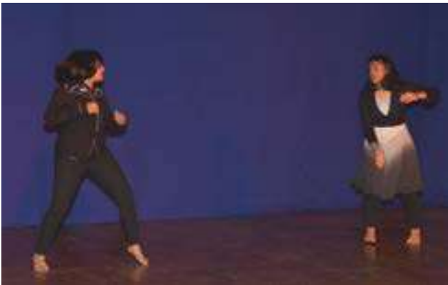
A dance performance