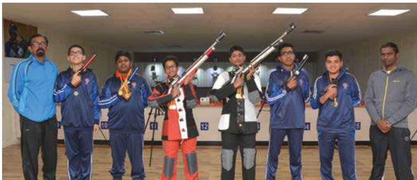
GSIS shooting team

The Tamil Nadu State Inter School Shooting Competition was held at Mission Academy of Shooting Sports, Chennai, under the aegis of Tamil Nadu State Shooting Association from 11 August to 15 August 2017. Ten students of GSIS participated in the event.