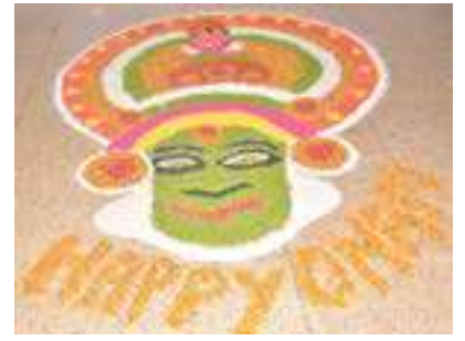
Flower carpets put together by staff

Students and staff celebrated Onam at GSIS on Monday, 04 September 2017. Onam is an important annual festival for Malayalees in Kerala and they celebrate this harvest festival with much fanfare across the world. According to popular legend, Onam is celebrated to welcome and honour Mahabali, a popular king who is said to have once ruled Kerala. It is said that on Thiruvonam , the spirit of the King Mahabali visits his people and the festival is a preparation to welcome him and show him that his people are prosperous and happy.