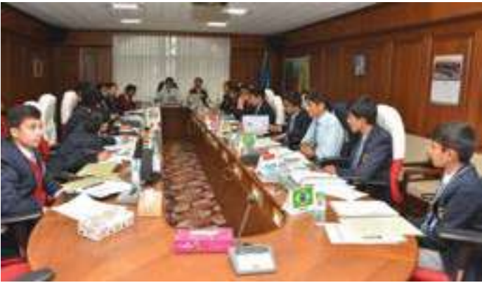
Model Security Council in progress