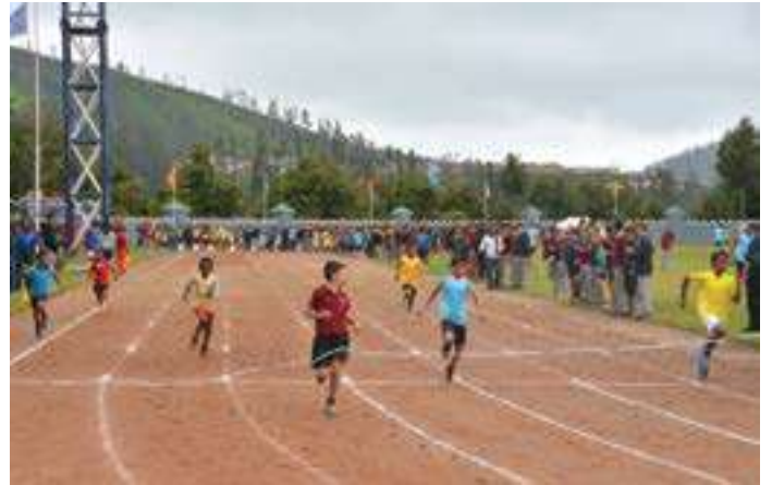
Finish of the Boys' 100-metre event