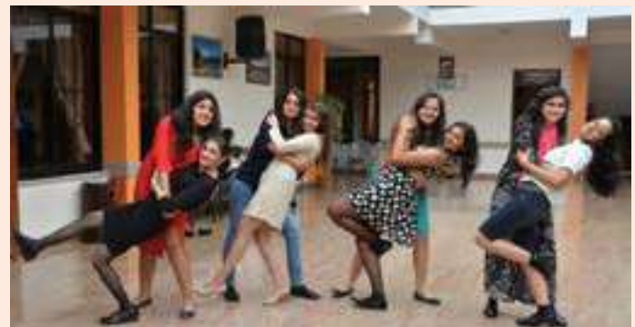
The 9 months' batch of girls learning the basic dance steps

traditionally refers to the five International Standard and five International Latin style dances. The two styles, while differing in technique, rhythm and costumes, demonstrate core elements of ballroom dancing such as control and cohesiveness.