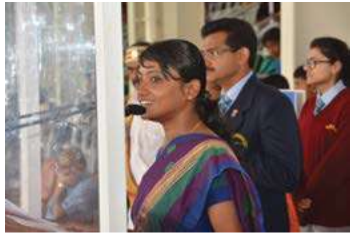
Address by the chief guest