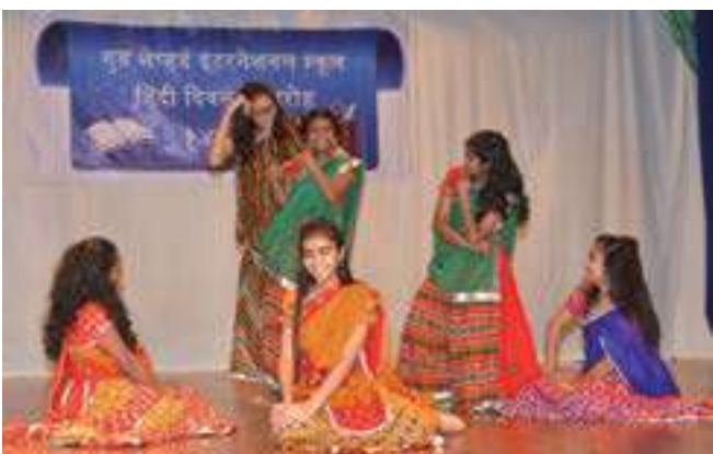
Girls dancing to the tune of Hindi music