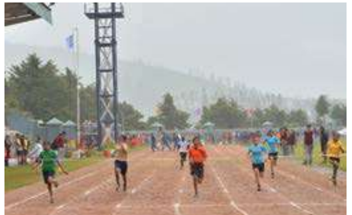
Finish of the Girls' 100-metre sprint race