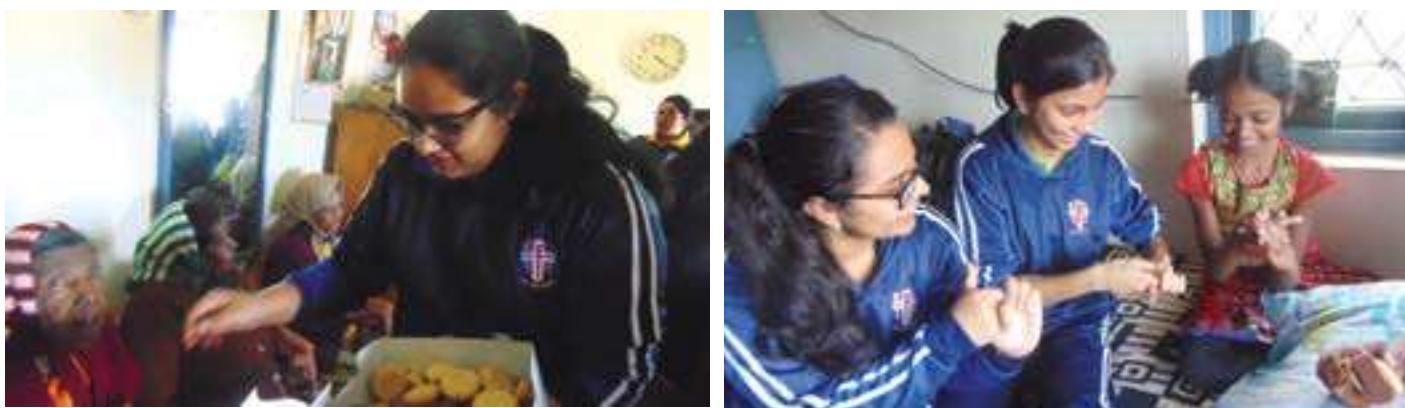
Girls of IB-2 at Smyrna Fellowship Trust

It is always said, 'We rise by lifting others.' That is what a charitable trust does! Last week, I visited a charity home called the SMYRNA FELLOWSHIP TRUST which is a public trust helping disadvantaged people lead their lives and providing them with food and shelter, and all other basic requirements. The Trust was established to guide and support social work that was rapidly growing and making a difference in the lives of hundreds of underprivileged people in the Nilgiris. Their very first task was to reach out to needy children empowering them to break the cycle of poverty. They looked after and cared for disabled children. They also helped many of them attend school who would otherwise not have been able to afford it. Their service soon expanded to reach out to the poorest of society, providing a home for young girls and looking after abandoned older people, destitute women and disabled persons in the Nilgiris.