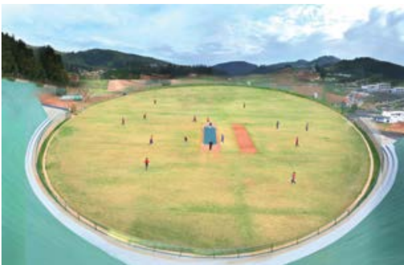
An aerial view of the cricket ground