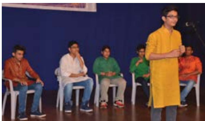
A student reciting a Hindi poem