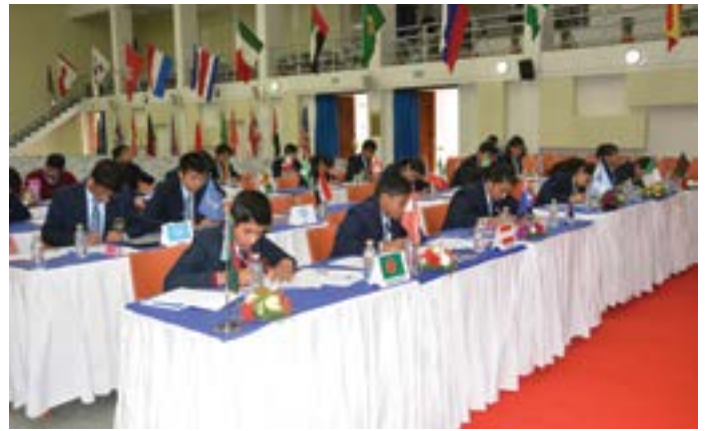
General Assembly 1 (Disarmament & International Security - DISEC)