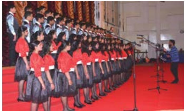
The Senior Choir singing the School Anthem