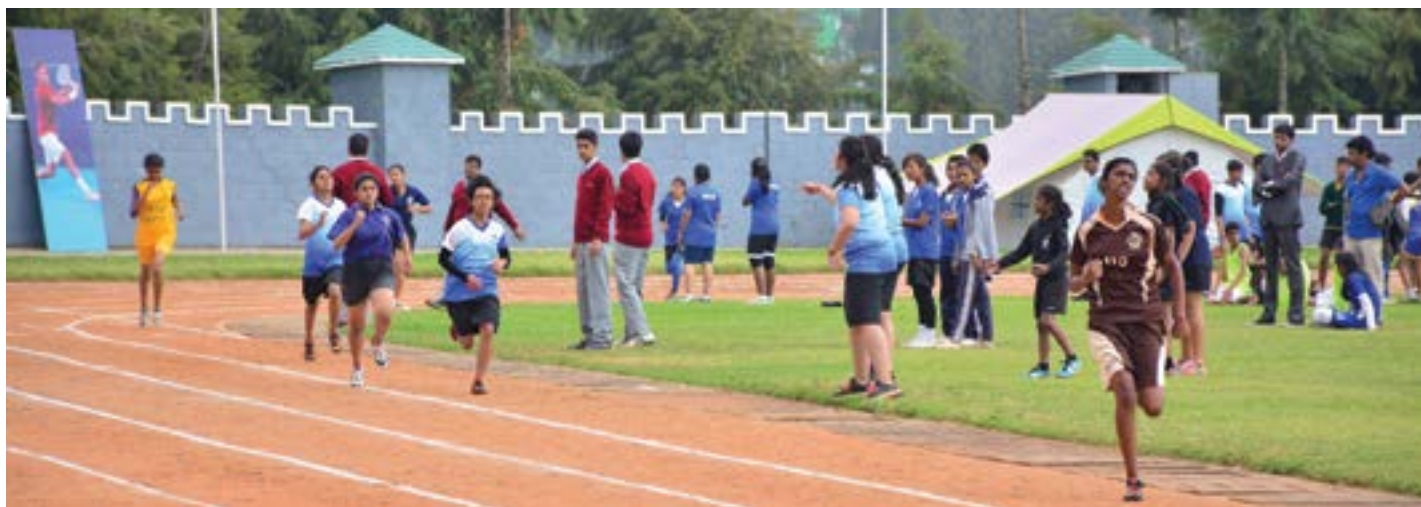
Girls' running race in progress