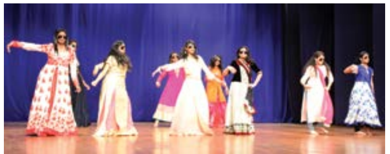
Students performing on stage

The Good Shepherd community celebrated Deepavali , the Festival of lights , on Saturday, 29 October 2016 with religious fervour.