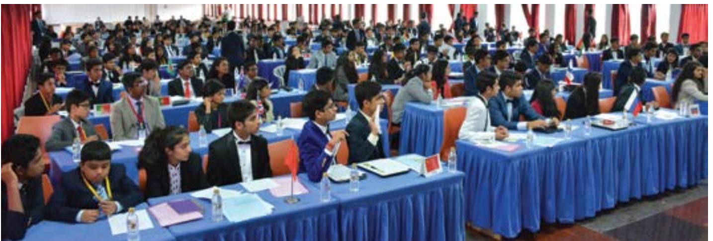
Plenary session for all General Assemblies in progress