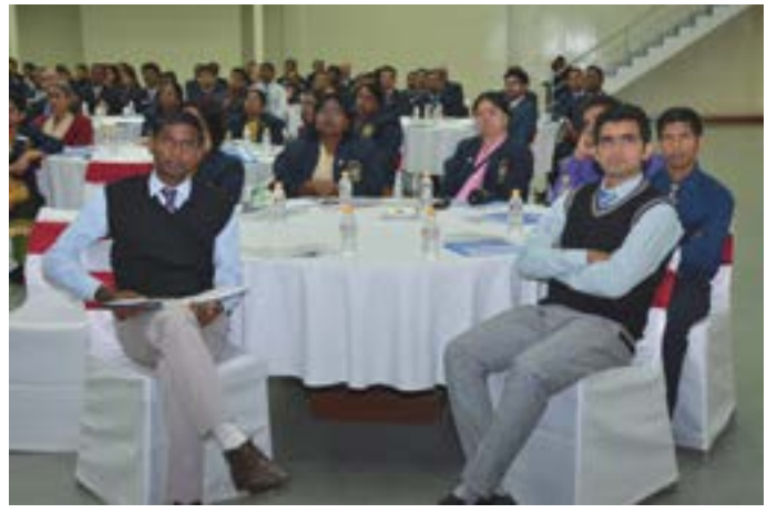
Staff members attending the programme