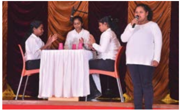
Students performing 'Magic Cups,' a song presentation