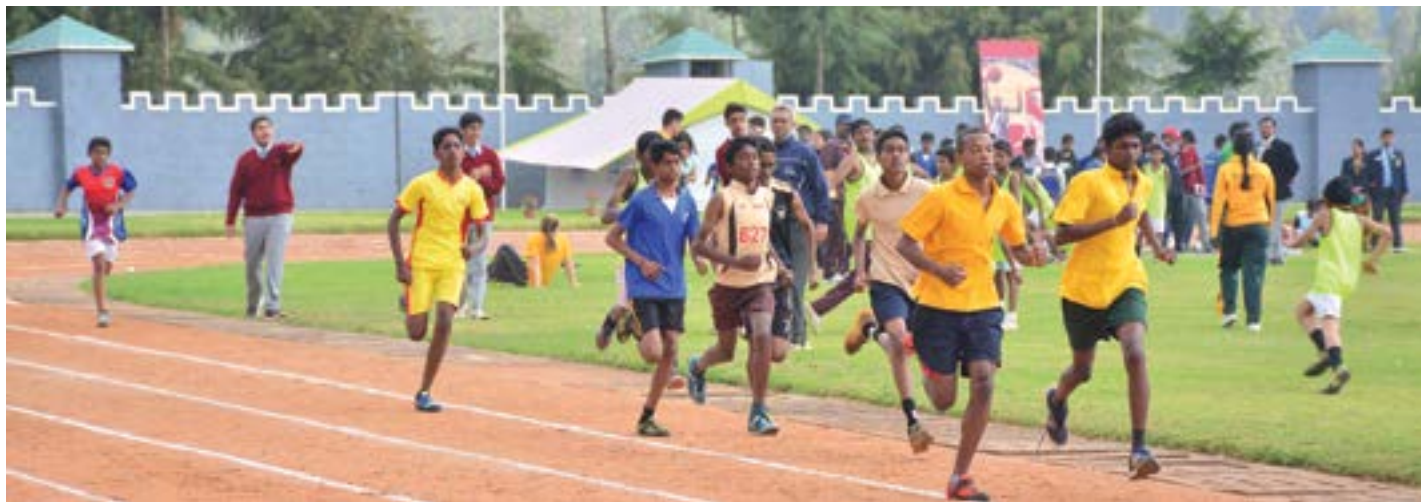
Boys' running race in progress