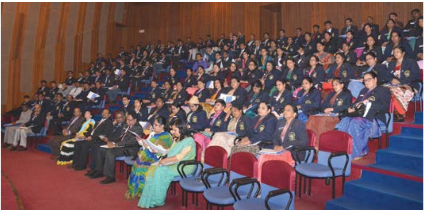
An Open Forum in progress to address the concerns of the members of staff