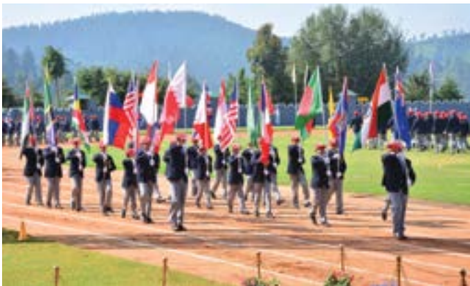
The Flag Contingent