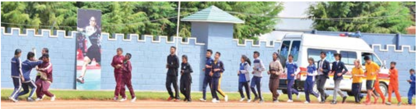
Athletic Torch Run