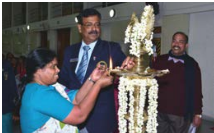
Lighting the Lamp on the occasion of the Hindi Divas Celebrations