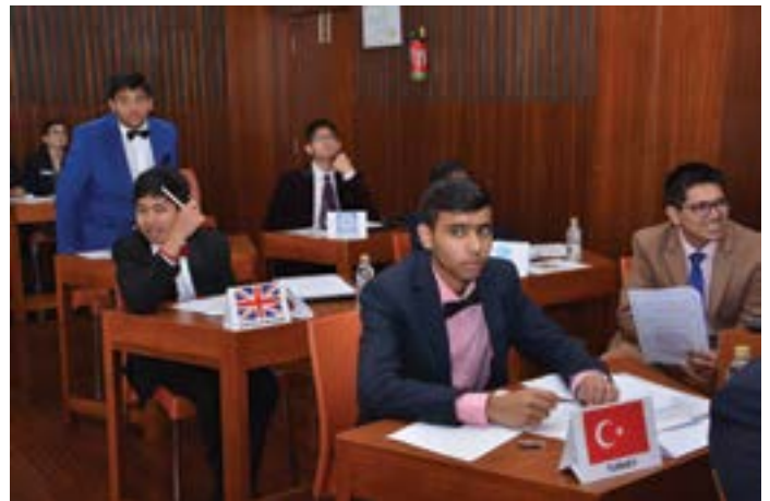
Model Human Rights Council (HRC) session in progress

Each of the committees' Co-Heads came up on the dais and introduced their respective committees with apt and captivating PowerPoint presentations. Some of the committees have been continuing over the past years but some of them were newly introduced this year.