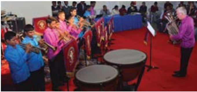
The Brass Ensemble