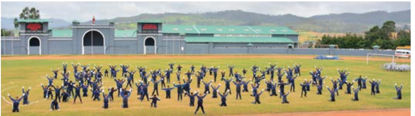
Dance performances of students on Independence Day