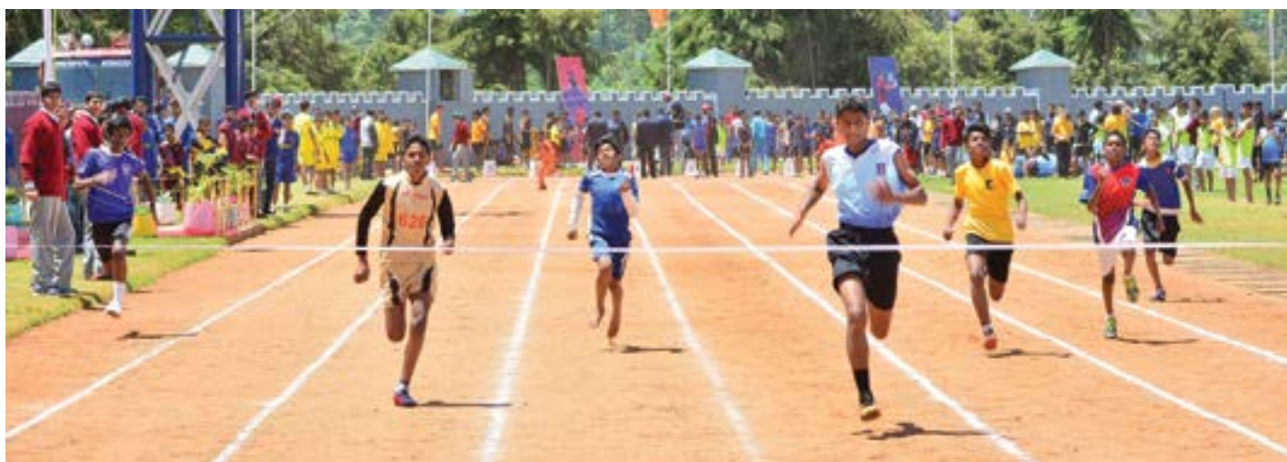
Boys' sprint race in progress