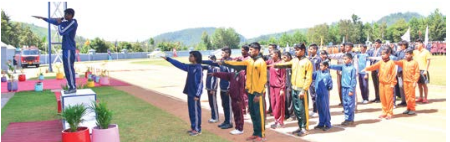
Athletes taking the Oath