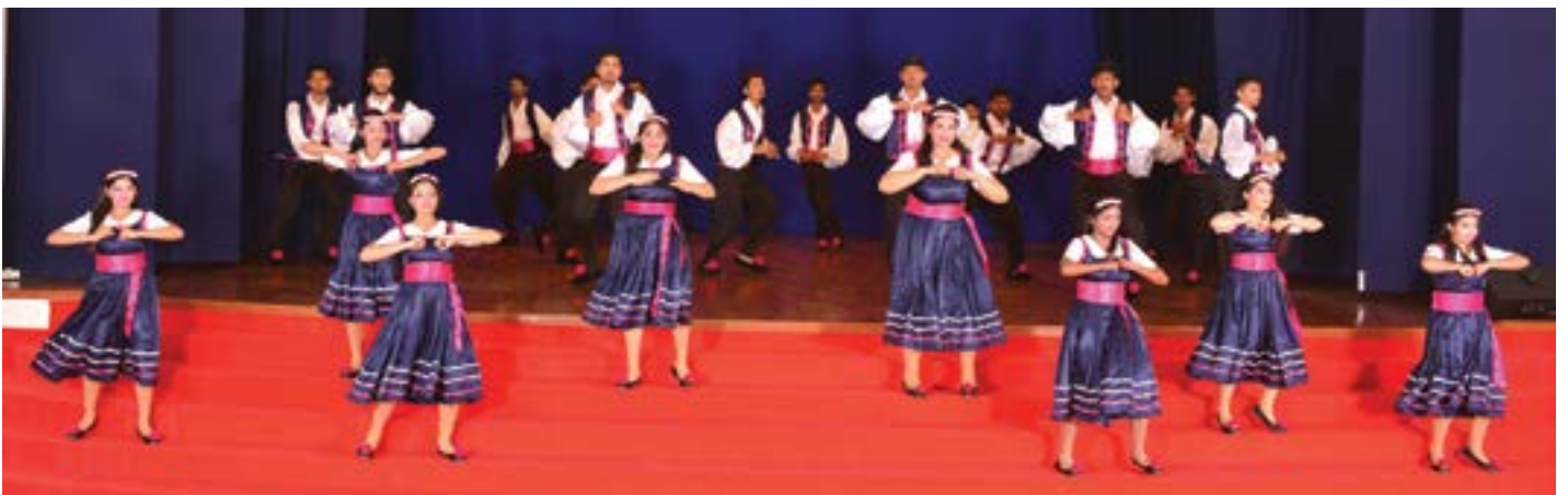
Students performing Zorba Dance

Ensemble and the Zorba Dance followed one after another; the more modern 'Hedwig's Theme' and 'Satin Doll' played on the Woodwind was followed by the traditional Greek dance, a mixture of a slow and a fast pace.