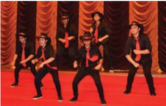
Girls dancing to the tune of 'Uptown Funk', a song recorded by British record producer Mark Ronson and American singer and songwriter Bruno Mars, for Ronson's studio album, 'Uptown Special'