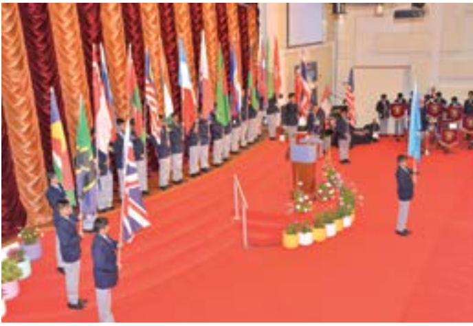
Flag Presentation Ceremony in progress