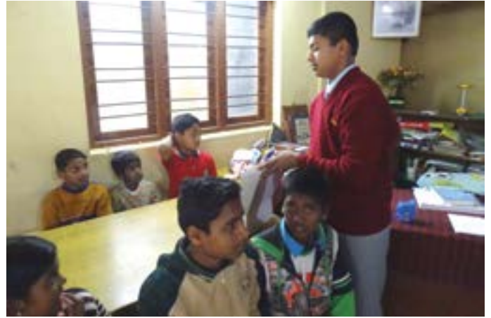
Students distributing food and clothes at the orphanage

On Sunday, 20 November 2016, a group of 27 boys of Grade 9, with their aspirations of being great Samaritans, embarked on a trip to the Mizpah Home . Though they had initially no clue as to how they would interact with the children, they returned with invigorating memories and plenty of experience.