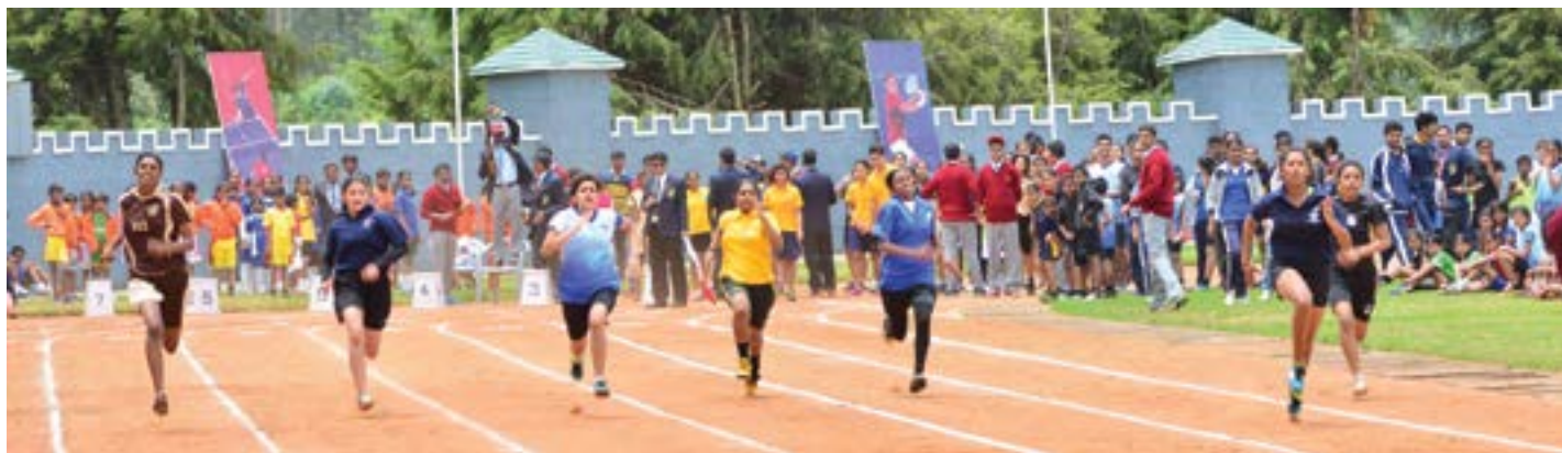
Girls' sprint race in progress