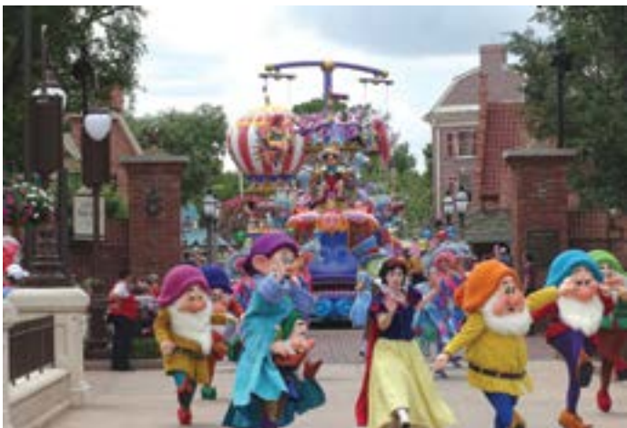
A parade at Universal Studios in Orlando