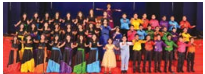
The Junior School Choir

The programme commenced formally with the school choir singing the familiar School Song and the School Prayer Song. Music of totally another kind reverberated through the auditorium as the Symphony Orchestra played three numbers, 'New World Symphony' , 'Don't Stop Me Now' , and 'The Grand March' from Aida. 'Count on Me' by Bruno Mars and 'Any Dream Will Do' written by Andrew Webber and Tim Rice were sung mellifluously by the Middle School Choir.