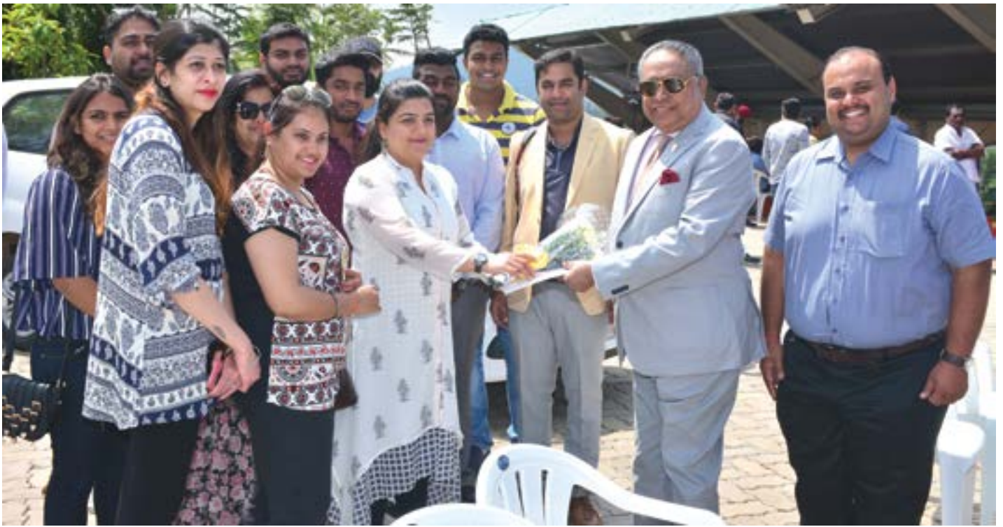
Old Shepherdians meeting the Principal