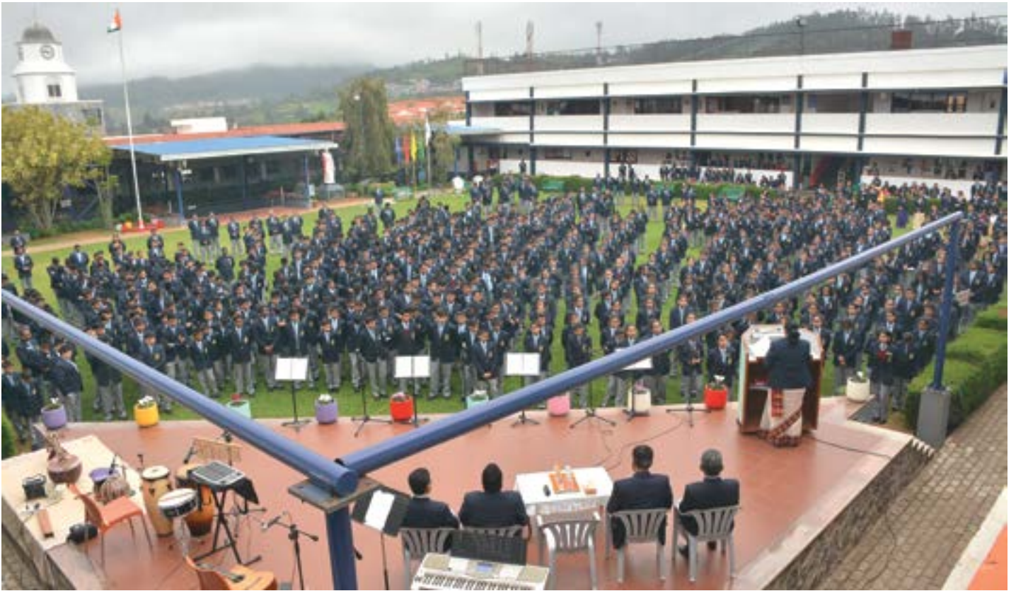
Senior students assembled in the quadrangle adjacent to the co-curricular block