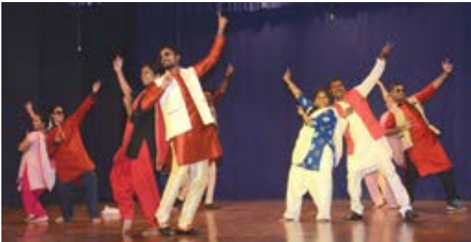
A dance performance