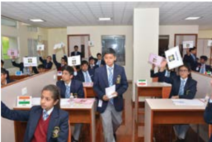
Model Economic and Social Council session in progress