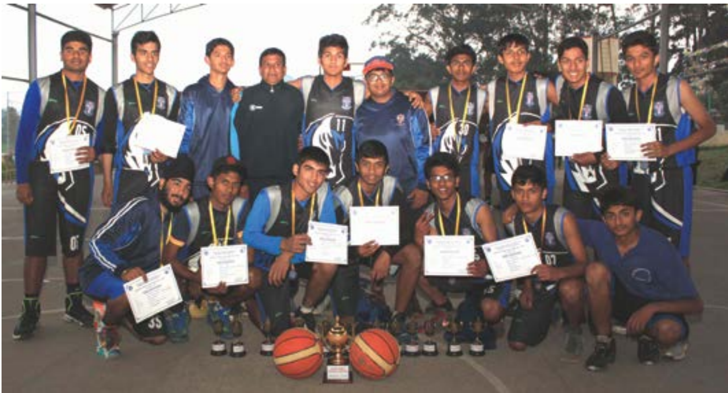
GSIS U-19 Boys' team

The District Level Basketball Tournament for U-19 boys for the year 2016-2017 was held at HADP Indoor Basketball court under the aegis of Nilgiris District Basketball Association from 31 October to 02 November 2016.