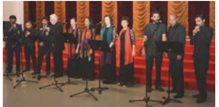
A musical presentation

Students of GSIS celebrated Children's Day on Monday, 14 November 2016 with fervour. 14th of November is the birth anniversary of our legendary freedom fighter and first Prime Minister of independent India, Pandit Jawaharlal Nehru . This day is celebrated every year to pay tribute to all children all over the world.