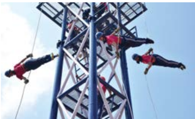
Students displaying their rappelling skills