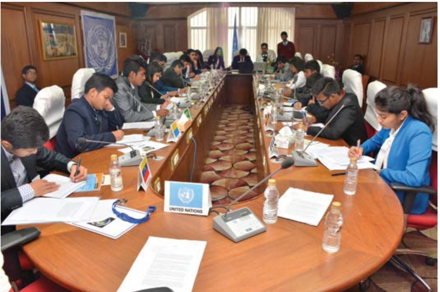
Model Security Council session in progress