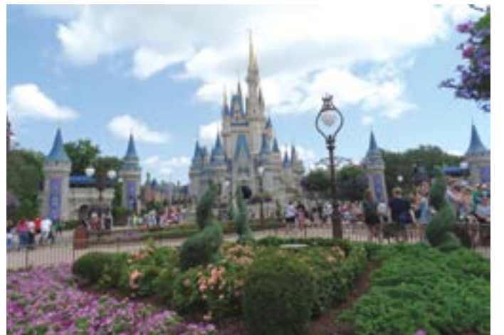
The Walt Disney World Resort in Florida