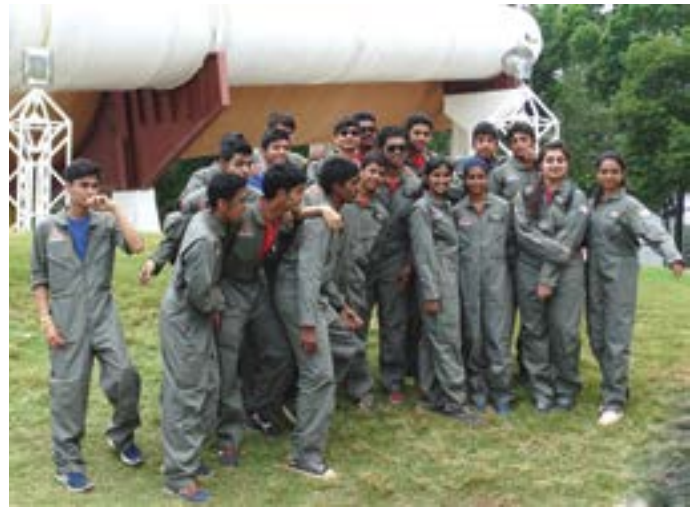
Students at the US Space and Rocket Centre in Alabama