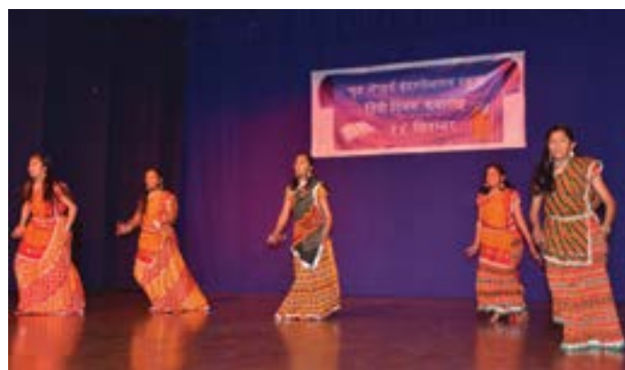
Girls presenting an Indian folk dance

Hindi as a language is used to connect and communicate with the majority of people in India. It was on the 14th of September 1949 that Hindi was adopted as the official language of the Republic of India by the Constituent Assembly of our country. Students learning Hindi in the school got together in the auditorium two days earlier on 12 September 2016 and celebrated Hindi Divas .