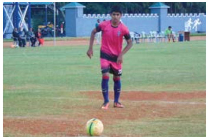
The final football match in progress