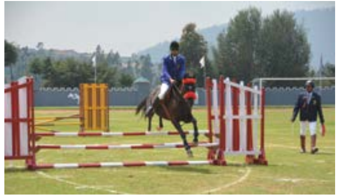
Equestrian show jumping

The long-awaited Prize Distribution was soon underway. The recipients of the Elsamma Thomas Gold Medal shared the pride that the Grade XI recipients of the school's scholarship experienced. The final set of prizes distributed were the trophies for excellence in Academics and Co-curricular Activities at school amongst the four houses of the school. The Summerians gave a shout of joy when they heard the names of Autumn, Winter and Spring for the last three places: their hard work had paid off and they were the winner of the Cock House .