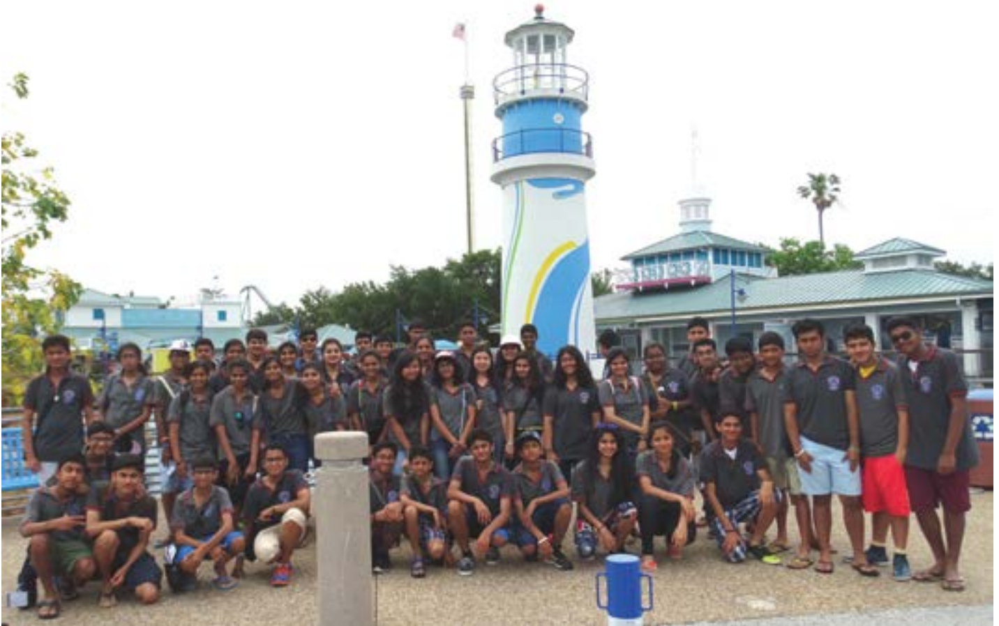
The Shepherdians during their visit to the United States

Twenty-seven boys and twenty-one girls of GSIS along with four chaperones were in the United States for a fortnight-long visit. Students were full of enthusiasm and raring to get started. Members of the Rotary Club of Decatur hosted our team on 29 May 2016. They organized a Pizza lunch and ice cream party at the Methodist Church in Decatur and the students had a pleasant and interesting interaction with the Rotarians and their families.