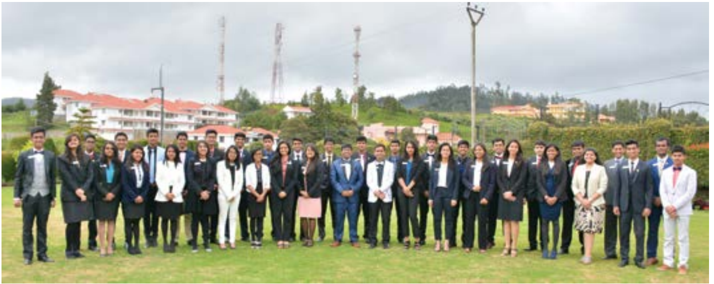
Heads and Co-Heads of the Model UN Committees along with the Secretary General