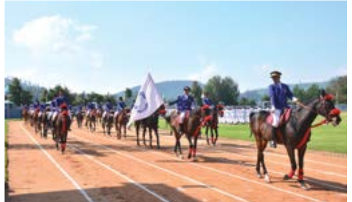
The Equestrian Contingent