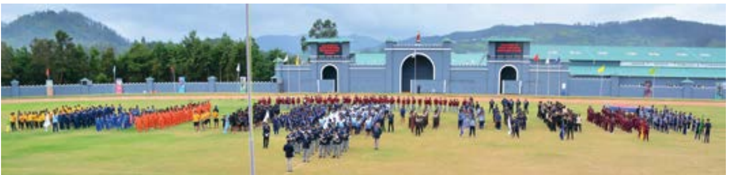
Athletes during the Closing Ceremony