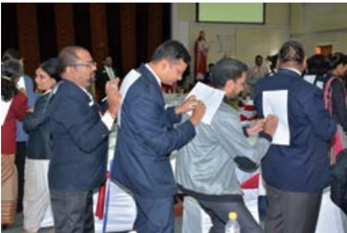
Staff members participating in fun games