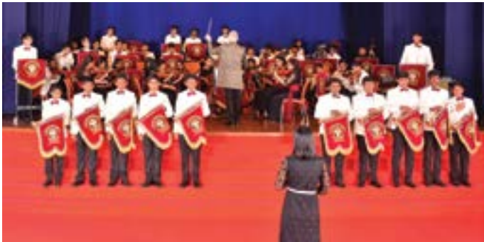
The Symphony Orchestra