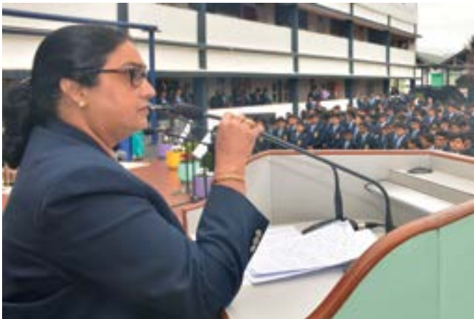
The Senior Vice Principal (Academics) delivering her Independence Day Address