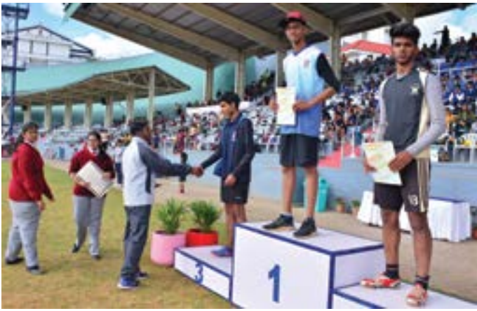
Winners receiving certificates