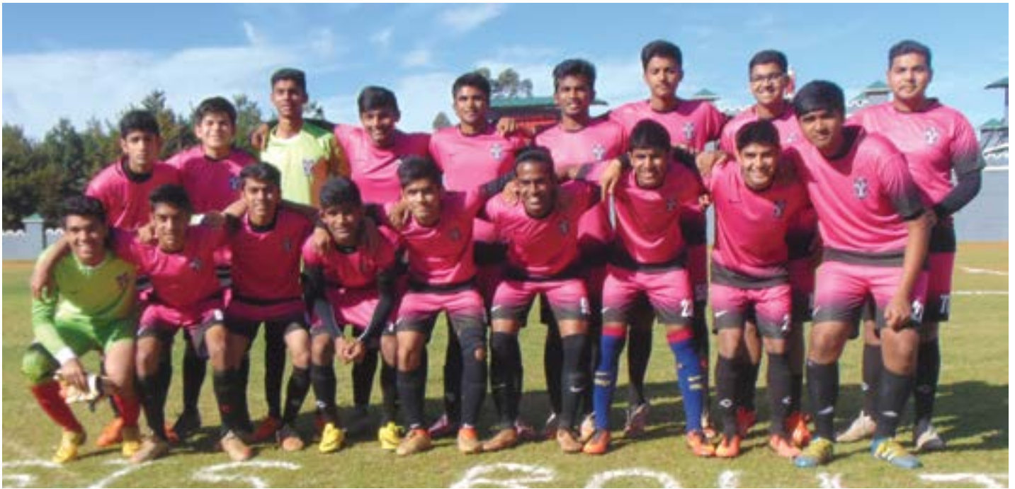
Runner-up: GSIS U-19 Boys' Football Team A

The Annual Inter School Soccer Tournament for U-19 boys was held at the Palada Campus Open Air Stadium of Good Shepherd International School on Tuesday, 22 November 2016.