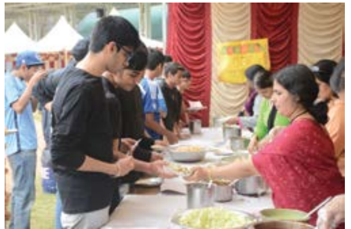
Food fête: exploring the flavours of a variety of food