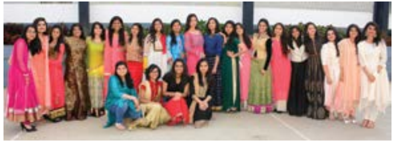
Boys and Girls in their colourful attire during the Diwali Celebrations