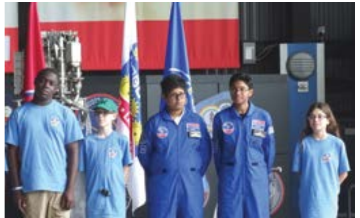
Students at the Space Camp