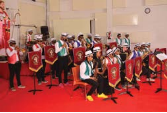
The Big Band of GSIS performing in the auditorium