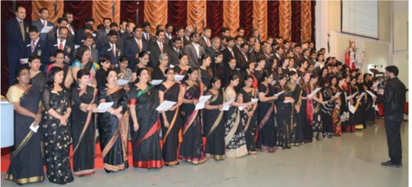
The Teachers' Choir singing 'Hail Good Shepherd'