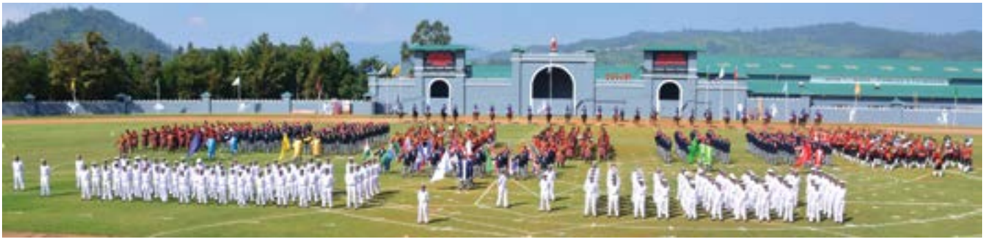
Students assembled on the ground