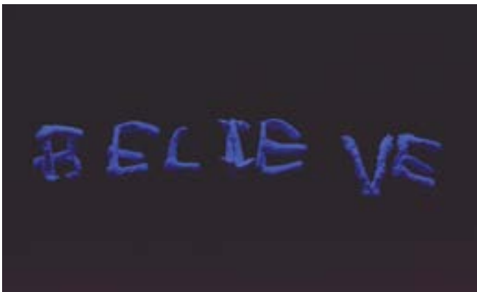
Light and Dark presentation