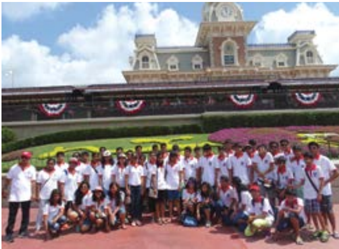
The Shepherdians at the Magic Kingdom