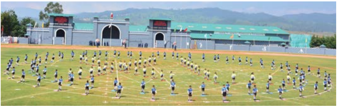
Students of Fernhill Campus dancing to the tunes of songs