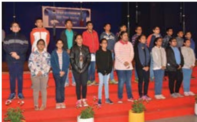
Students singing Hindi songs