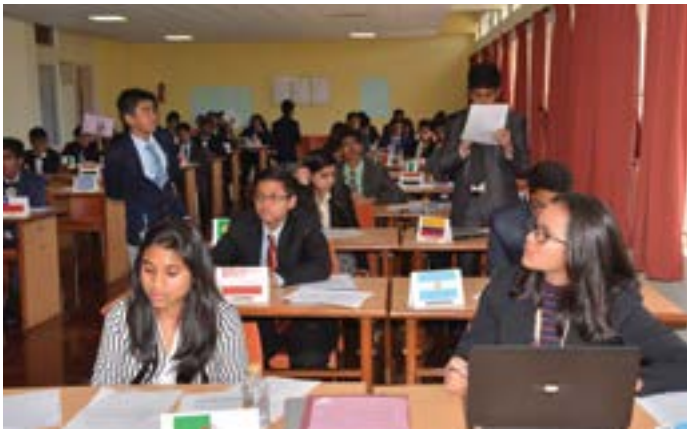
Model Youth Assembly session in progress