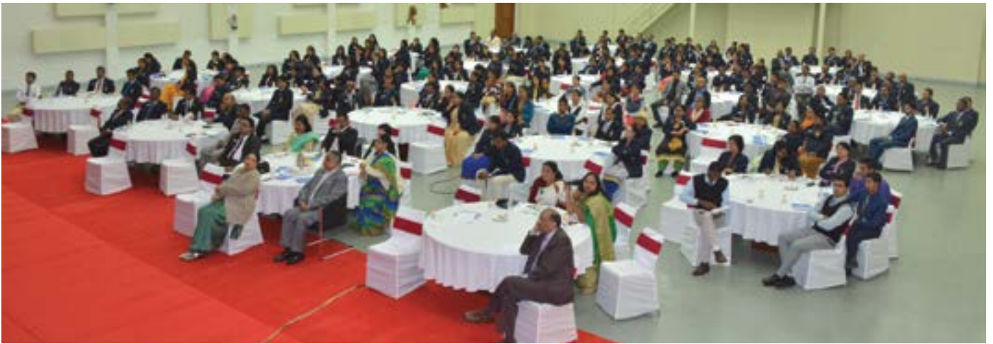
A view of the participants