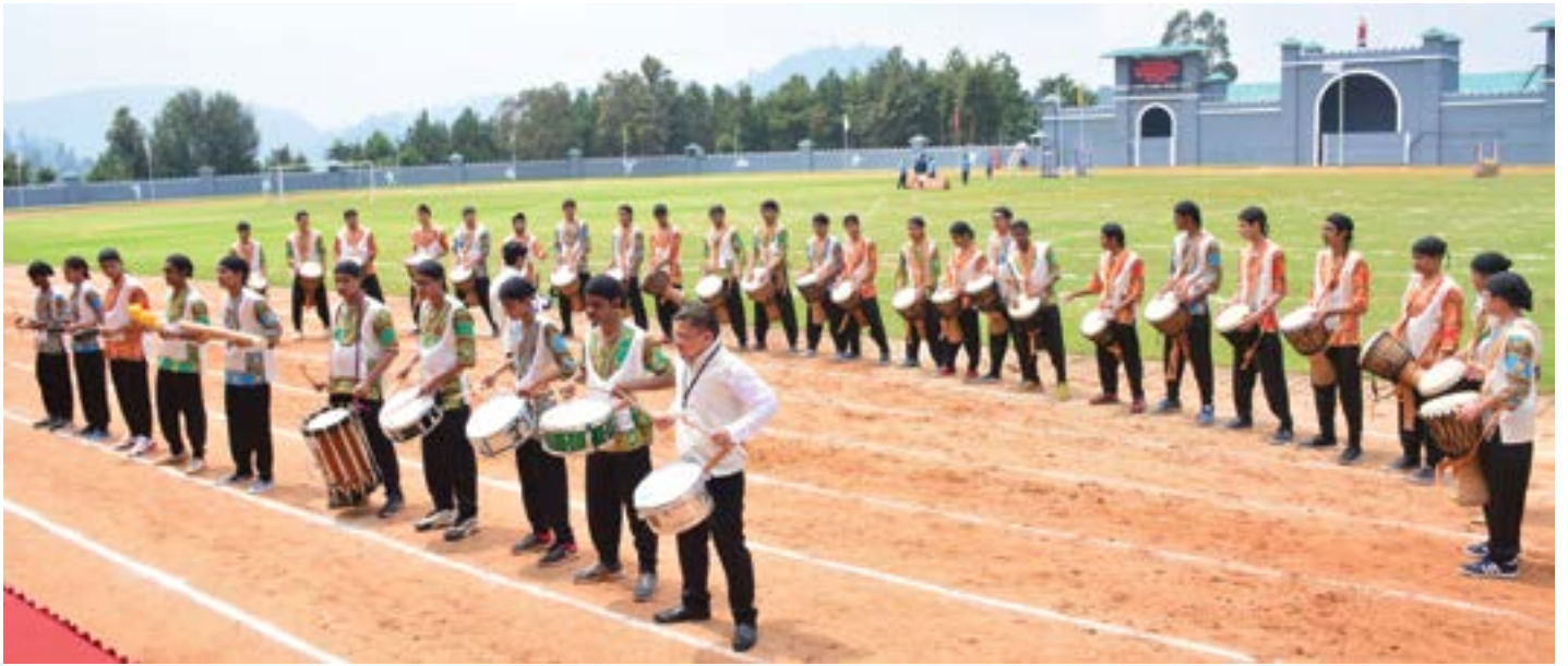
Students performing Djembe drumming