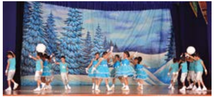
Junior School Dance