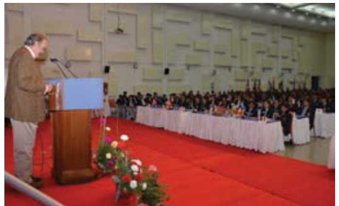
Sir William Mark Tully addressing the delegates