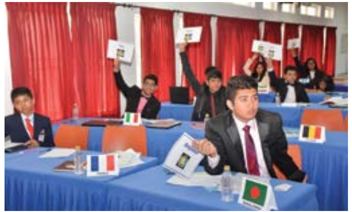
Model Social, Humanitarian and Cultural Committee session in progress