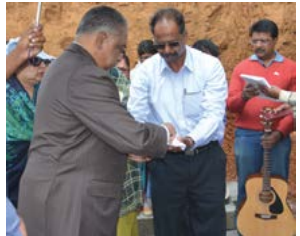
The Principal, Senior Vice President and Members of the Academic Council at the site of the new campus for boys

Good Shepherd International School is planning to have a new Campus exclusively for the boys. The proposed new campus has indoor sports halls, an academic block, dormitories for boys, dining hall, staff residence, a gymnasium, hospital and an auditorium.