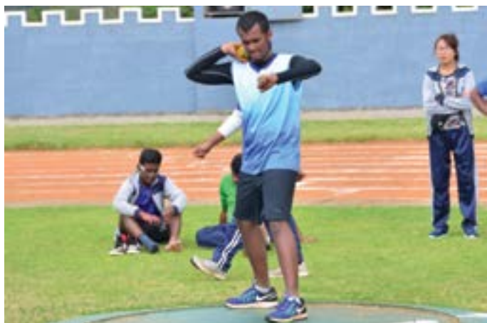
Shot put event in progress