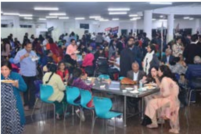
Dinner for parents, guardians and other guests in the school dining hall