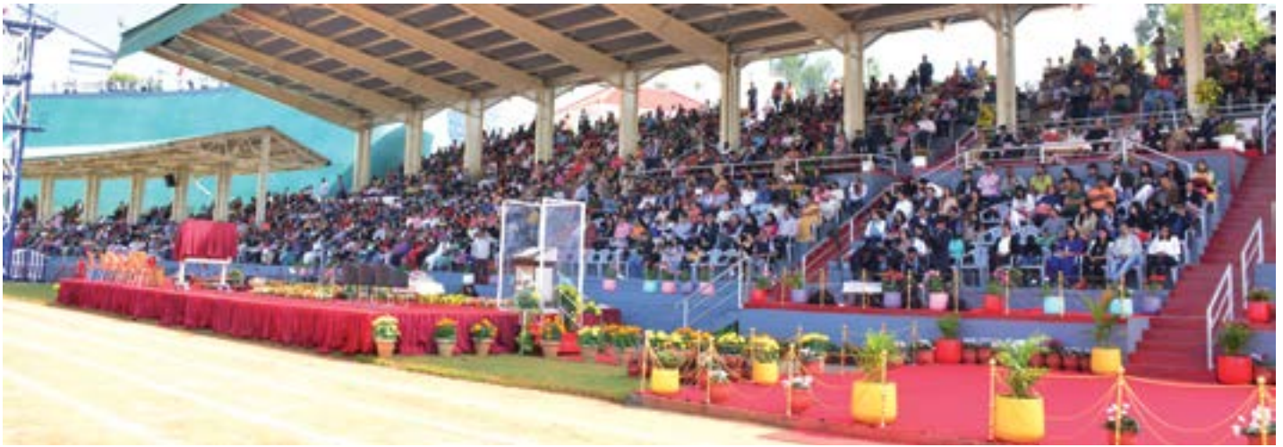
Parents, guardians and other guests seated in the pavilion