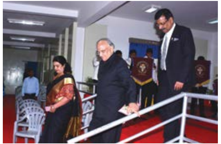
The Chief Guest being escorted to the auditorium