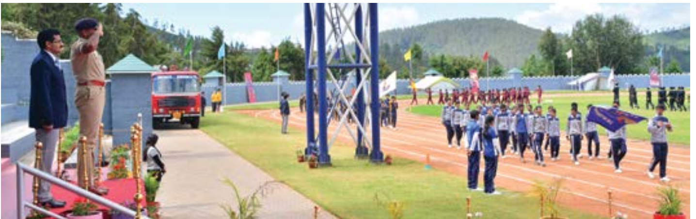
March Past of the athletes

Good Shepherd International School has generously been hosting the Annual Inter School Athletics Festival every year since 2003 with the inauguration of the new athletic track and jumping and throwing areas. The meet includes schools from the Nilgiris that share the same level of enthusiasm for sports as the host. The 14th of its kind was conducted with great zeal on the 20th of August 2016. The meet brought fifteen participating schools from the region on the Palada Campus grounds.