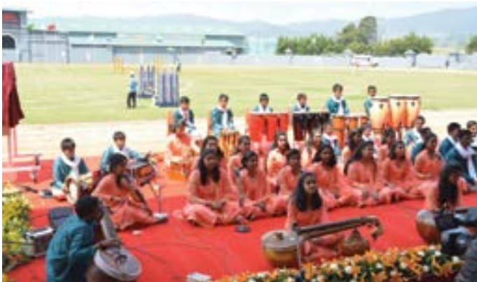
Indian Music Ensemble