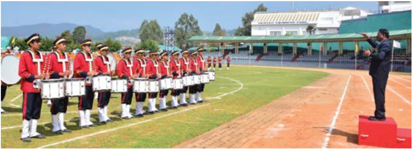
The Drummers' Call