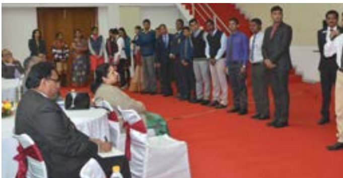
Self-introduction by new academic & co-curricular teachers