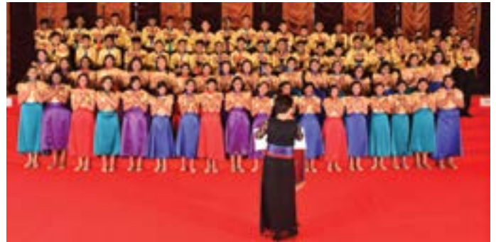
The Middle School Choir