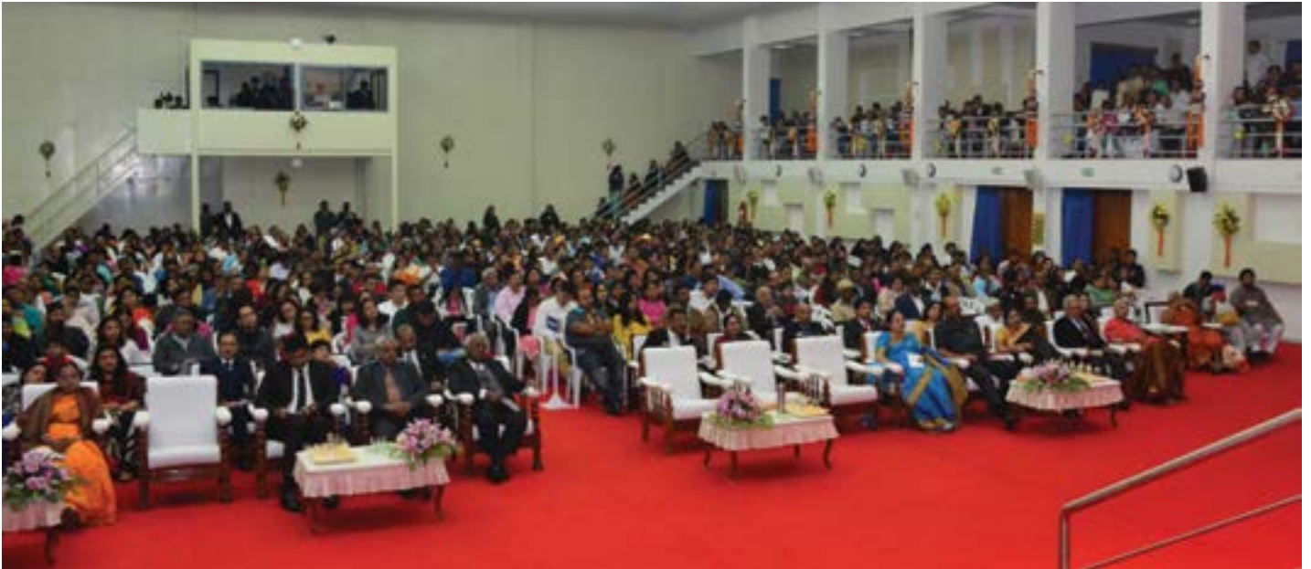
Parents, guardians and other guests seated in the auditorium