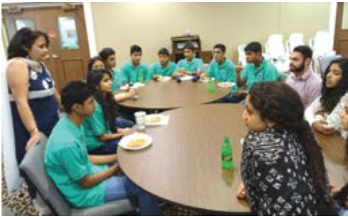
The Shepherdians attending the Pizza lunch and ice cream social in Decatur