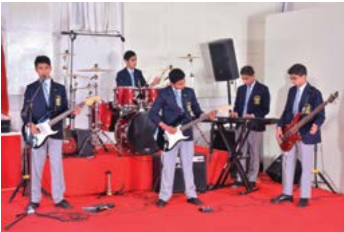
A musical presentation