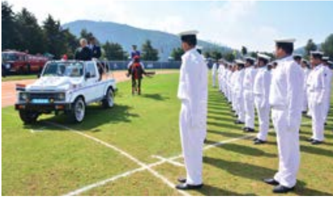
Inspection of the Guard of Honour