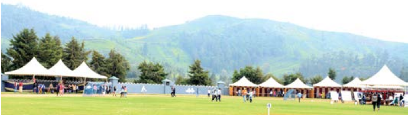
A carnival atmosphere: Food and Games stalls