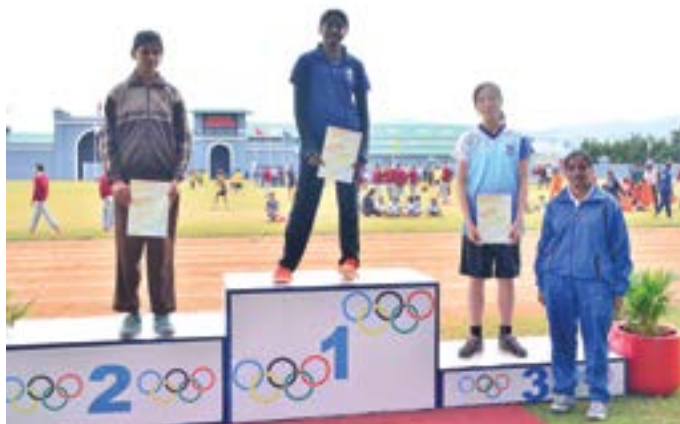
Winners on the podium