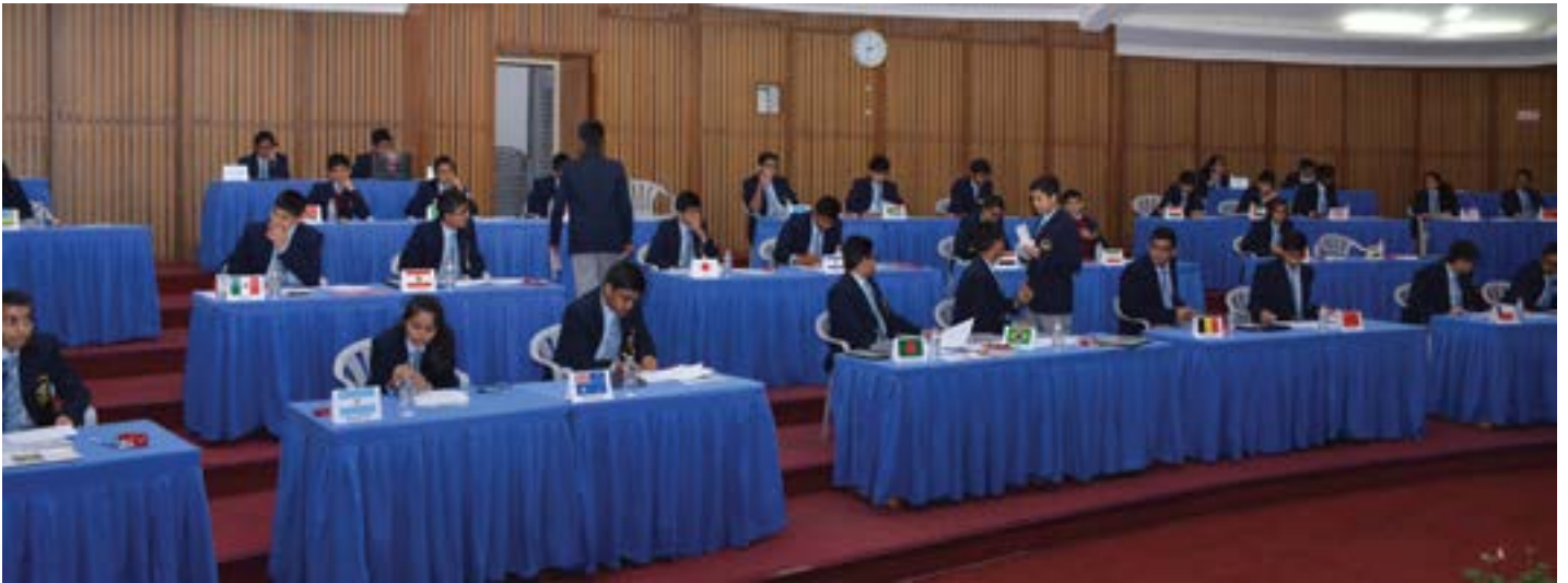
Model Special Political & Decolonization Committee session in progress