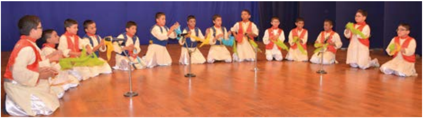
Junior students singing Hindi songs