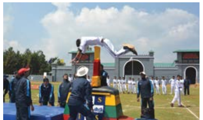
A student displaying his Gymnastics skills