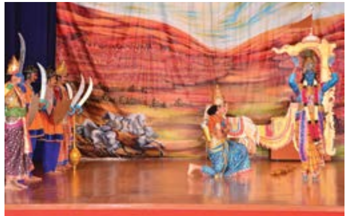
Students performing Sri Krishna Leela, a Classical Dance Drama