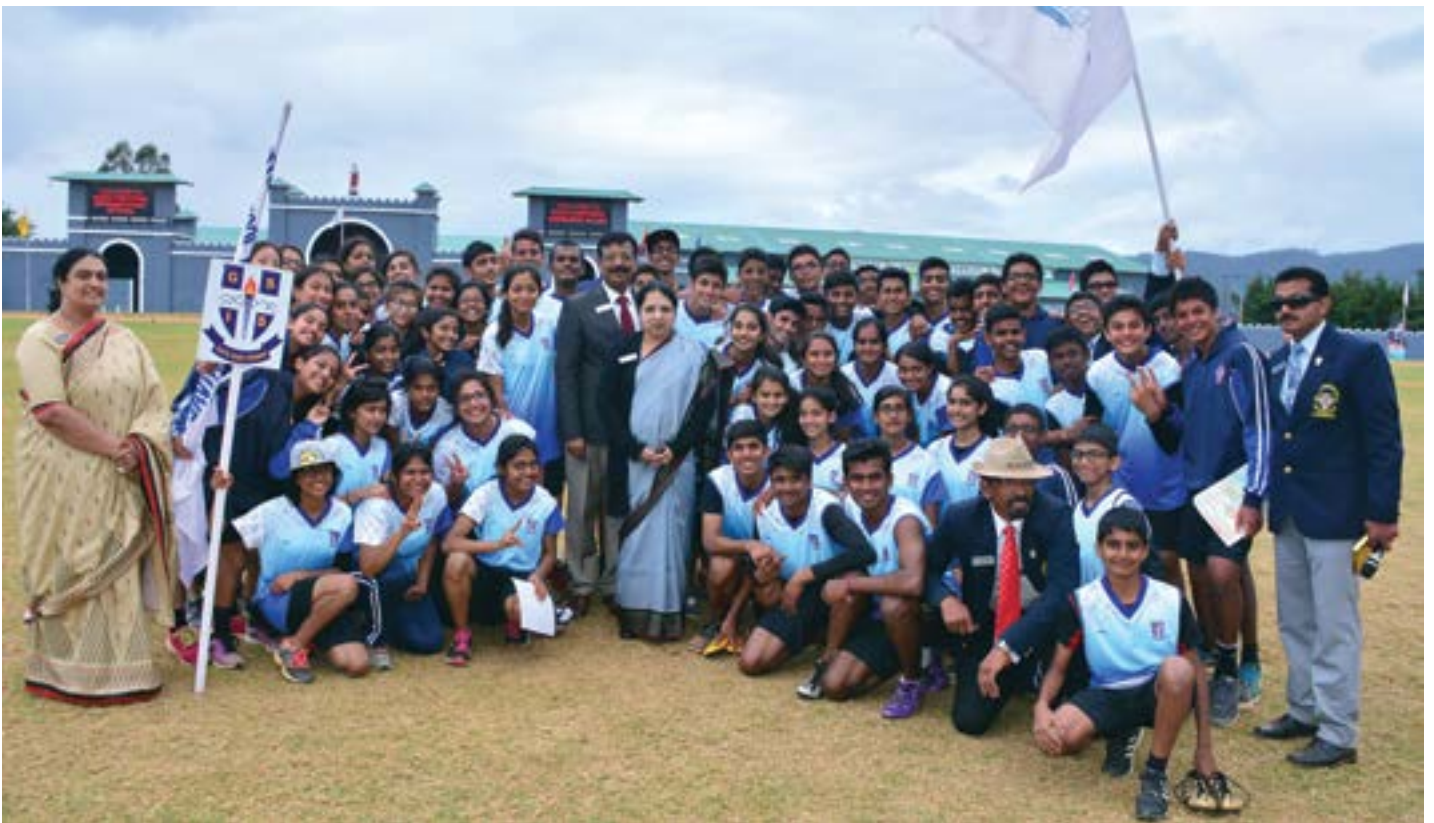
Athletic contingent of GSIS at the Athletic Festival