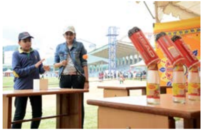
Students participating in fun games