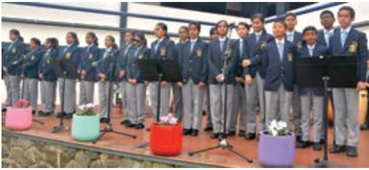
The school choir singing patriotic songs