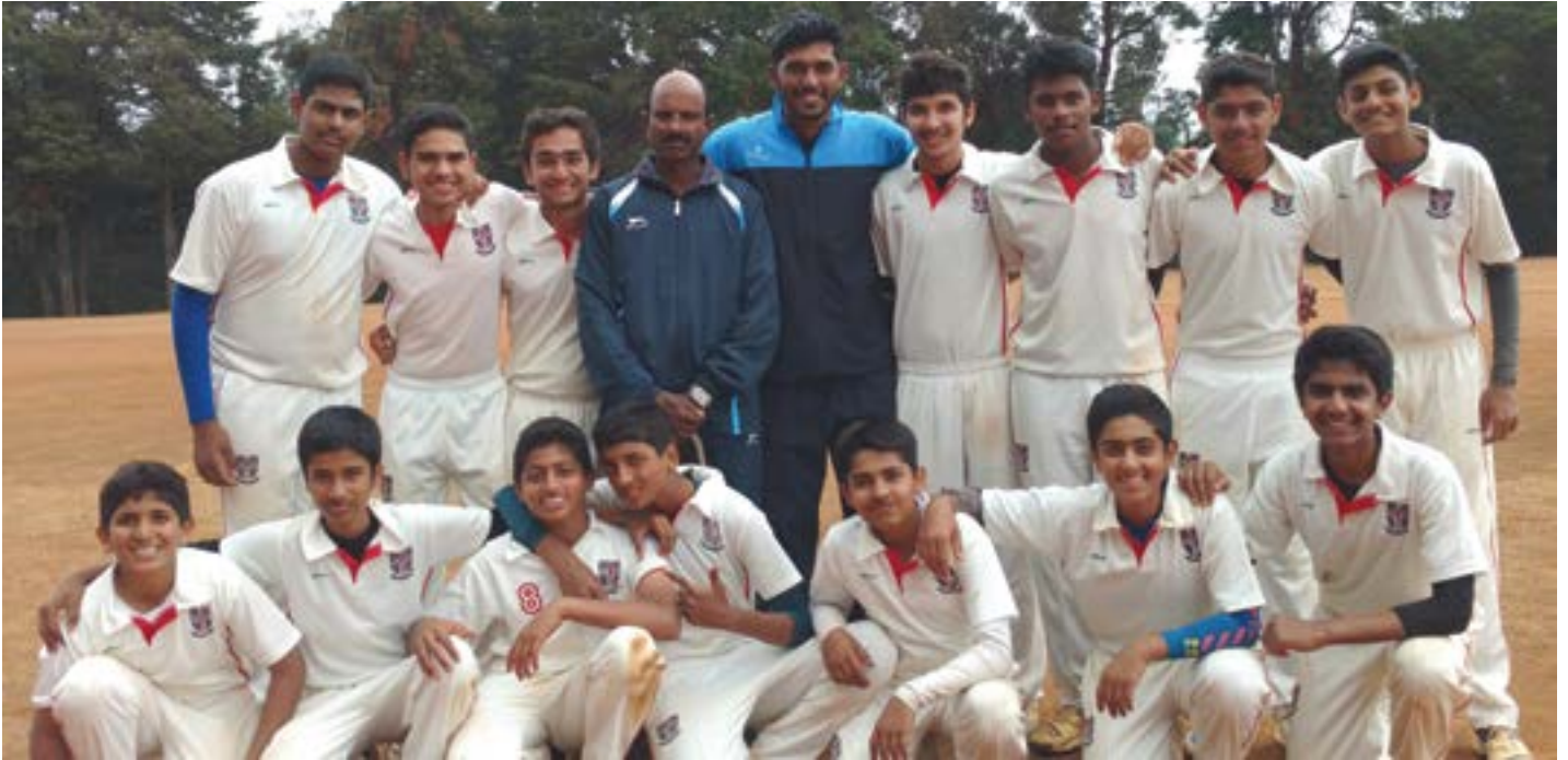
Under-16 cricket team of GSIS

The Nilgiris District Cricket Association (NDCA) organized the Under-16 Inter School Cricket Tournament for the Azhar Hassan Memorial Rolling Trophy from 10 September to 14 November 2016. GSIS won the championship and the trophy.