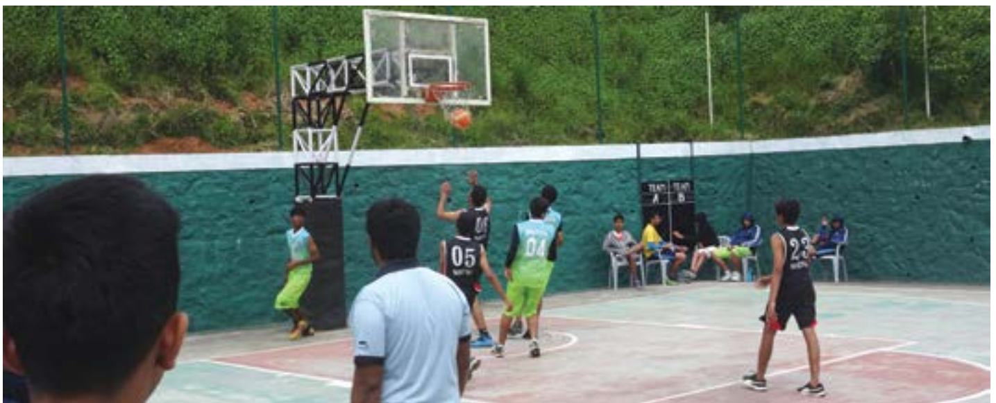
The Basketball tournament in progress