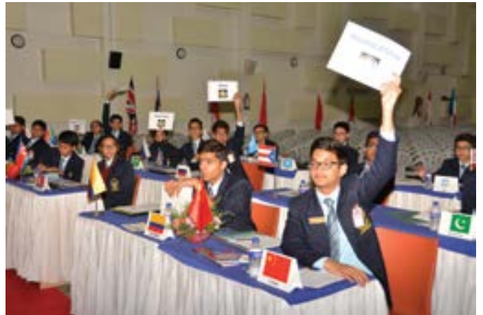
Model Disarmament and International Security [DISEC] session in progress