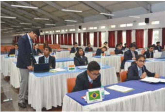
Model Social, Humanitarian and Cultural Committee [SOCHUM] in session