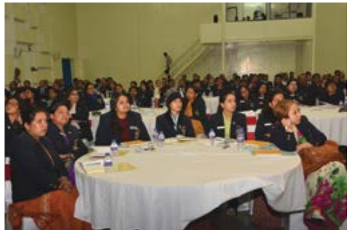
Members of staff attending the orientation programme

The academic year 2017-18 commenced with the customary two-day orientation programme for the entire staff community. The new teachers introduced themselves as they were welcomed into the GSIS family.