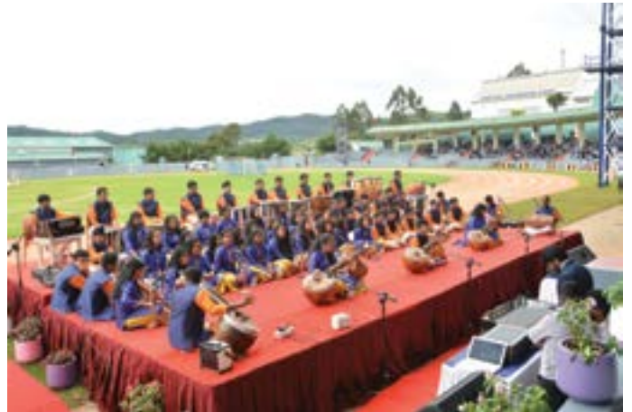
Indian music ensemble