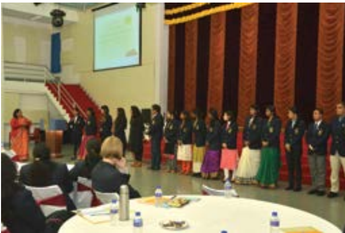
Introduction of new members of staff