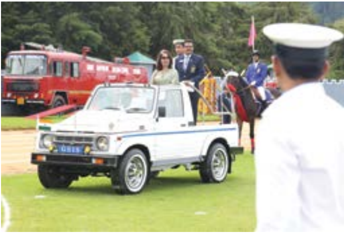
Inspection of the Guard of Honour