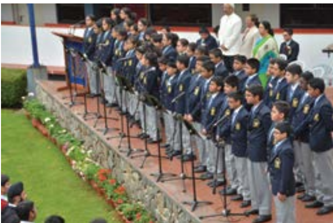
The Indian music choir singing vande mataram