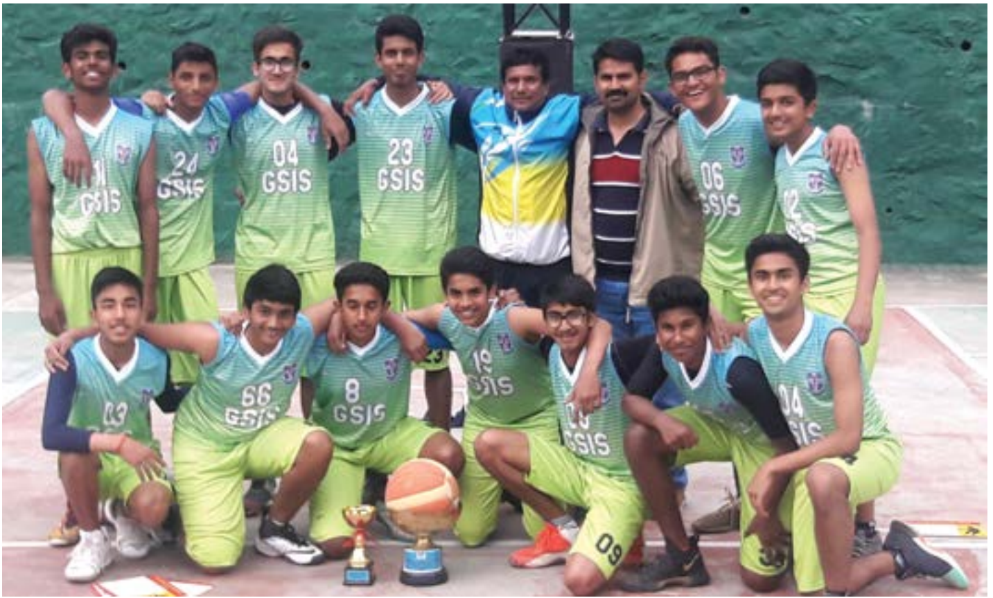
GSIS U-17 Boys' team

In the Inter School Basketball Tournament for boys held at the Palada Campus basketball courts on Sunday, 26 November 2017, Good Shepherd International School – Team A won the GSIS Rolling Trophy in the U-17 yrs category. In the final match, GSIS - Team A defeated Crescent Castle Matriculation School, Ooty. The final score was 54 points – 17 points.