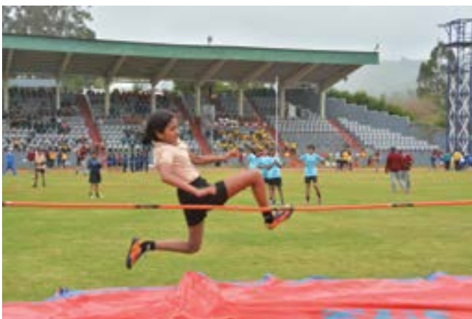
High Jump event in progress