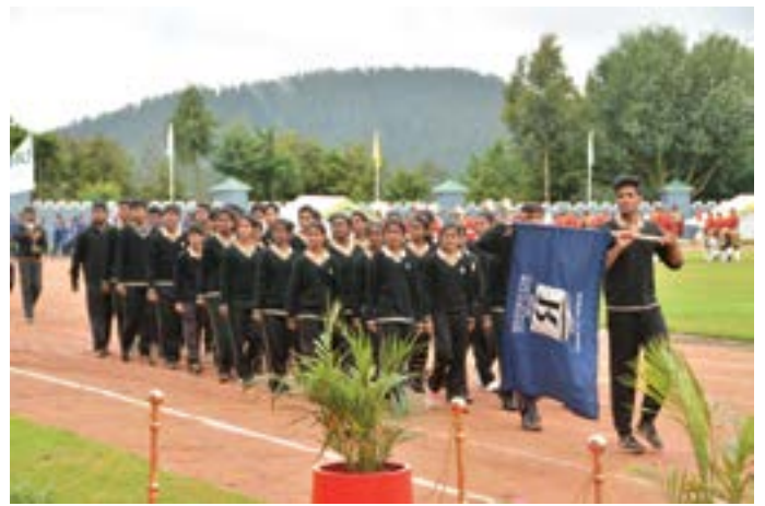
March Past of the athletes