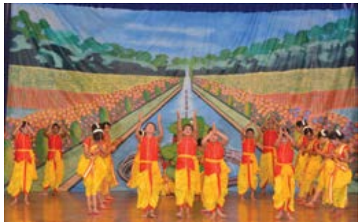
Junior students performing a Marathi folk dance