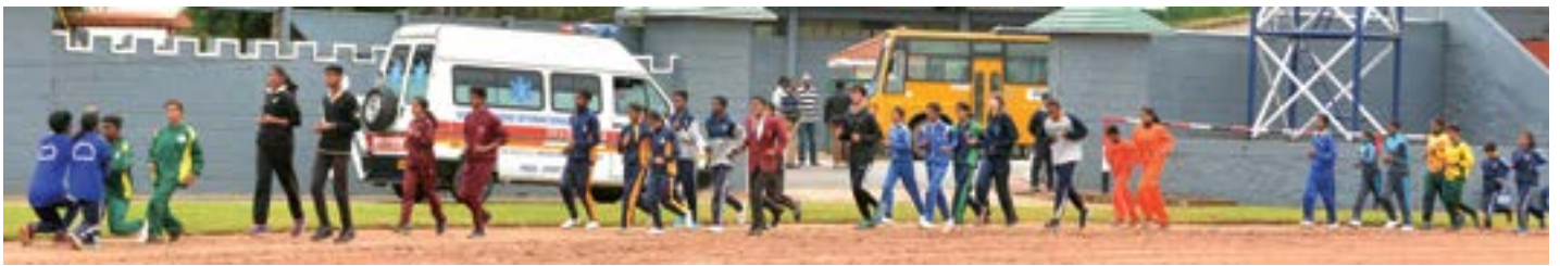
Athletic Torch Run