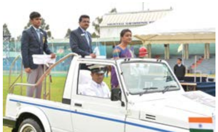
Inspection of the Guard of Honour