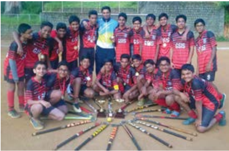
GSIS U-15 Boys' Hockey Team