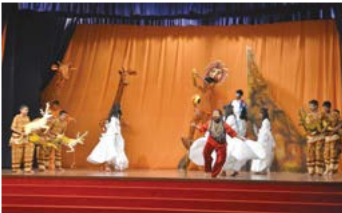
Students performing a stage show: musical presentation – Lion King