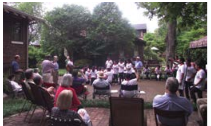
The Shepherdians along with the Rotarians in Decatur

Going for a camp in some other country fascinated me a lot. I always loved to explore. Adventure was the one thing that I always wanted to do. NASA Space Camp was another chance for me to experience something new. A group of 45 students of Good Shepherd International School along with the chaperones were in the United States Space Camp at Huntsville Alabama, USA from 29th May to 2nd June, 2017.