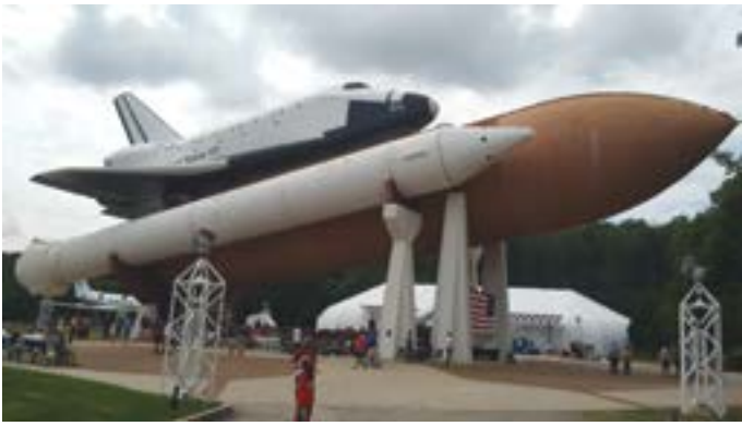
The U.S. Space & Rocket Center in Huntsville, Alabama