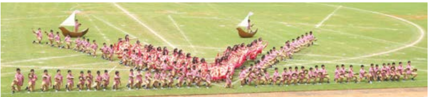
Dance display by students of junior school