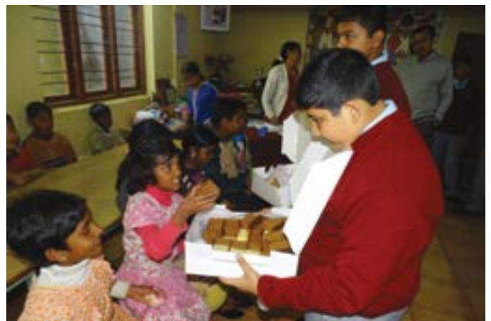
Distributing food to the children in an orphanage