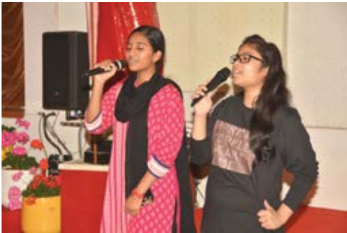
Girls singing a Hindi song