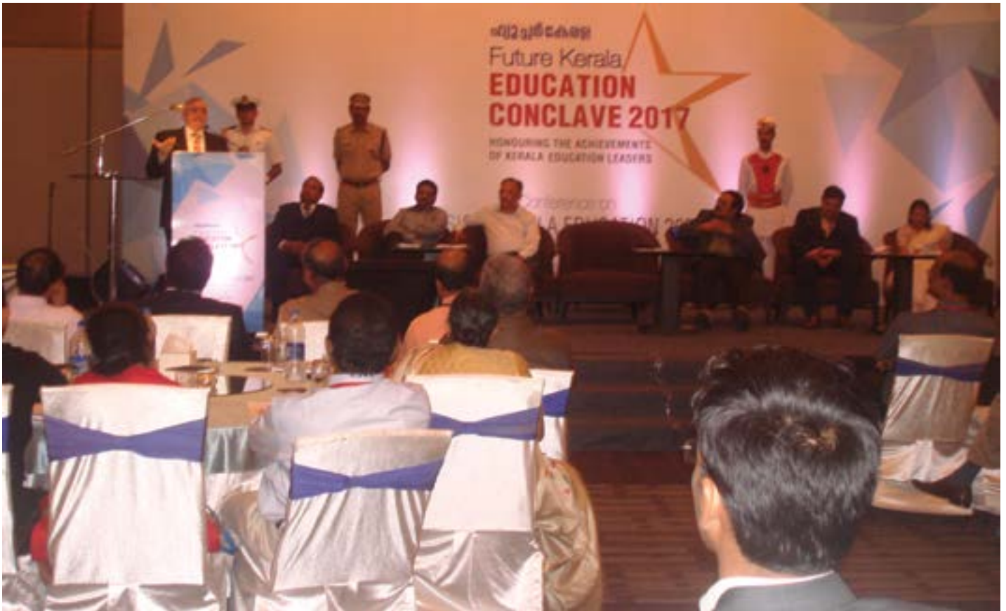
Shri Justice (Retd) P Sathasivam, the Honourable Governor of Kerala, addressing a gathering of Vice Chancellors and special invitees during the Future Kerala Education Conclave 2017