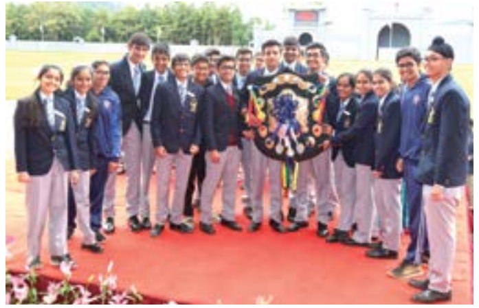
Winter House: Winner of the Cock House Shield