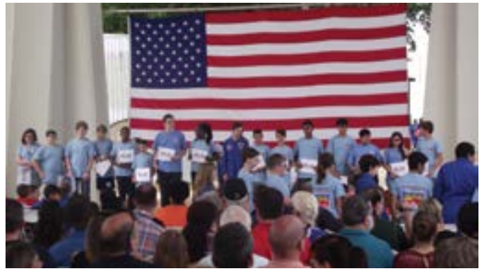
Students at the space camp