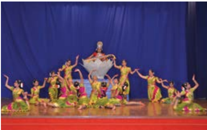
Pooja dance: Saraswathi Vandanam