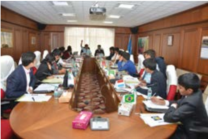
Model UN Security Council in progress