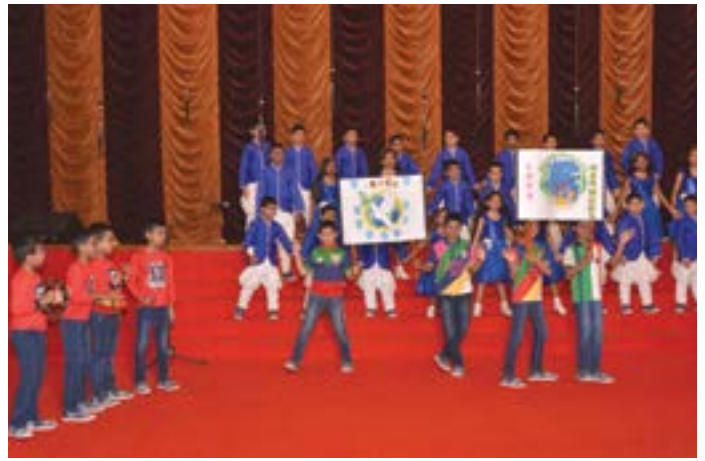
Junior School presentation