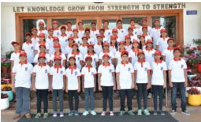
The Shepherdians along with the chaperones who attended the space camp