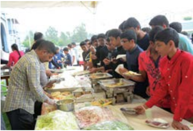
Food fete in progress