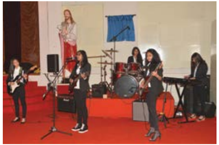
A musical presentation