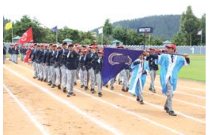
March past of the Winter House