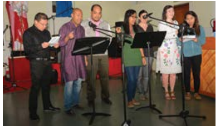
A musical presentation