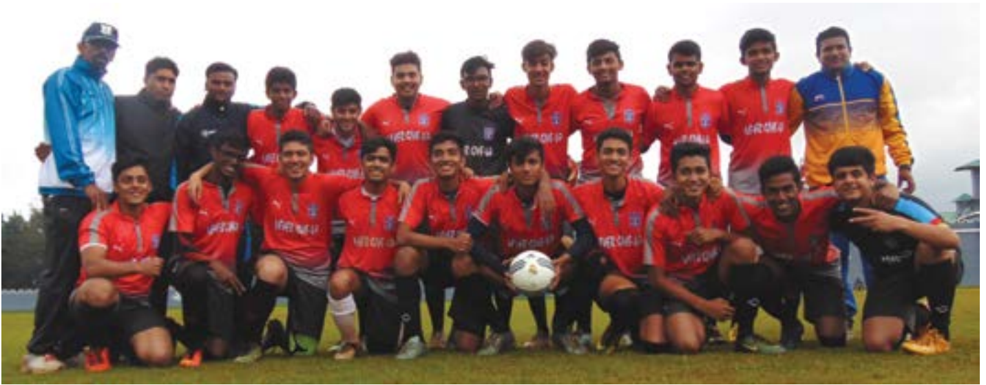
Runner-up: GSIS U-19 Boys' Football Team

Good Shepherd International School Team A emerged runner-up. In the final match, Lawrence School, Lovedale, defeated Good Shepherd International School - Team A and won the trophy. The score was 3 – 2.