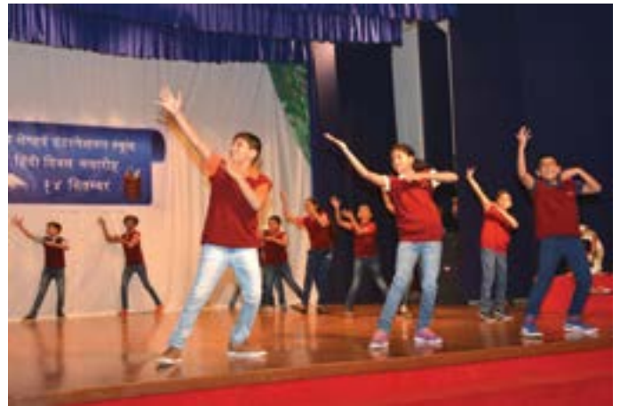
Junior students dancing to the tune of Hindi music