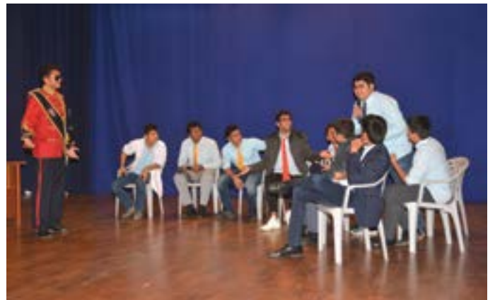
Students presenting skits

friends and beloved teachers. On the eve of 5th September, we gathered together to blend our ideas to showcase our talents. Time was short and it was running even faster, but the students of Grade XI were undeterred. We were determined to present a good performance for the teachers who had done so much for us all along our journey of learning. During the cultural event that followed, students of Middle School, High School and Higher Secondary School enthralled the audience with their musical renditions of songs, dance performances and presentation of skits. All the skits that we presented were based on the importance of teachers and their indelible impact on our young minds, which have drawn loud applause. The dances gave added colour and shine to the day.