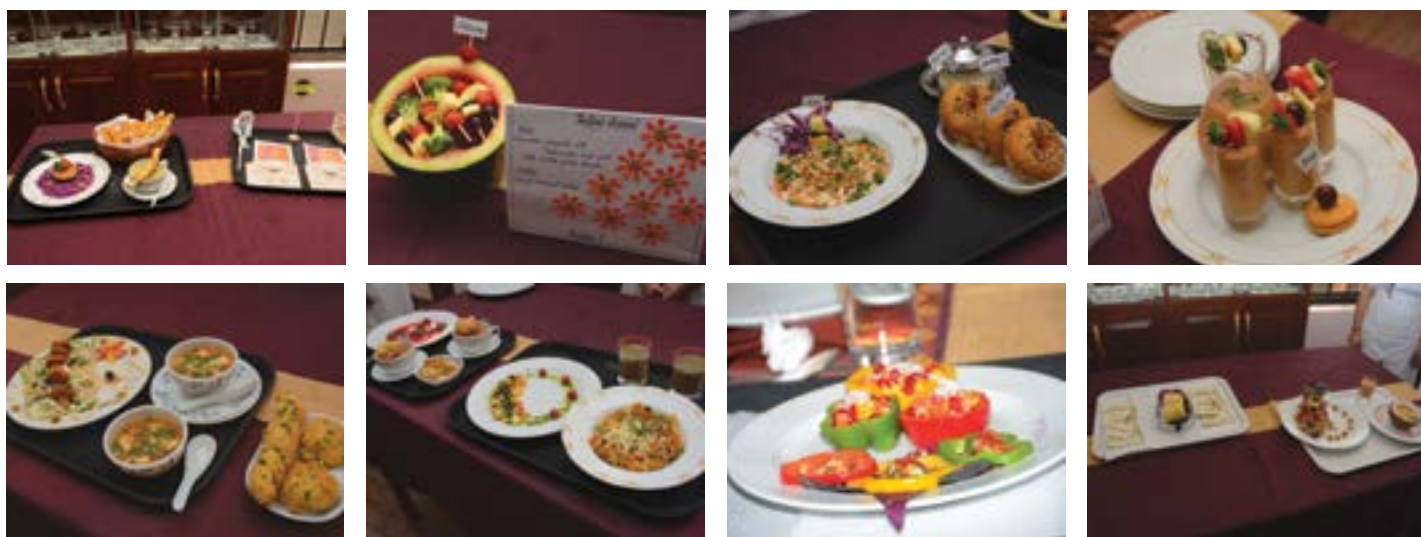
Soups, Salads & tasty accompaniments prepared by the girls of GSFS

The Soup and Salad-making Competition of the 9 Months' batch of girls was conducted at Good Shepherd Finishing School on Friday, 10 November 2017. The students presented different types of Soups and Salads with appropriate accompaniments.