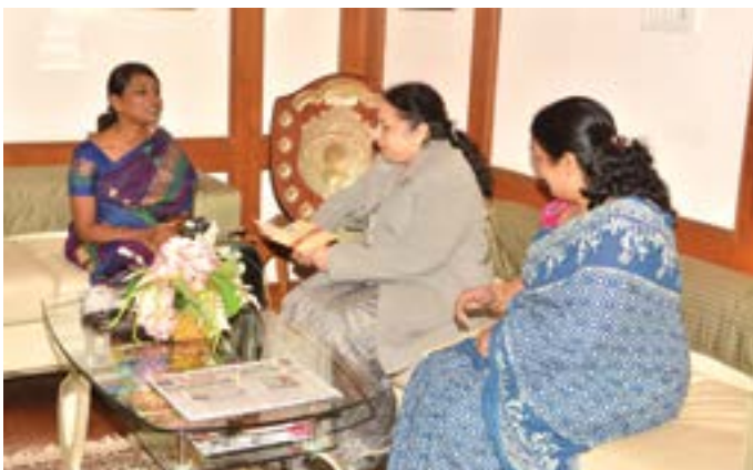
The Chief Guest along with the Senior Vice President and the Senior Vice Principal (Academics)