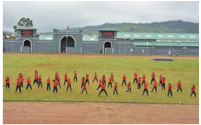
A dance display