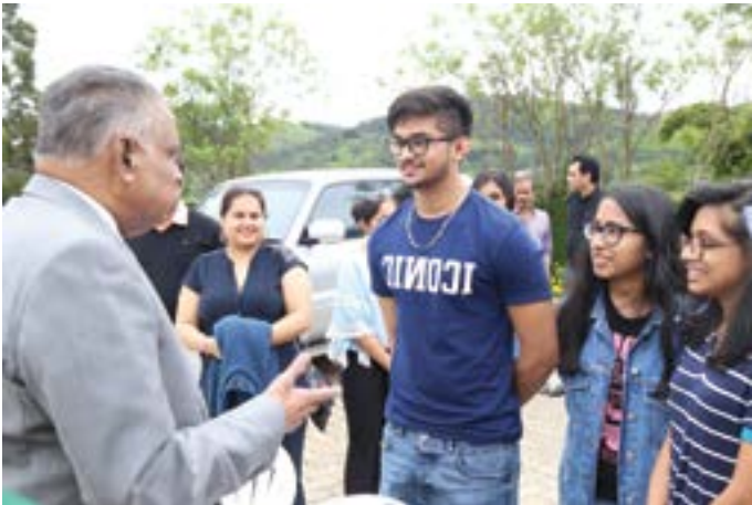
The Principal interacting with the Old Shepherdians