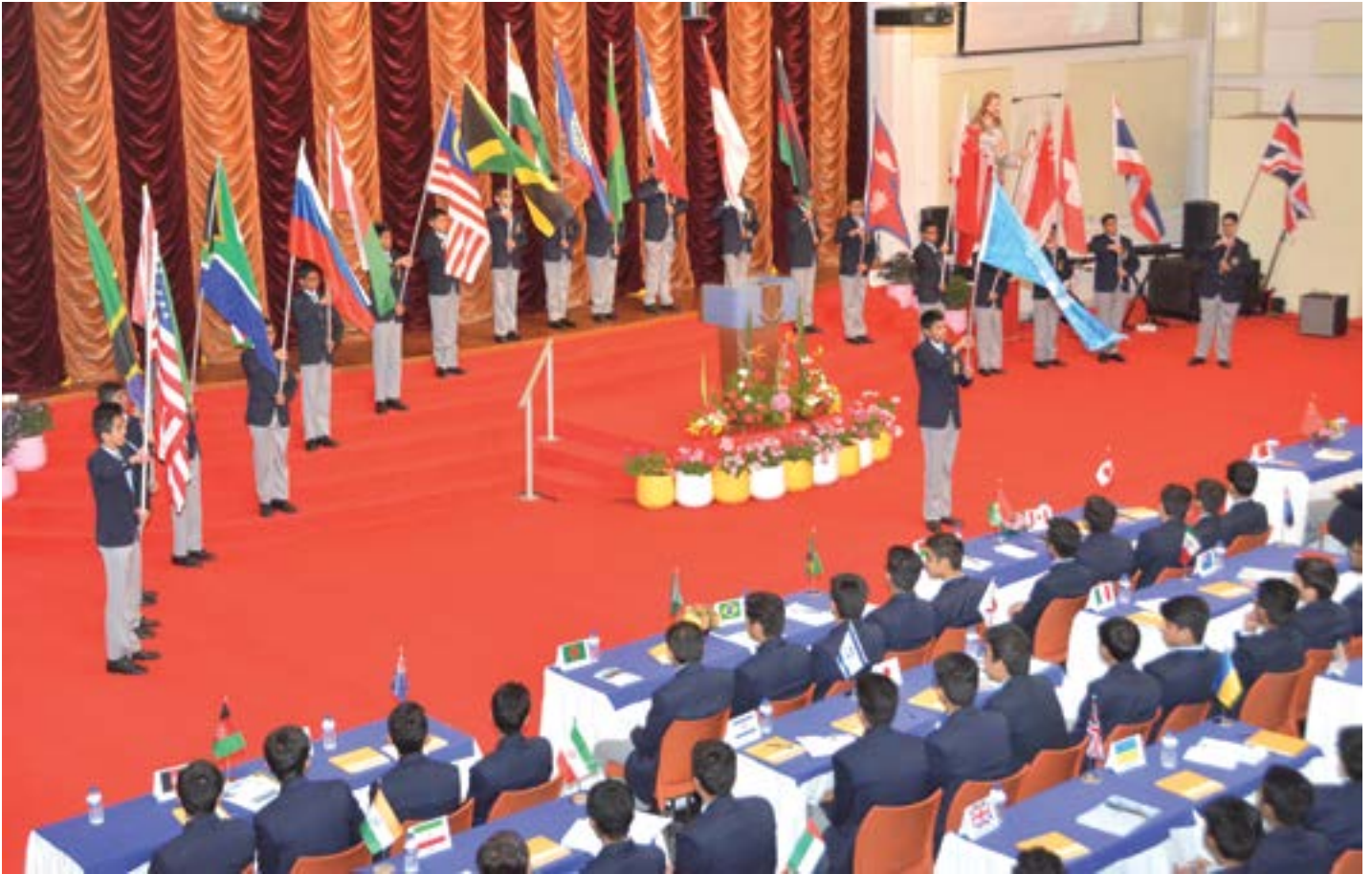
Flag presentation ceremony

Model United Nations is an educational simulation of academic activity in which students can learn about international problems, international relations, diplomacy, and the United Nations. Every year, GSMUN presents themes to highlight upon and the theme of the GSMUN 2017 was 'Global Sustainability and Maintenance of Unity amongst Nations.'