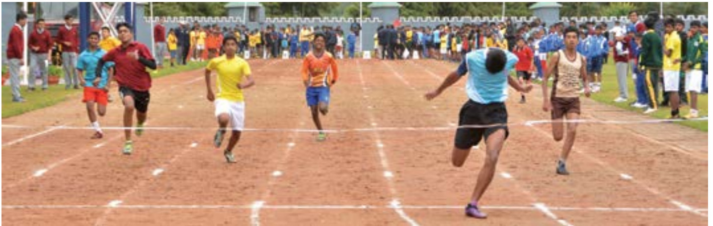
Boys participating in the 100-metre dash