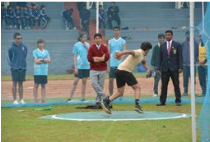
Discus throw event in progress