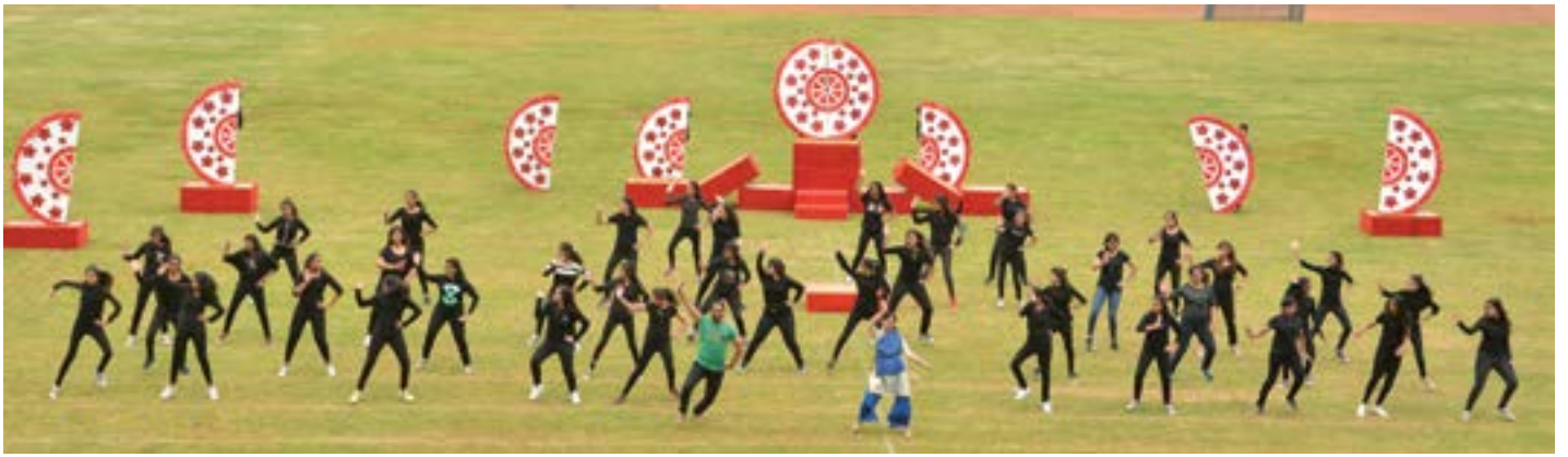
Senior girls dancing to the tune of the music