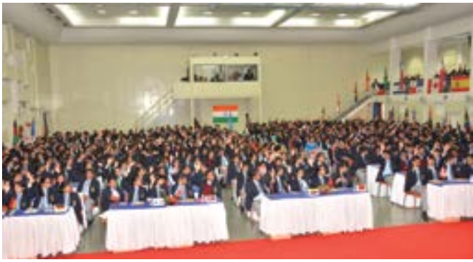
Opening ceremony of the Model UN