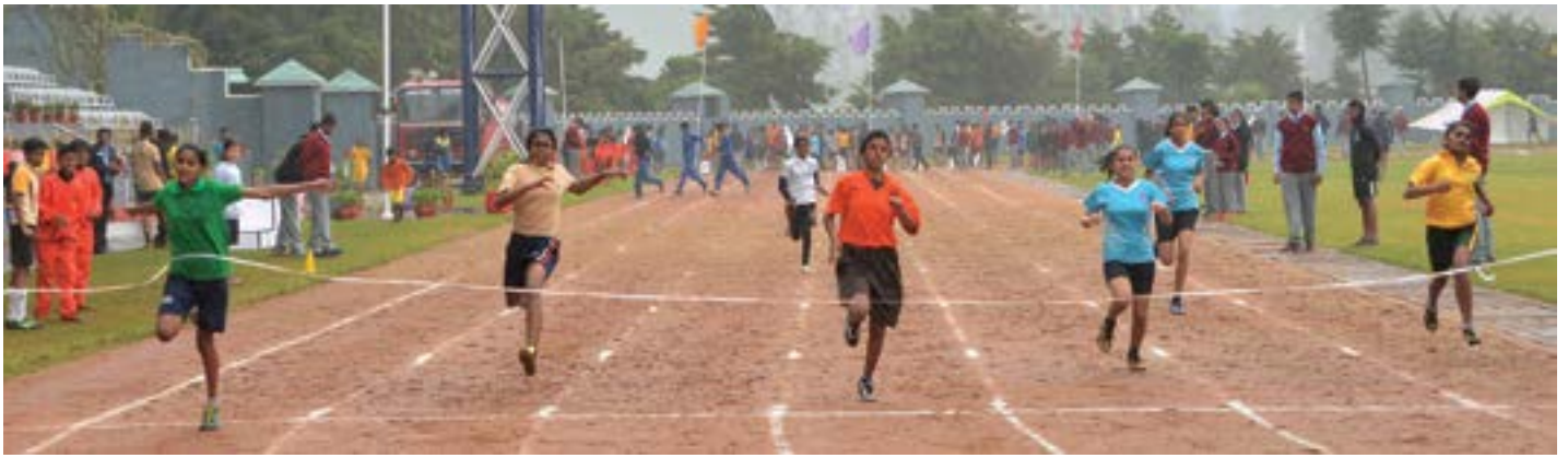
Finish of the Girls' 100-metre sprint race