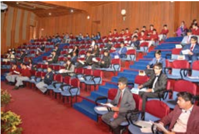
Model Economic and Financial Council [ECOFIN] session in progress