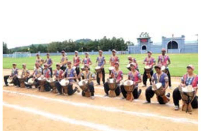
Boys playing the African djembe drums