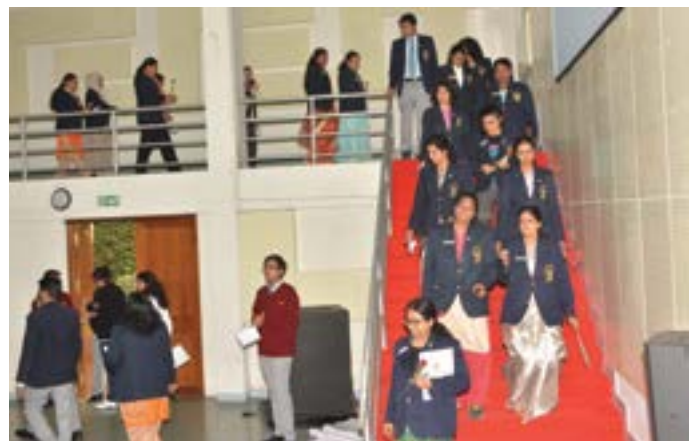
A warm welcome to the teachers on Teachers' Day

The Shepherdians celebrated Teachers' Day on Tuesday, 05 September 2017. In India, we celebrate Teachers' Day on 05 September, the birthday of the great teacher and second President of India, Dr Sarvepalli Radhakrishnan .