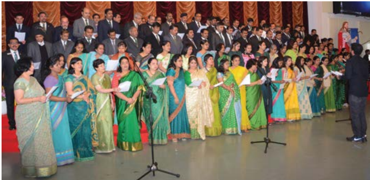
Teachers' Choir singing the school prayer song