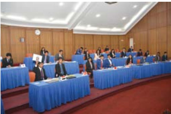
Model Special Political and Decolonization Committee [SPECPOL] session in progress