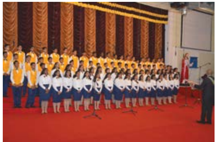
The School Choir

mind-boggling costumes and on themes of secularism and spectacular performance of the musical drama 'The Lion King'. Our tiny toddlers of the Fernhill campus brought a beautiful message of saving our environment through their Light and Dark presentation. The air was full of awe and admiration.