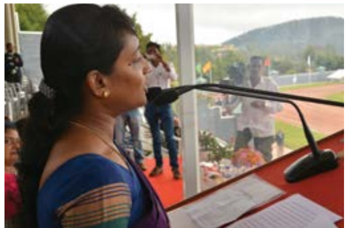
Address by the Chief Guest