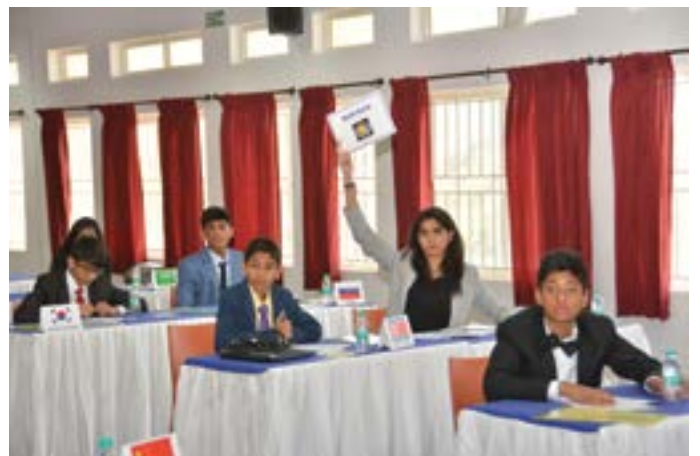
Model Social, Humanitarian and Cultural Committee [SOCHUM] in session