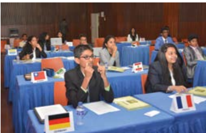
Model United Nations Human Rights Council [HRC] in session