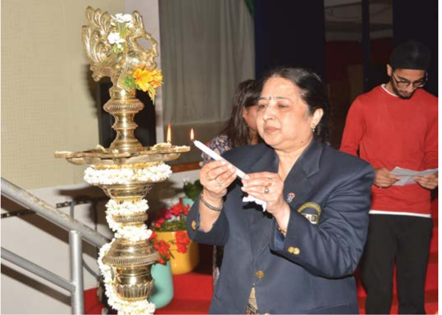
The Senior Vice President lighting the lamp on the occasion of Hindi Diwas

It was on 14 September 1949 that the Hindi language, written in Devnagari script, was adopted and approved as an official language of the Republic of India by the Constituent Assembly. The Hindi Department of GSIS, under the guidance of the Hindi teachers, organized various events on 11 September 2017 to highlight the importance of Hindi. It has to be remembered that Hindi plays a significant role in connecting the people of India.