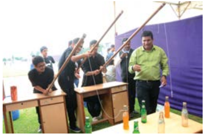
Students participating in fun games