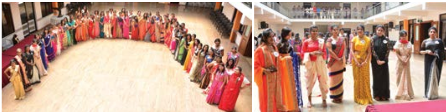
Girls of GSFS displaying various styles of sari draping

Sari is a single piece of 5 - 9 yard material, probably one of the time-honoured piece of clothing still worn today. The sari is not a costume reserved only for traditional festivals or ceremonies. It is worn by Indian ladies going about their daily chores. Women wear saris regardless of their religion, nationality, caste, class or region of origin. You have to look around if you are looking for proof of sari's persistent ubiquity. The sari is the gift of Indian tradition and it marks our ethnic culture. It is an inseparable part of most of the Indian women. According to different ethnic groups, states, religion or class, saris are draped in different styles and they represent India's multiplicity. A variety of sari-draping methods are taught to the girls. Saris reflect the cultural heritage of our country. For a country as varied as India, there are distinct differences in the ways that a sari is draped. Different draping styles include Nivi style, Gujarati style, Bengali style and Coorgi style, to name a few.