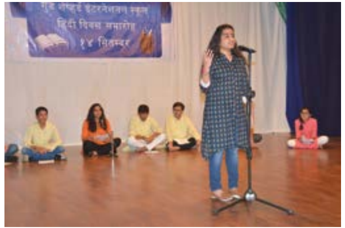
'Kavisammelan' in progress: A student reciting a poem