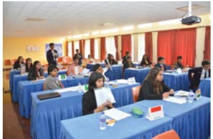
Model Economic and Social Council [ECOSOC] in session