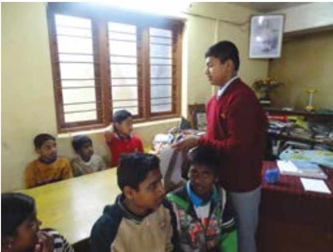
Distributing clothes to the children in an orphanage