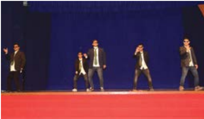
Teachers dancing to the tune of a popular Hindi song