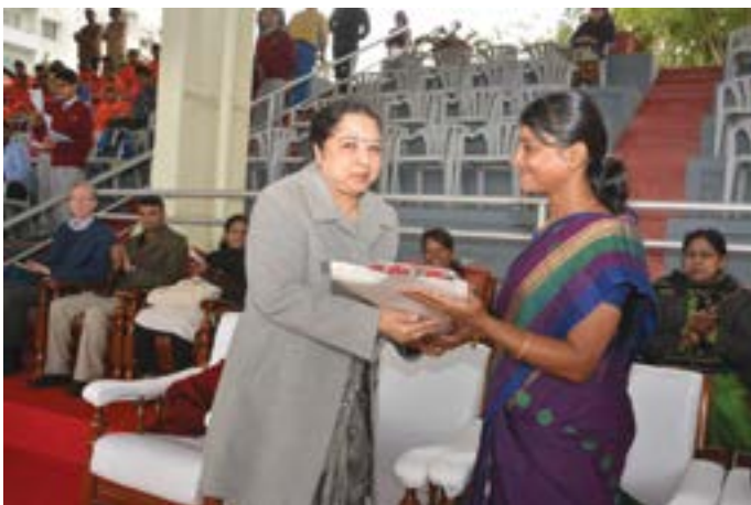
The Senior Vice President presenting a bouquet to the Chief Guest