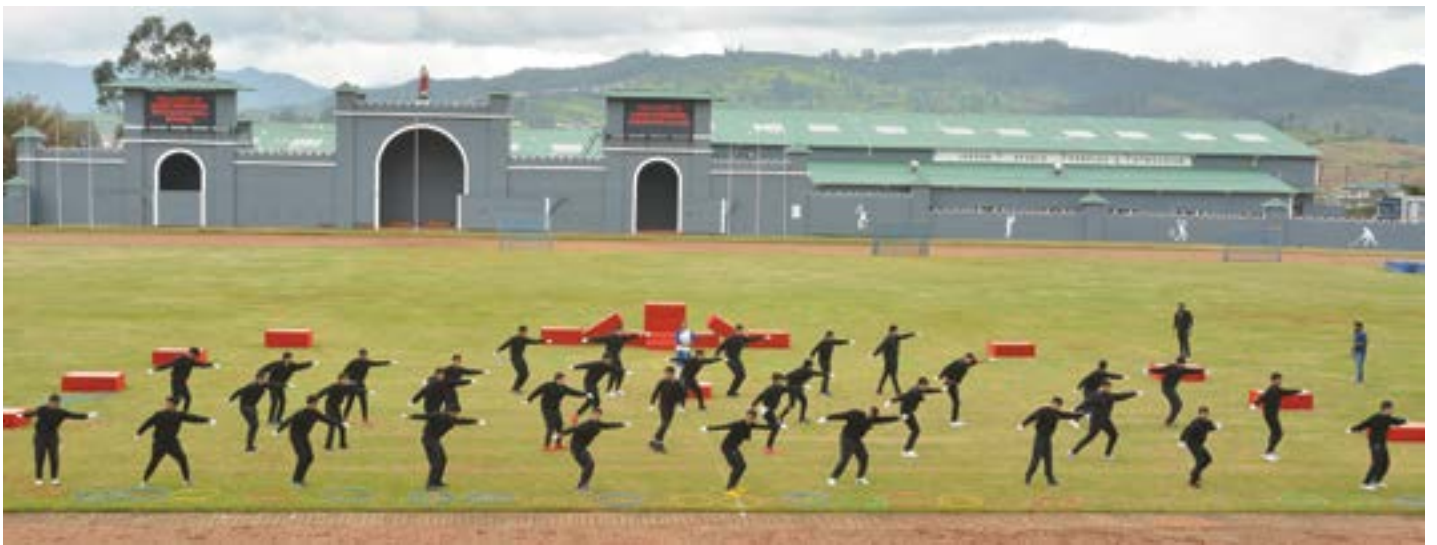
Senior boys dancing