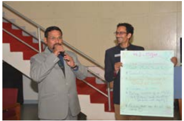
Members of staff participating in various activities