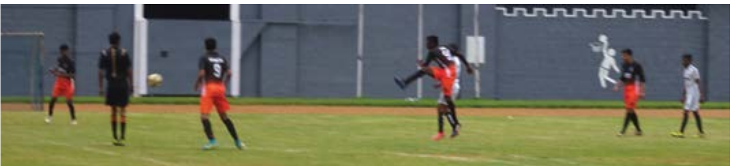
The U-17 football tournament in progress

The Annual Inter School Soccer Tournament for U-17 boys was held at the Palada Campus Open Air Stadium of Good Shepherd International School on Sunday, 26 November 2017.