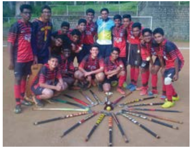
GSIS U-17 Boys' Hockey Team

The Inter School Hockey Championship for boys was held at Hebron School in Ooty from 15 November to 18 November 2017.