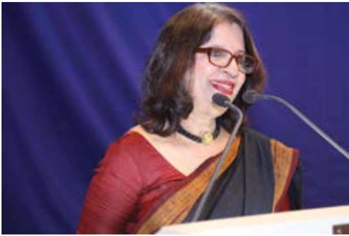
Address by the chief guest, Smt. Nirupama Rao