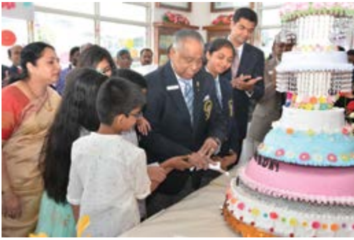
The Principal cutting the Birthday cake on 15 October 2017 along with the students whose birthday is also on 15th October