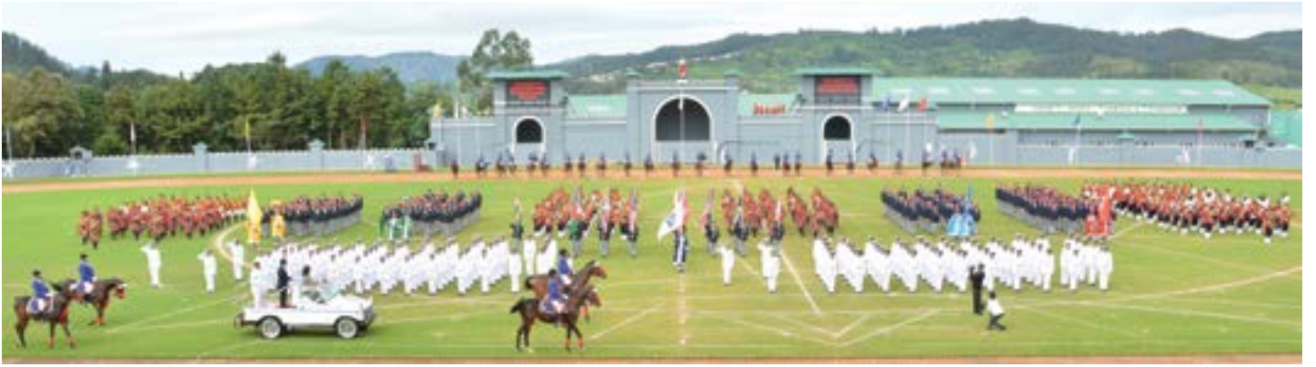
Smt. Nirupama Rao inspecting the Guard of Honour