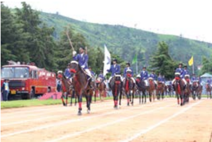
March past of the horse contingent