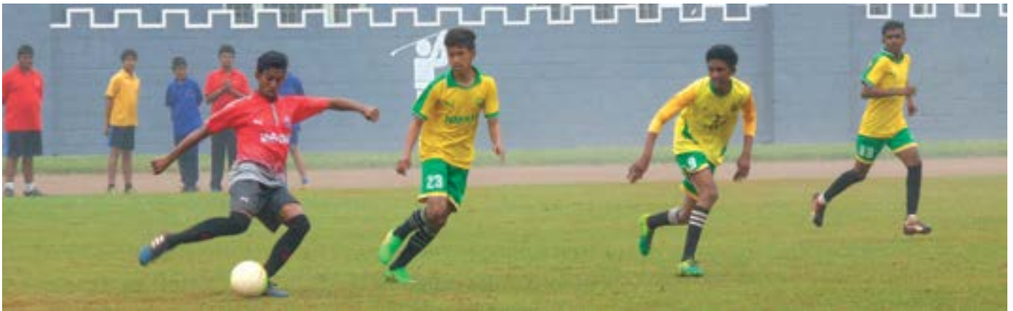
The U-19 football tournament in progress

The Annual Inter School Soccer Tournament for U-19 boys was held at the Palada Campus Open Air Stadium of Good Shepherd International School on Sunday, 05 November 2017.