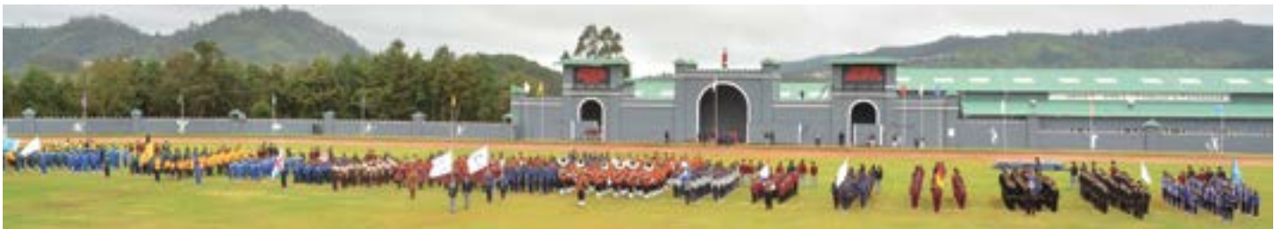
Students of participating schools assembled on the athletic field