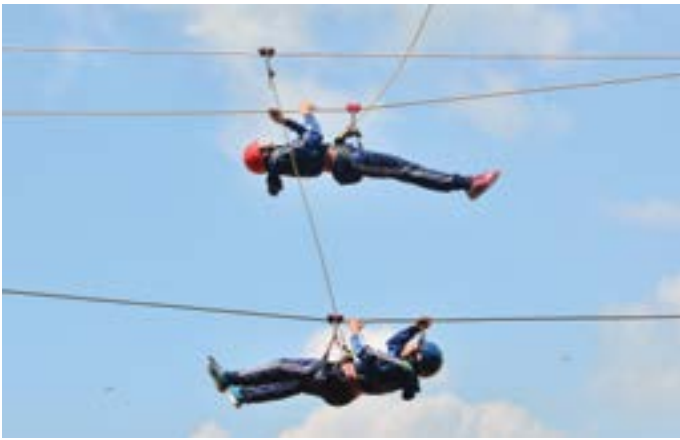
Display of mountaineering skills