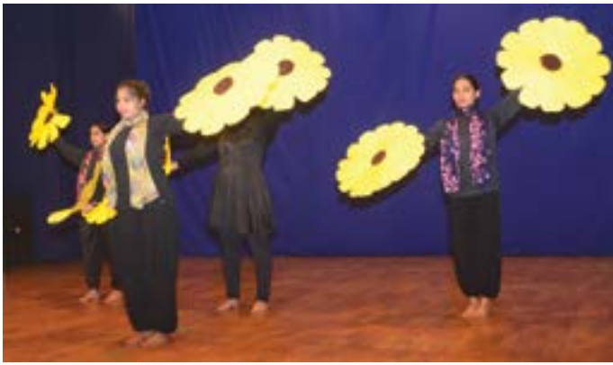
Teachers presenting a yoga dance