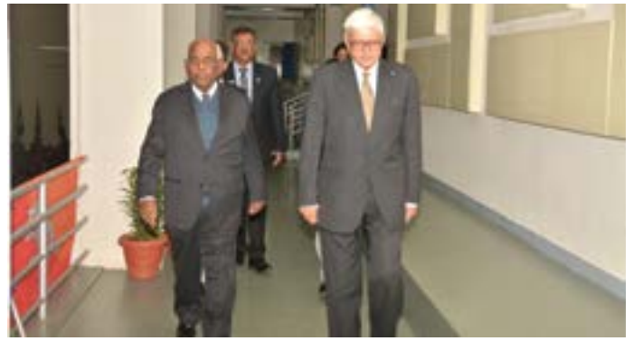
Mr Gopal Krishna Gandhi, IAS (Retd) at the opening ceremony