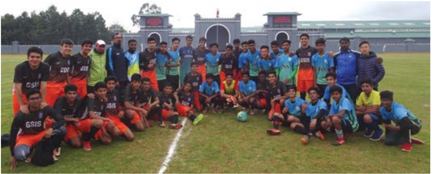
JSS International School team (Winners) & the GSIS team (Runner-up)

The following students received special prizes: