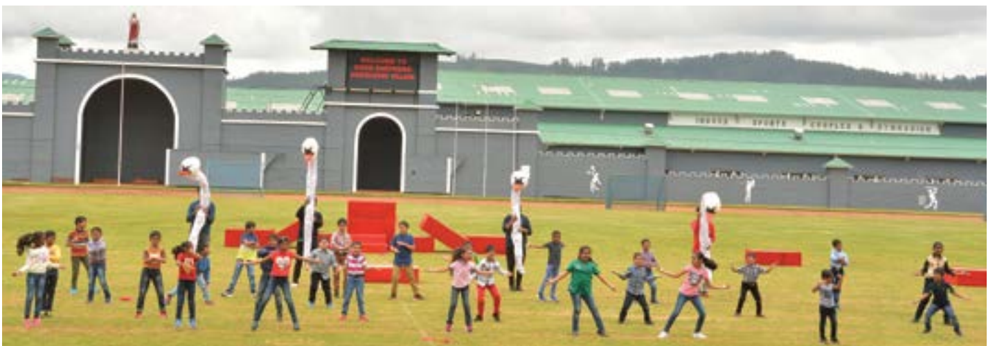
Dance presentation of the Junior students