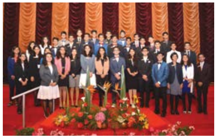
Student officers who participated in the GSMUN 2017