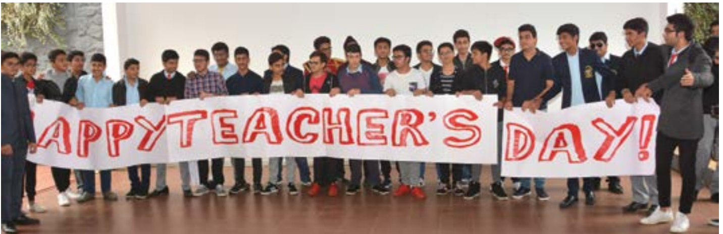
Students showing their appreciation to the teachers for planting the seeds of knowledge that will last a lifetime