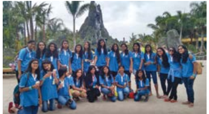
Girls near the Volcano Bay, a water theme park in Orlando

The students were invited to attend a pizza lunch and meet the dignitaries and members of the Rotary Club of Decatur, Alabama. The students organized a small cultural event during which they presented souvenirs to the Rotarians. Our students learned a lot about American food and lifestyles during the interaction.