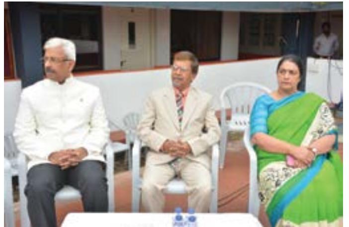
The Chief Guest along with the Senior Vice Principals of GSIS