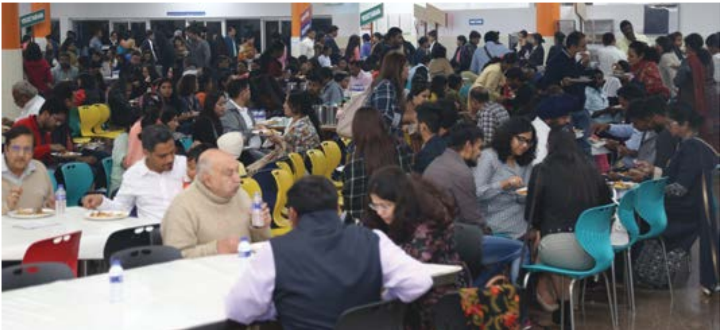
Parents and guardians in the dining hall enjoying dinner on 15th October

our Founder-Principal for the contribution to the development of global citizens and international education programmes. Deserving trophies and medals were awarded to the ones, 'who ran to win and won to lead'. The day ended in a joyous mood with the children looking forward to going home for the mid-term break.