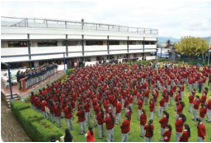
The assembly in progress