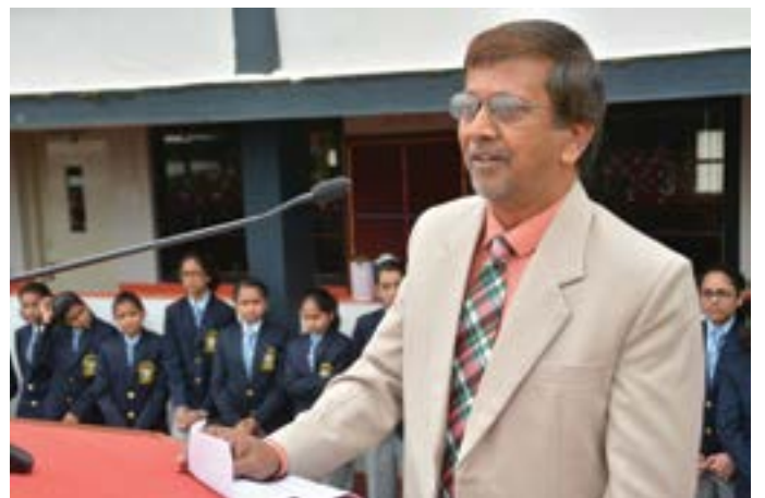
The Chief Guest addressing the students and staff