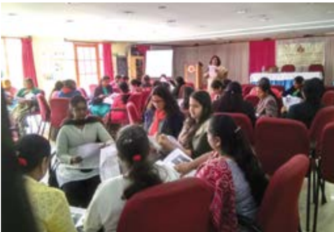
The seminar in progress at HOTEL PREETHI CLASSIC TOWERS in Ooty