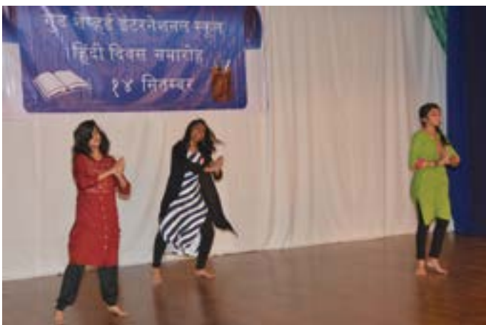
Girls dancing to Hindi songs