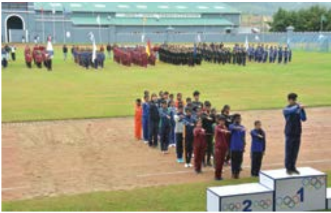
Athletes taking the Oath