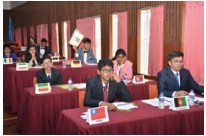
Model United Nations Office on Drugs and Crime [UNODC]