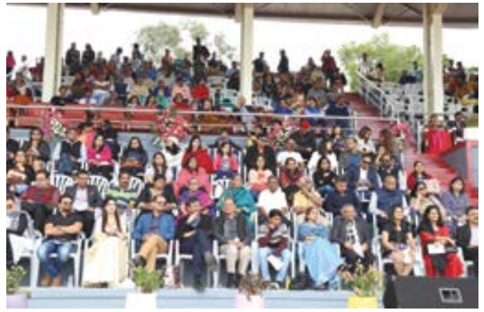
View of spectators in the stadium