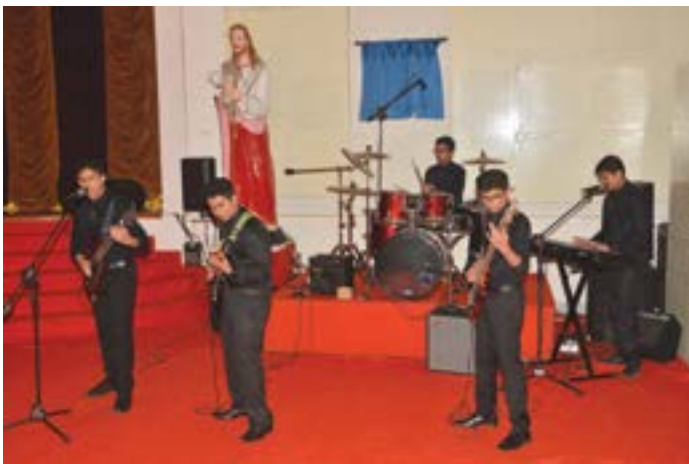
A musical presentation