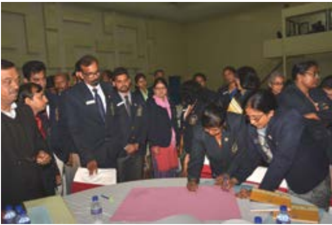
Members of staff attending a workshop