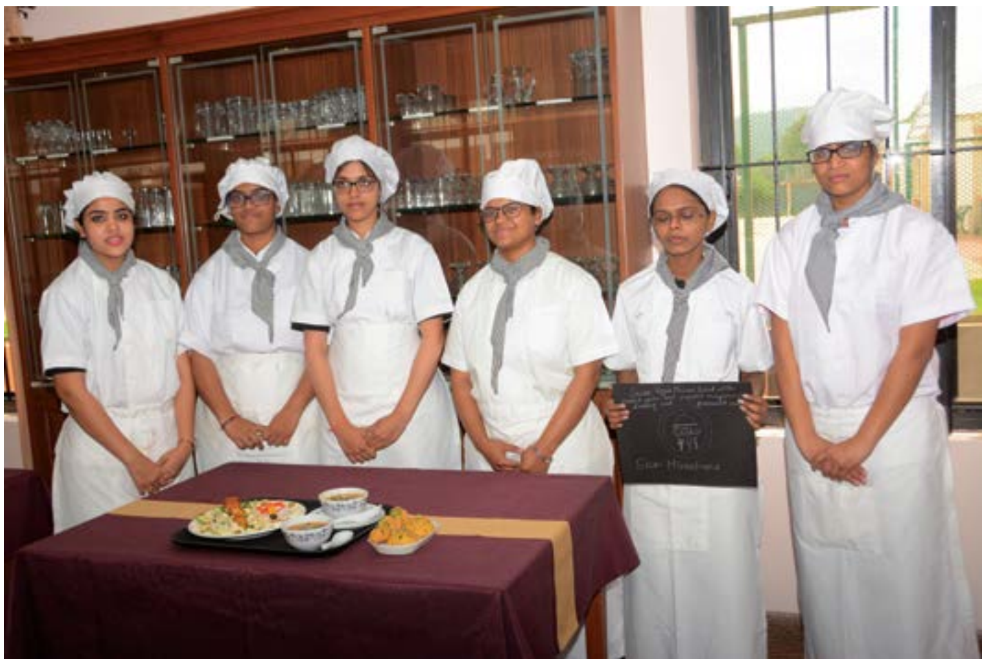
The girls' team that won the first position