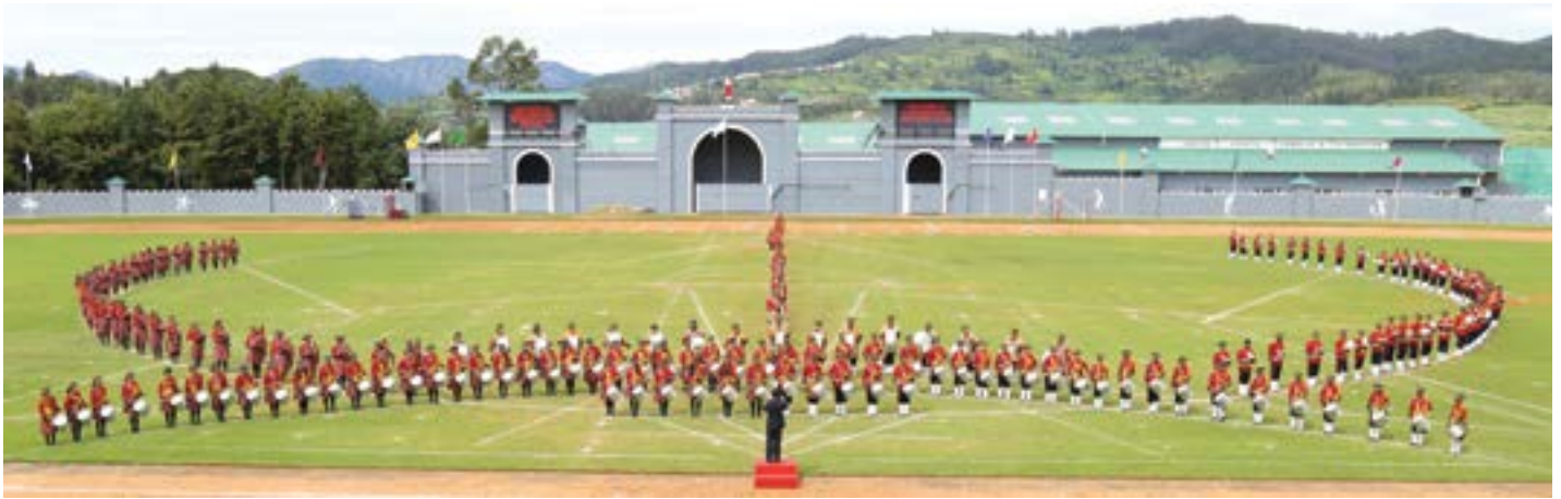
The Band Display in progress