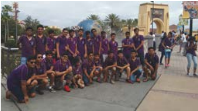
Boys at the entrance to the Universal Studios in Florida