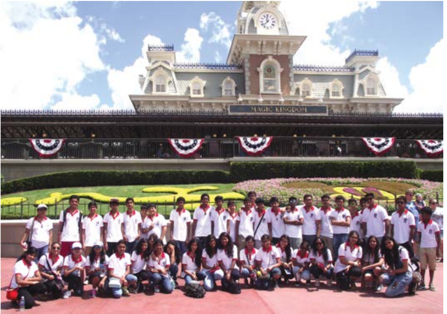
The Shepherdians when they visited Magic Kingdom, a theme park at the Walt Disney World Resort in Bay Lake, Florida, near Orlando in the United States