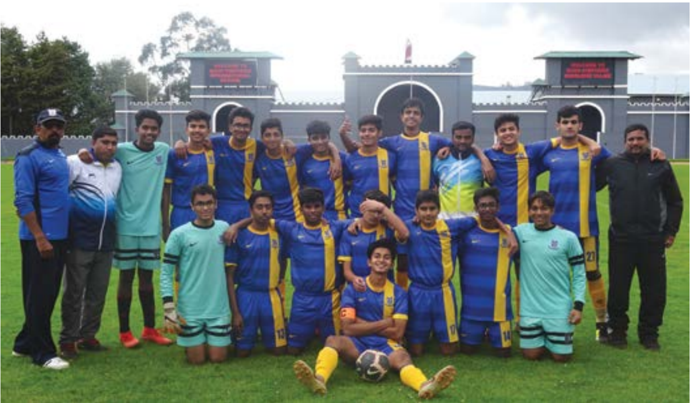
GSIS U-19 boys' football team

The Inter School Soccer Tournament for U-19 boys was held at the Open Air Stadium in the Palada Campus of GSIS on Sunday, 15 September 2019.