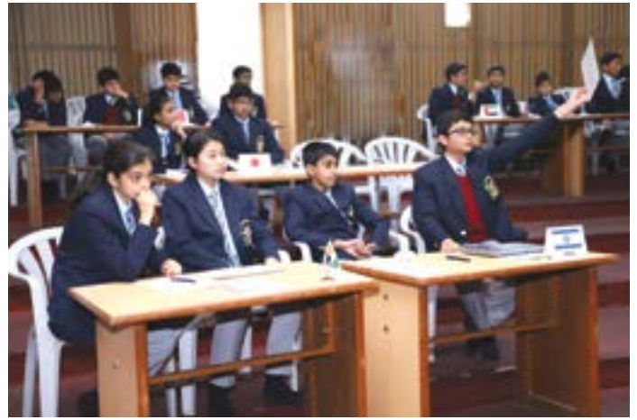
Model United Nations Entity for Gender Equality and Empowerment of Women (UNW) session in progress