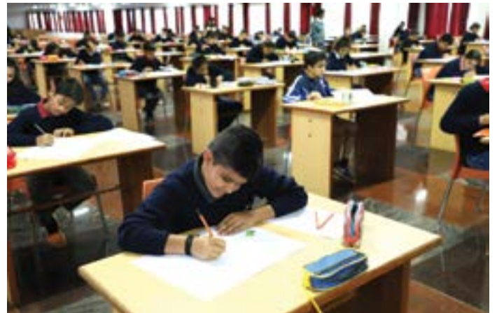
A painting contest to commemorate Gandhi Jayanti