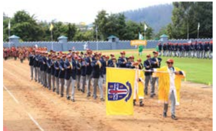
March past in progress