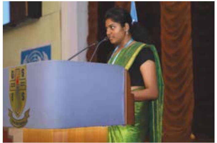
Reflections on the learning experience with Model UN

"I believe that children are our future. Teach them well and let them lead the way."