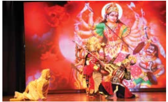
Students presenting 'Navadurga', a classical dance