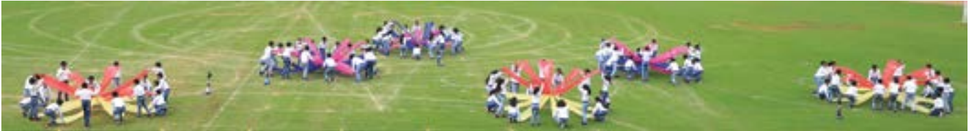
Junior students of the Fernhill Campus performing a dance