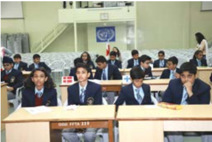
Model United Nations Environment Programme (UNEP) session in progress