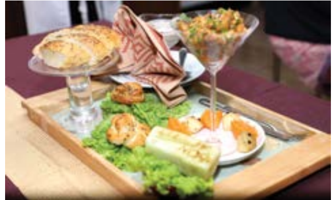
Soups and Salads prepared during the event