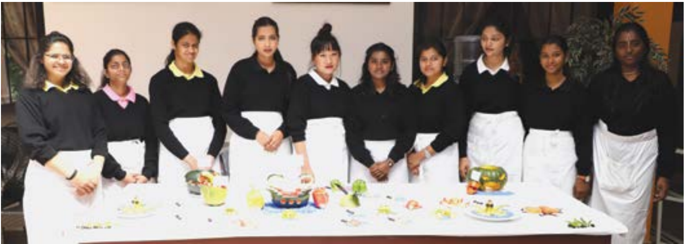
2nd Place: Team Elegance