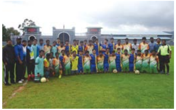
GSIS and SDAT teams

Good Shepherd International School was runner-up in the tournament. In the final match, SDAT (Sports Development Authority of Tamil Nadu) Team defeated Good Shepherd International School (Final score: 2 – 0). The following students received special prizes for their outstanding performance in the tournament: