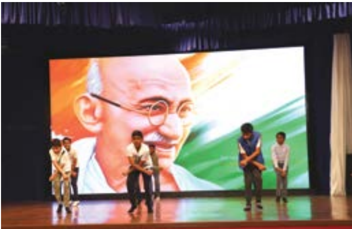
Middle School students performing a dance