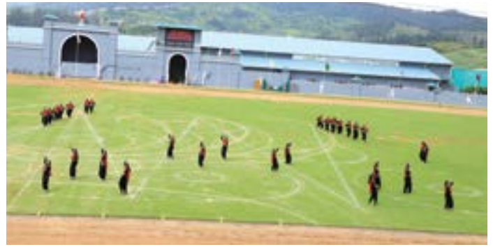
Students of GSFS performing a contemporary dance