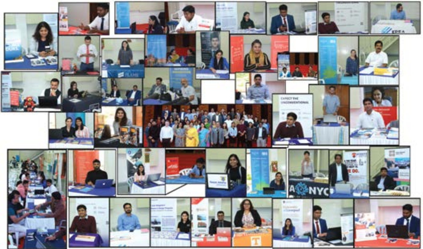
Education Fair of Indian and foreign universities at GSIS

GSIS hosted an Education and Career Fair at its Palada Campus auditorium on Friday, 18 October 2019. Representatives of 41 universities from India and abroad attended the Fair. Representatives of foreign universities in the USA, Canada, Australia, Dubai, Switzerland, Singapore, the United Kingdom, Germany, Ireland and Japan were also present. Representatives of the following Indian and foreign universities attended the event: