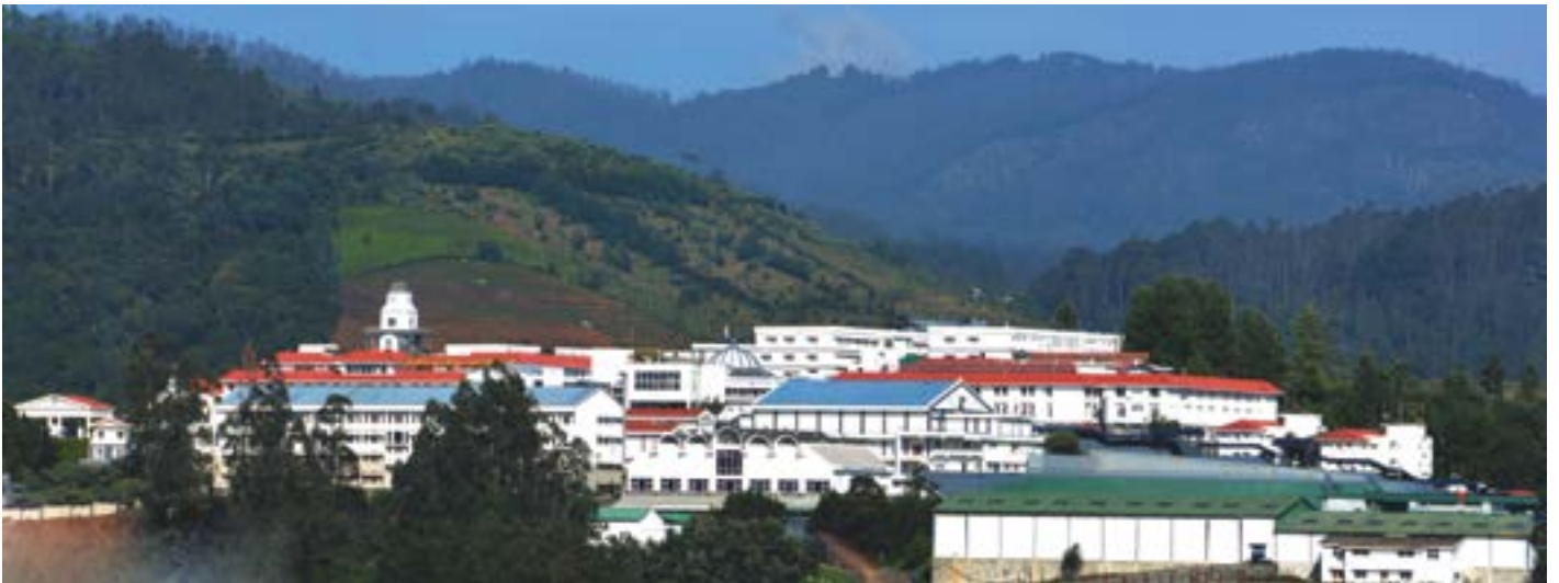
Good Shepherd International School – Palada Campus

We are happy to inform you that according to EducationWorld India School Rankings (EWISR) for 2019-2020 , Good Shepherd International School is ranked the No.1 International Residential School in Tamil Nadu and the No. 2 International Residential School in India for the year 2019. The school is ranked India's No.1 in the following parameters of excellence - Co-curricular Education, Infrastructure Provision, Safety and Hygiene - and No. 2 in Pastoral Care.