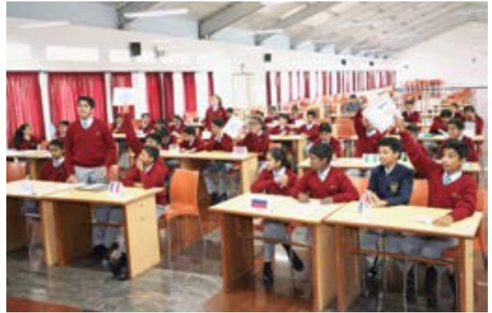
Model UN High Commissioner for Refugees (UNHCR) session in progress