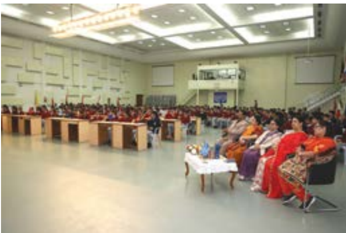
Closing Ceremony of the Model UN in progress