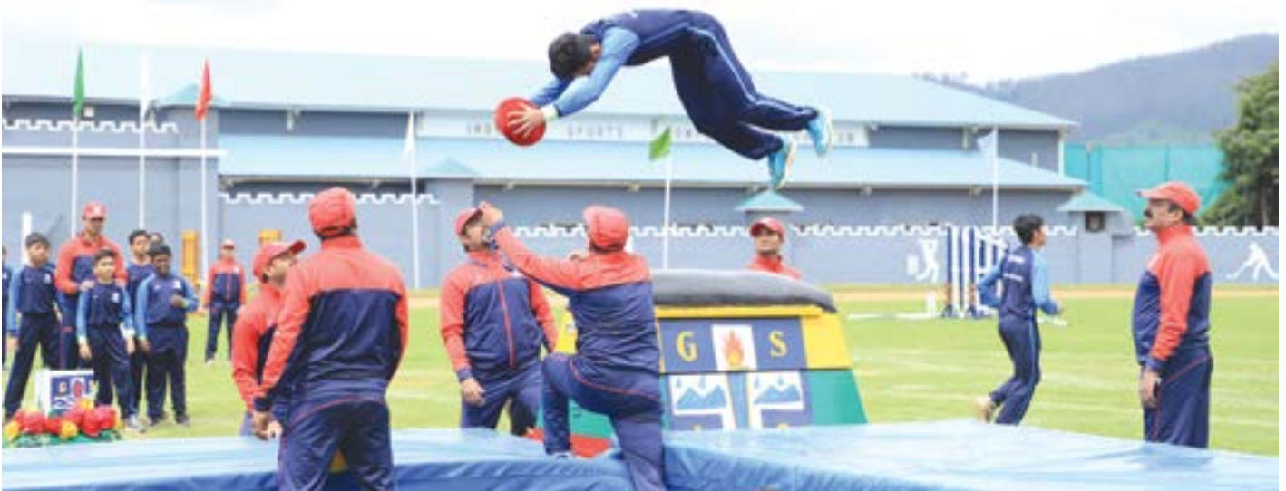
Our boys performing somersault during a gymnastics display