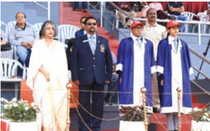
The Chief Guest observing the march past of the students