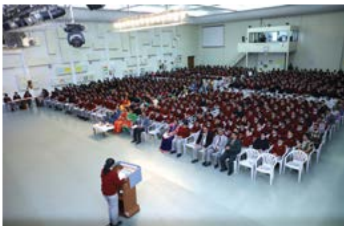
Special Assembly in the auditorium on 2 October 2019