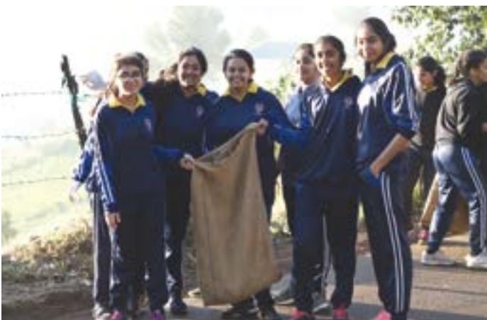
Students pick up roadside litter while participating in the 'Fit India Plogging Run'