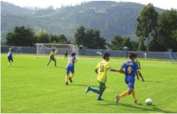
The final match in progress