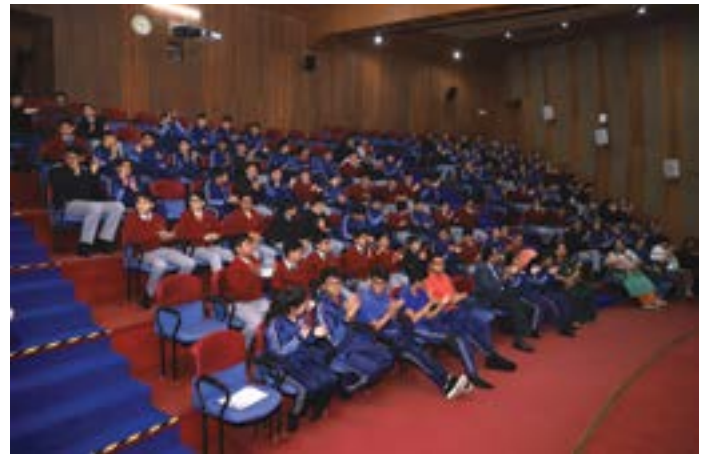
An enthusiastic young audience of the Middle School enjoying the plays presented by the IBDP students