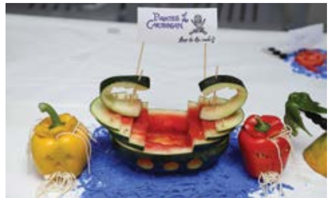
Fruit and Vegetable Carving: With fruits and vegetables, one can carve a lot of interesting and lovely shapes, patterns and designs

Fruit or Vegetable Carving is the art of carving vegetables or fruits to form beautiful objects such as flowers, leaves, birds and animals. In this ancient art which was more prevalent in countries like Japan, China, Thailand and in Europe, a variety of fruits such as watermelons, cucumbers, carrots, apples, papayas, strawberries, pineapples or cantaloupes are carved into attractive shapes that are also edible.