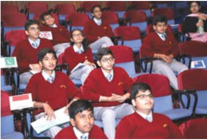
Model Social, Cultural and Humanitarian Committee (SOCHUM) session in progress