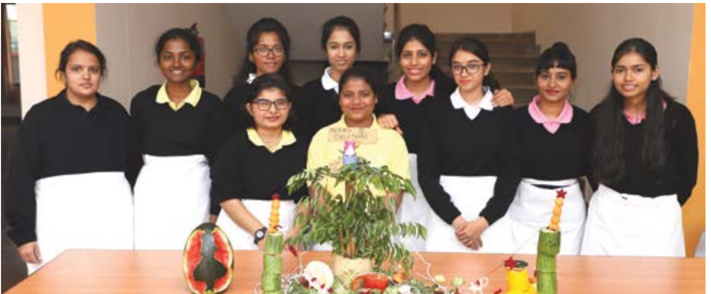
3rd Place : Team Excellence