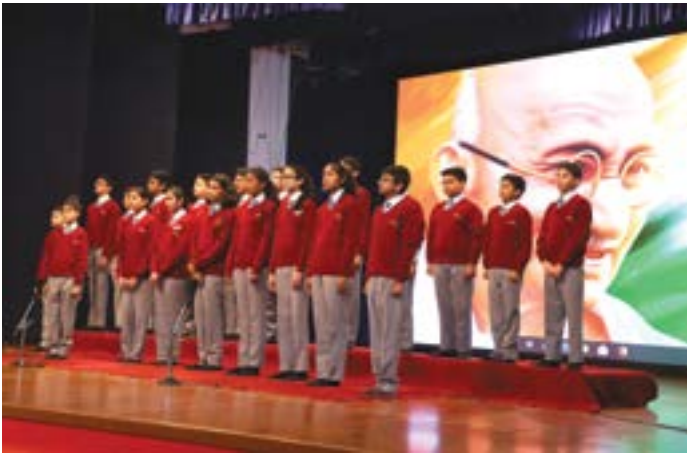
School choir singing the Ram bhajan, 'Raghupati Raghav Raja Ram...'