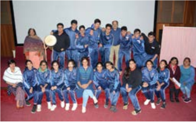
Students of IBDP seen along with their teachers and resource personnel