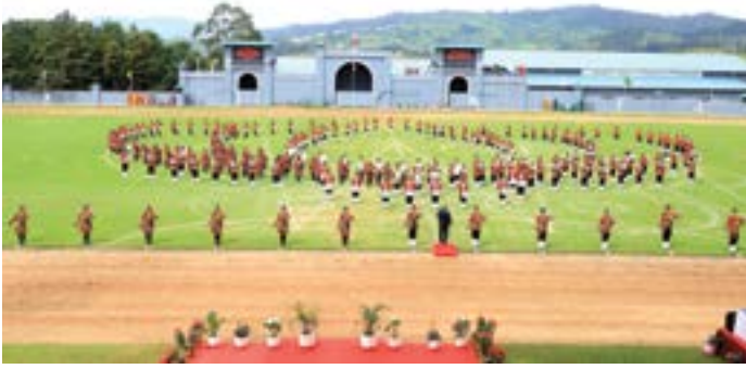
Brass and pipe bands performing during the Founder's day celebrations