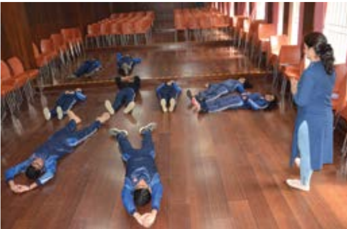
Students gaining practical theatre experience during the workshop