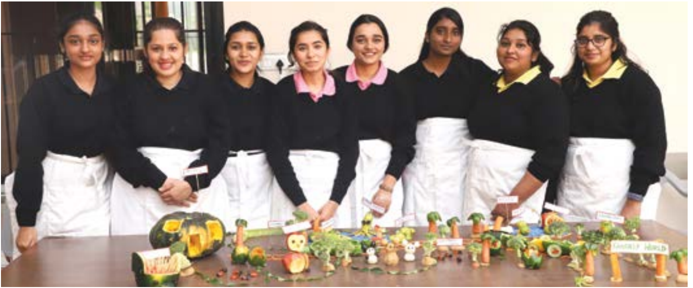
1st Place: Team Emancipation