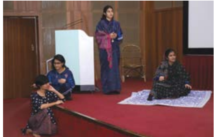
IB students presenting a skit