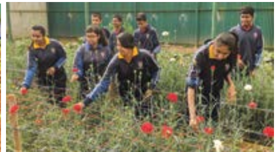
Students working in the Palada Campus to grow plants and exotic flowers in the greenhouse

The School Enterprise Challenge is a free educational programme that teaches students business and life skills. The programme is run by the educational charity, Teach A Man To Fish , one of UK's leading charities, providing young people from around the world with the opportunity to develop 21st century skills through their school-business model. The charity was set up in 2006 to enable teacher and student teams to set up and benefit from a school business.