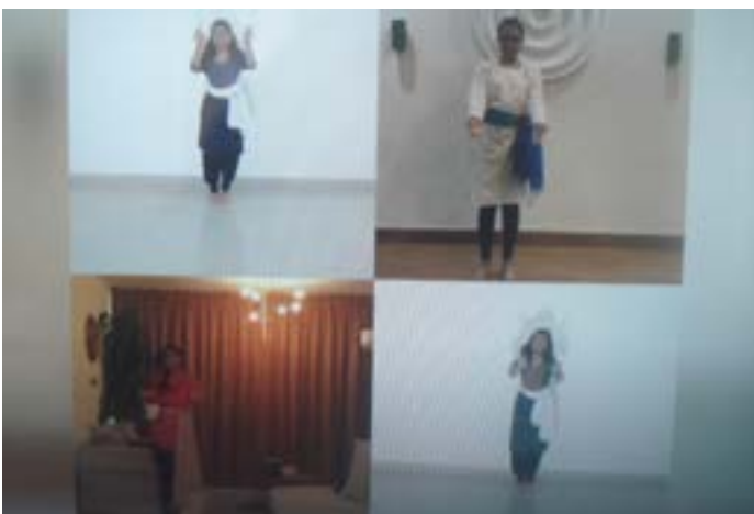
Patriotic dance by the girls