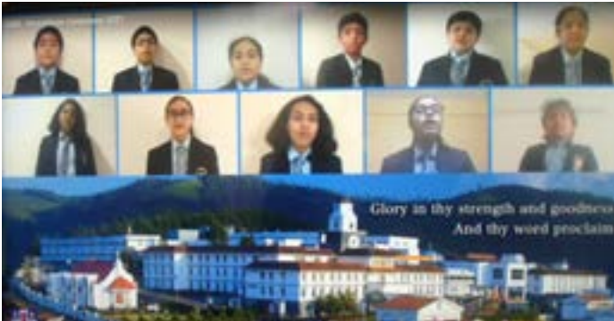
The school choir singing the school song