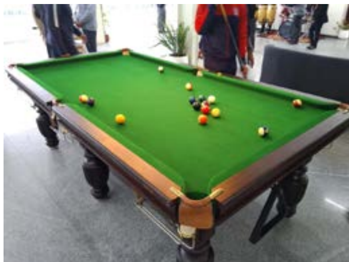
Facility to play billiards

The goal is to relieve stress and promote relaxation in the workplace. The amenities support the school's commitment as we progress towards an exciting future of sport, fitness and wellness. Indoor space is provided to play carrom, chess, air hockey, table soccer, snooker, billiards and dartboard game. More facilities will be added. The school is committed to maximising the opportunities provided to staff to play sport, keep fit and have fun whilst working in the school. The school's commitment to provide these amenities is an exciting milestone to ensure the wellbeing of the staff. The new recreation and wellness facility will cater to the present and future needs of our community.