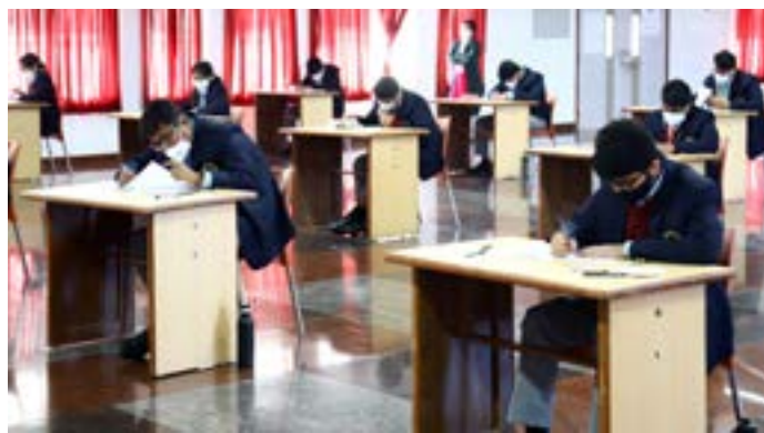
Students in the examination hall