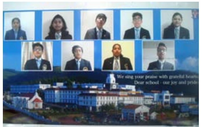
Students singing the school anthem

"A nation's culture resides in the hearts and in the soul of its people."