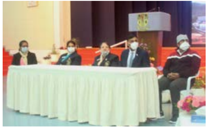
The open forum in progress