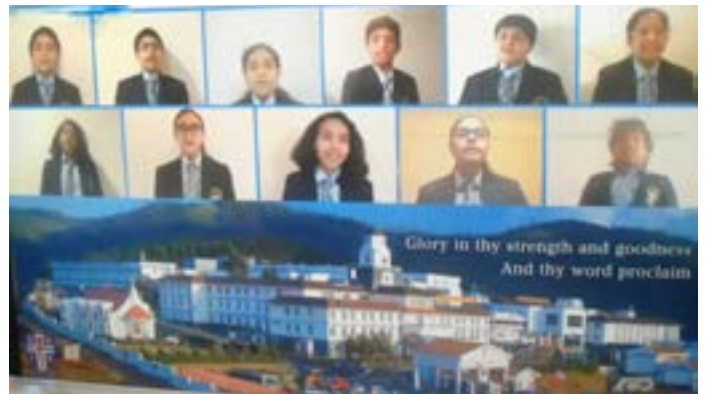
The school choir singing the school song