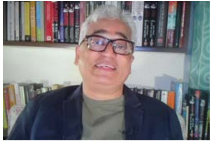
Address by the senior journalist, Mr Rajdeep Dilip Sardesai