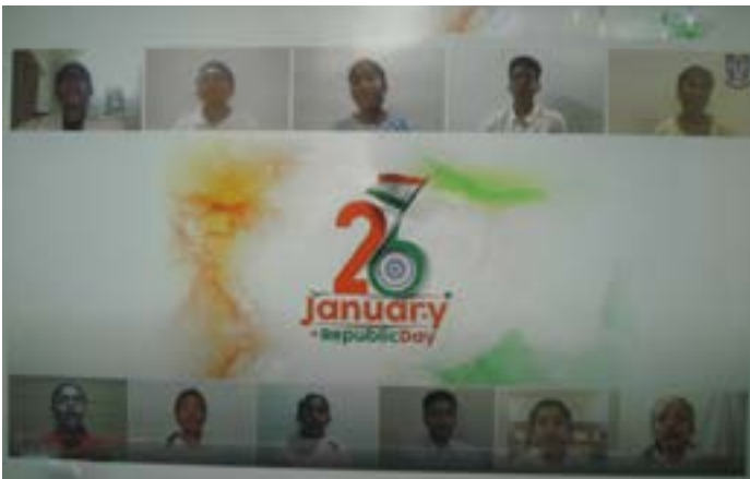
The Indian music choir singing the patriotic song, 'Chhodo Kal Ki Baatein'