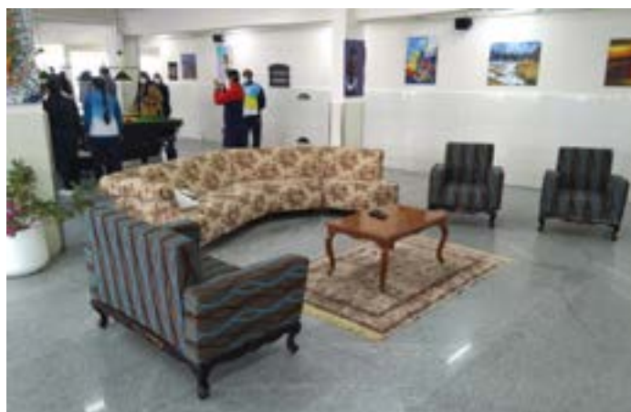
Amenities provided at the Staff Recreation Centre