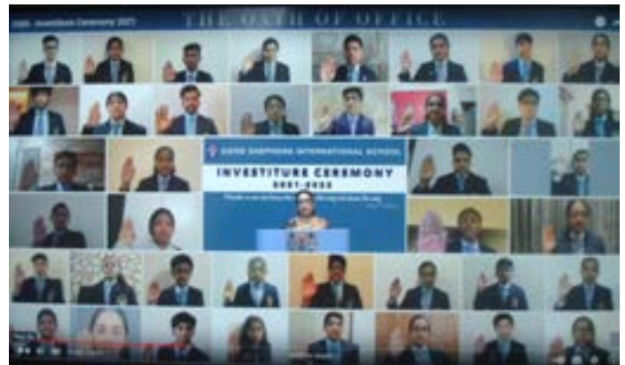
The oath-taking ceremony in progress