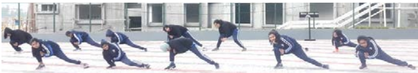
Students engaged in morning workout

Schools in Tamil Nadu have remained shut since the first national lockdown due to the COVID-19 pandemic that was announced on 24 March 2020. The number of COVID-19 cases in Tamil Nadu has significantly decreased and after a gap of nearly 10 months, school campuses in Tamil Nadu have finally thrown open their doors to a section of its senior students.