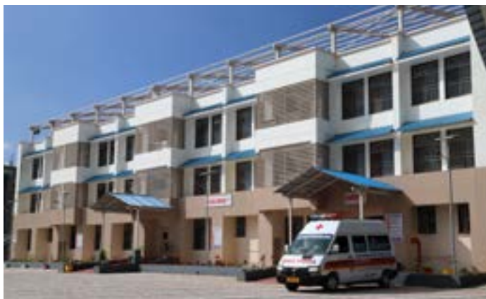
The New Infirmary block in the Palada Campus