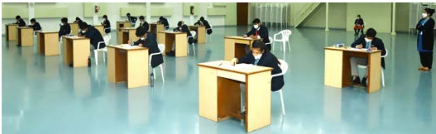
Students in the Examination Hall

The International General Certificate of Secondary Education (IGCSE – Grade 10) examinations for March 2021 session were conducted at GSIS. Fifteen students of GSIS appeared for the examinations during this session as mentioned below: