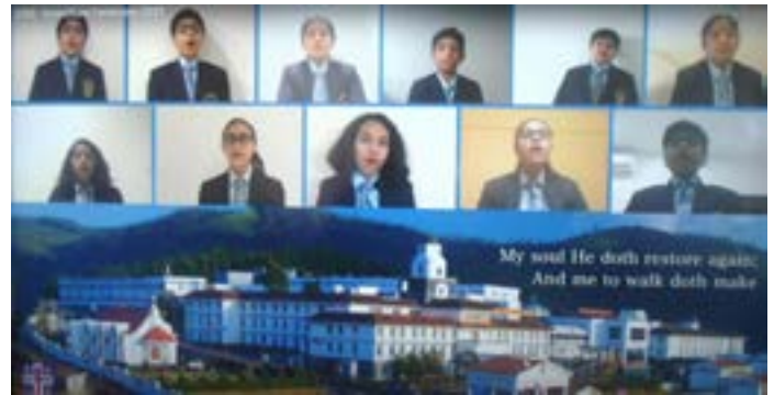
The school choir singing the school prayer song