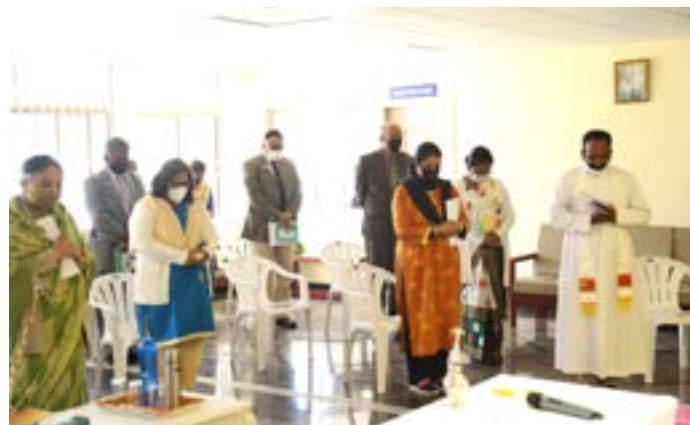
Inauguration of the New Infirmary block started with a prayer