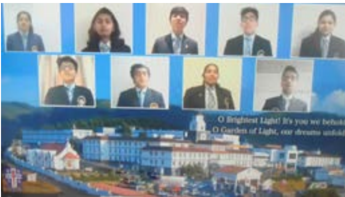
Students singing the school anthem