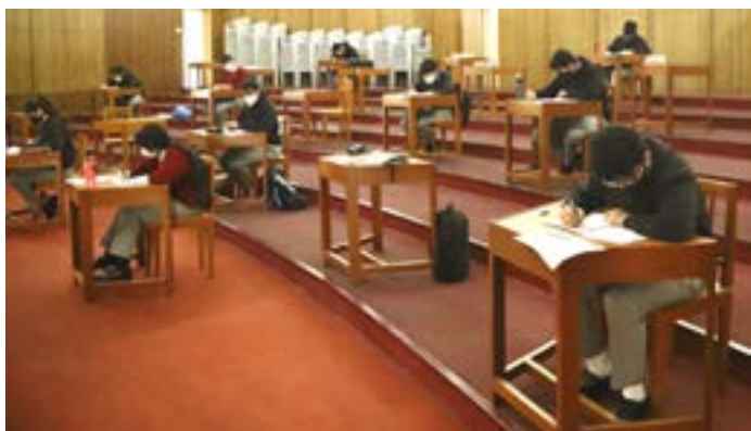
Students in the Dilkush Hall during study time