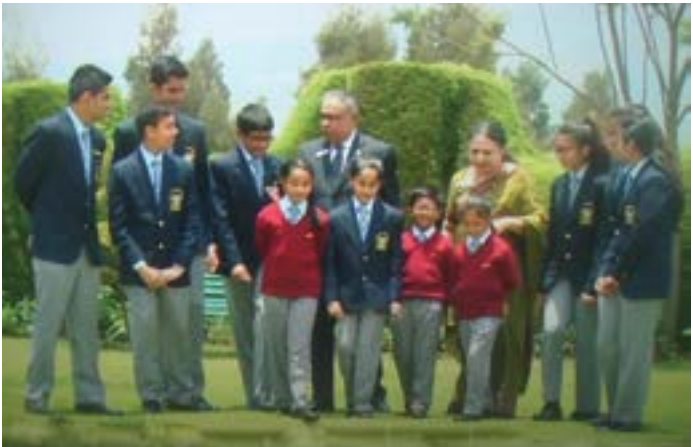
A video presentation of 'The Journey of Good Shepherd International School'