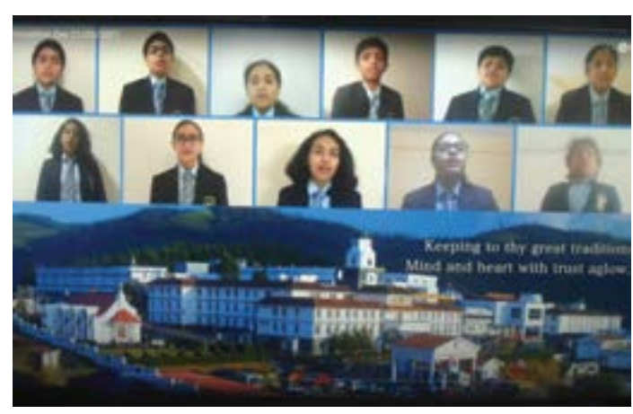
The school choir singing the School Song and the School Prayer Song