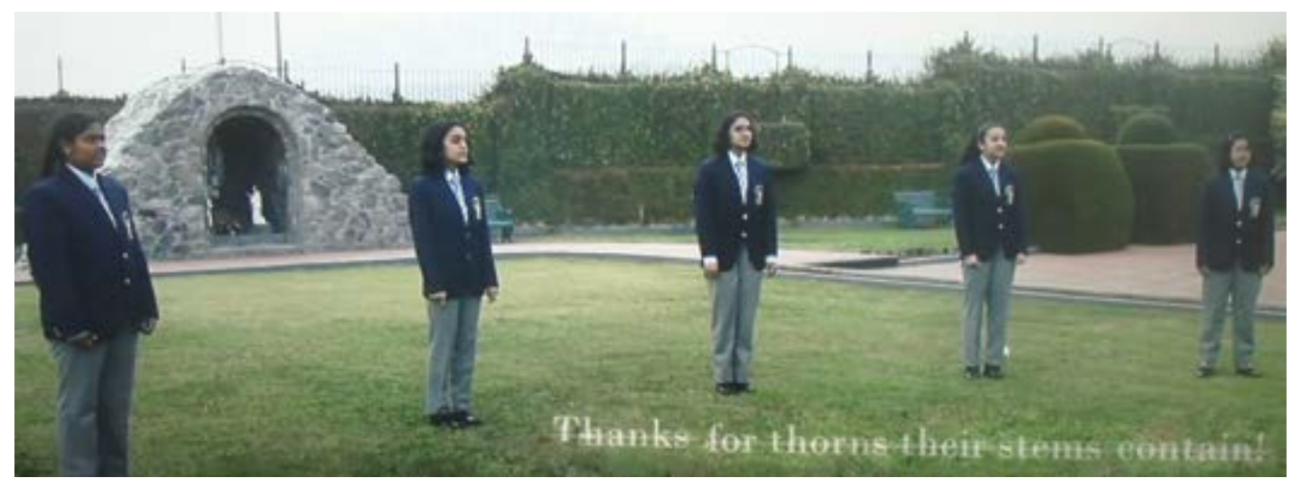
A Vocal Ensemble: Girls singing the hymn, 'Thanks to God for My Redeemer'