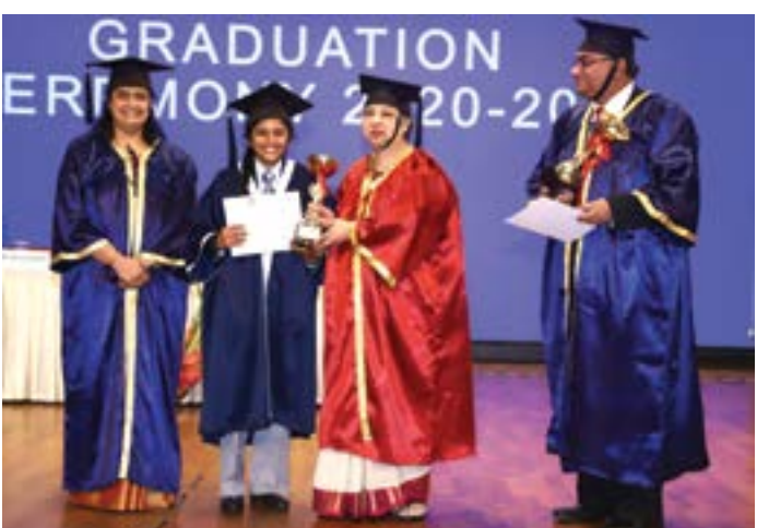
Students receiving special trophies and certificates