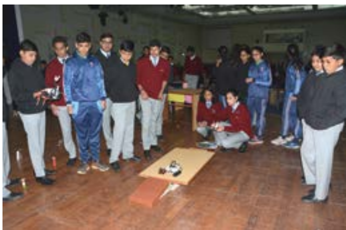
Students operating a remote-controlled robot