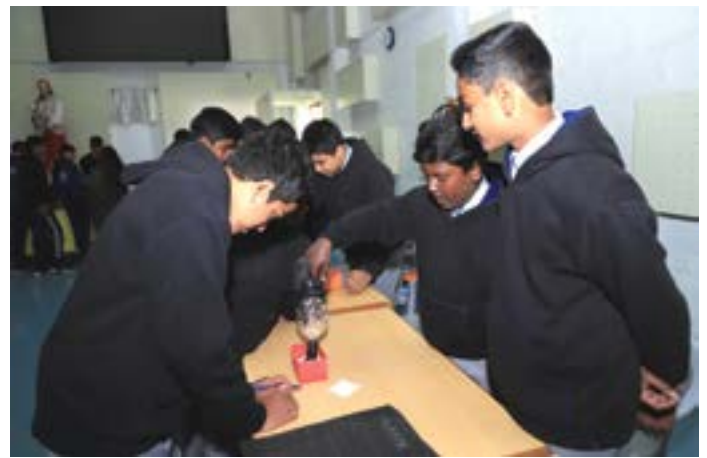
Model of a vacuum cleaner made by our students