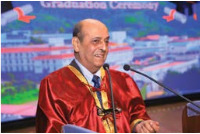
The Chief Guest addressing the students, members of staff, parents and guardians