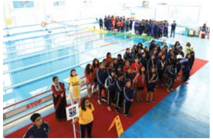
Closing ceremony in progress