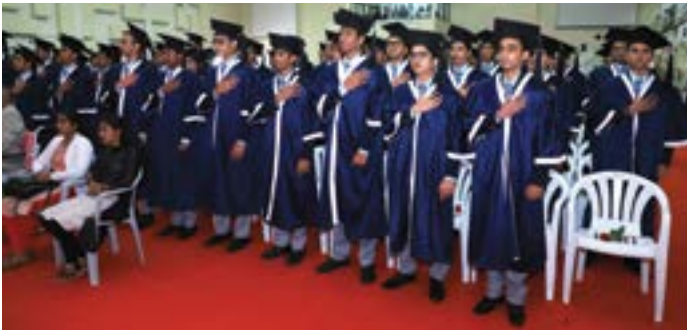
Students taking Graduation Oath