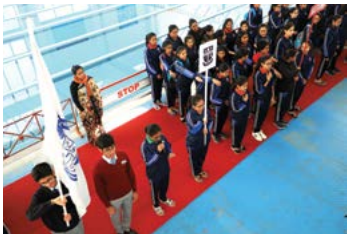
Swimmers taking oath