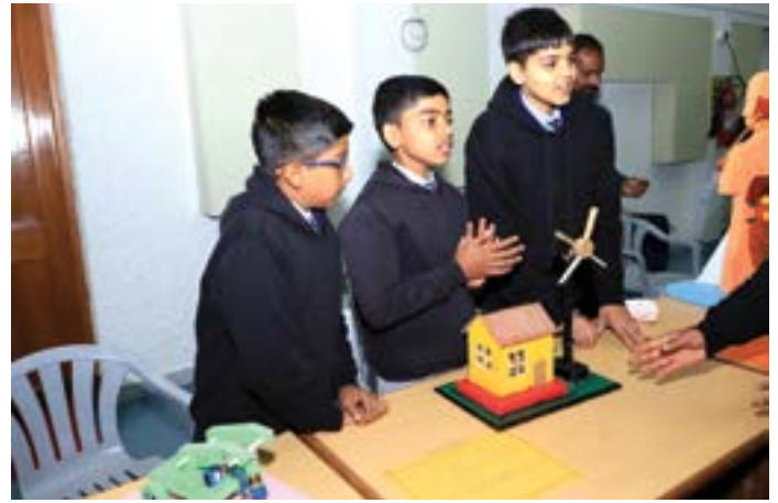
Model of a wind turbine generating electricity