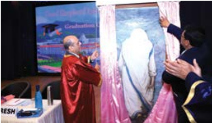
The Chief Guest unveiling the portrait of Mother Teresa