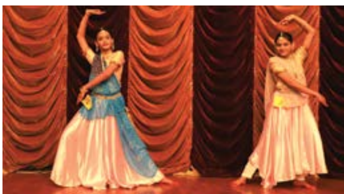
Summer House team