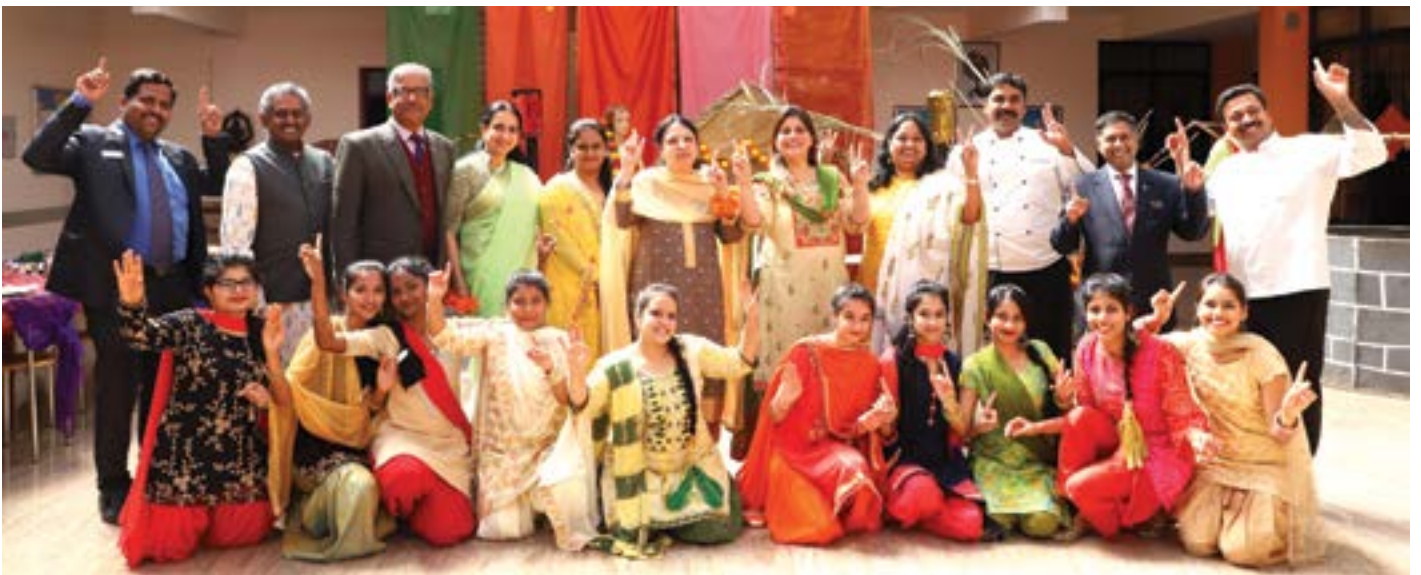
2nd Place: Team Excellence

Visitors to India greatly appreciate the mouth-watering flavour of authentic Indian cuisine. Indian cuisine consists of a wide variety of regional and traditional cuisines native to the Indian subcontinent. Several factors such as religion, in particular Christianity, Hinduism and Islam, cultural choices of people and traditions greatly influence Indian cuisines.