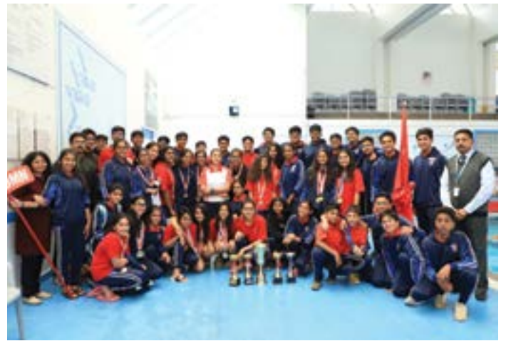
Students of Autumn House with the Swimming Trophy