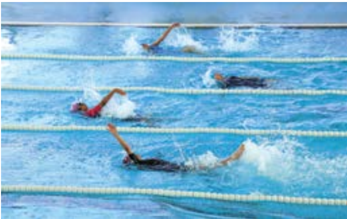
Girls' backstroke event in progress