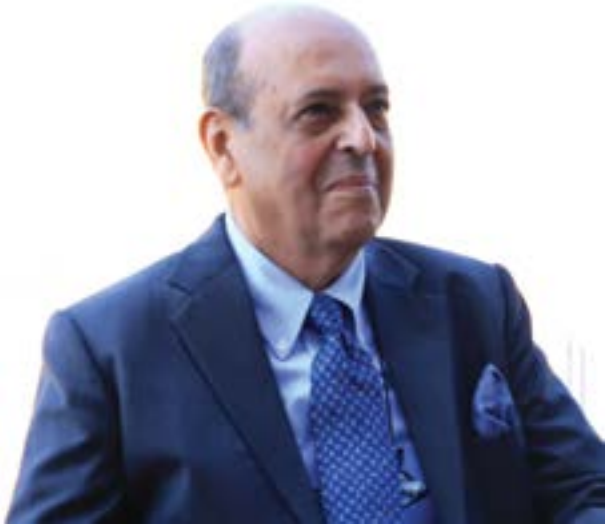
Mr Navin Chawla at GSIS