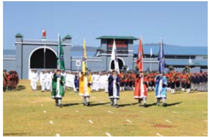
The new House Captains carry their House Flags