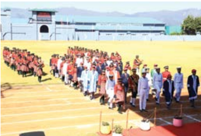
Slow March of the members of the new Prefects' Council