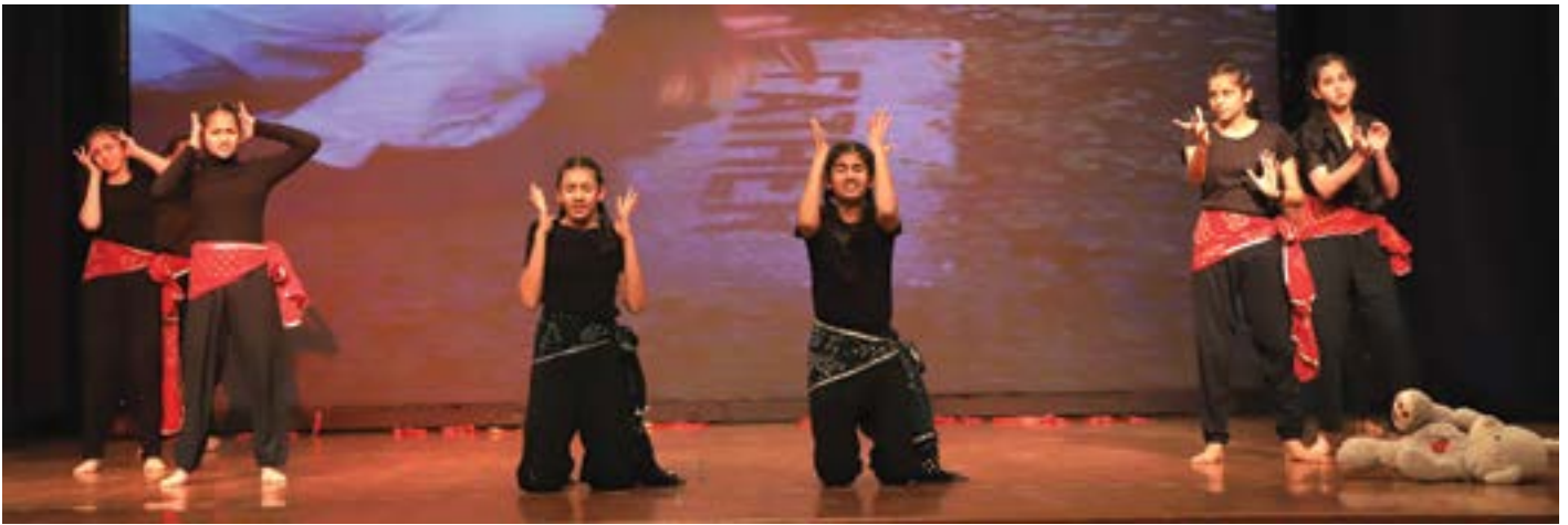
Second Prize: Winter House team