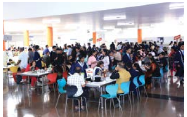
Graduation luncheon in progress