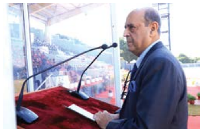
Mr Navin Chawla, IAS (Retd) speaking on the occasion