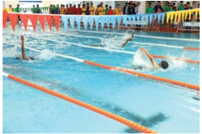
Boys' backstroke event in progress