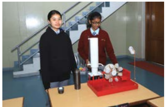
Model of a hydroelectric power generator

“Nothing in life is to be feared, it is only to be understood. Now is the time to understand more, so that we may fear less.”