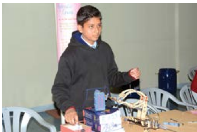
Model of a hydraulic crane

“The Science of today is the Technology of tomorrow.” Following the profound words of Edward Teller , a Hungarian-American theoretical physicist, the young intuitive minds of the students of the Middle School ventured into a technological path of Science. A science exhibition was organized in the auditorium of the Palada Campus by the students of Middle School on Tuesday, 25 February 2020.