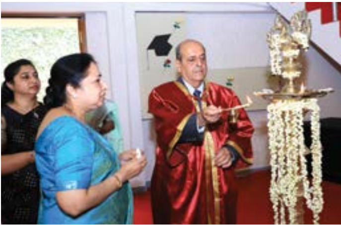
The Chief Guest lighting the Graduation Lamp