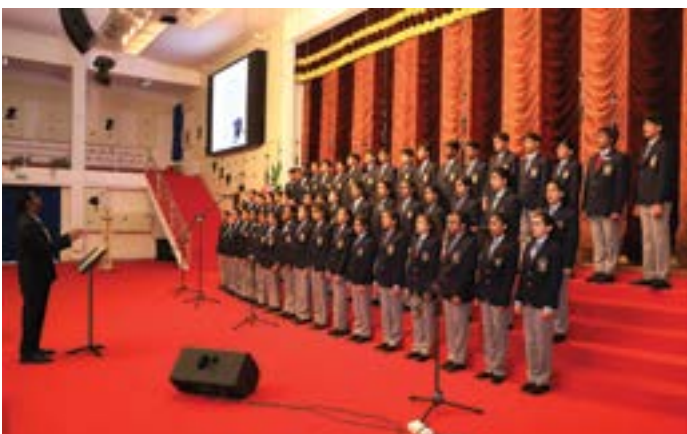
The School Choir singing the School Prayer Song