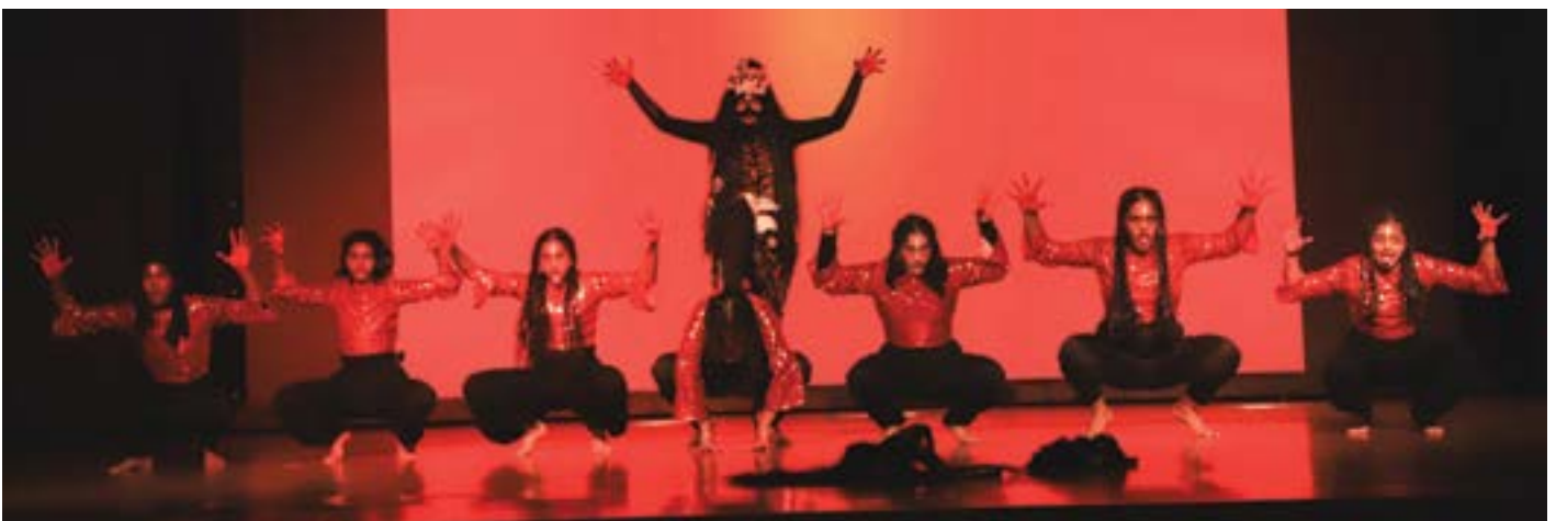
First Prize: Autumn House team