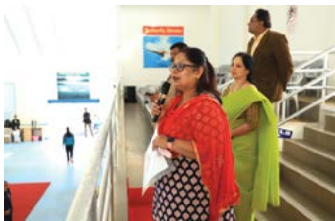
Inauguration ceremony in progress