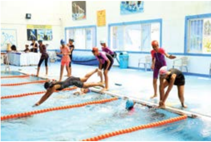
Girls' relay race in progress