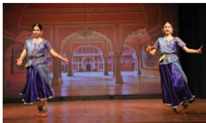
Autumn House team