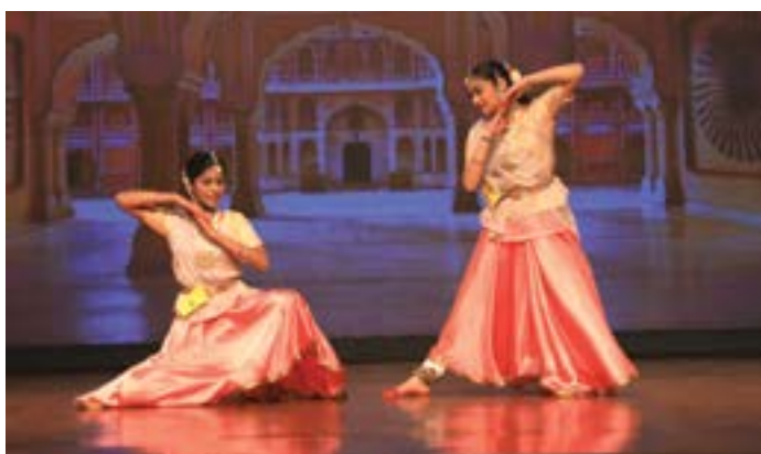
Spring House team