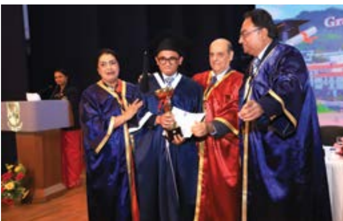
The Chief Guest presenting special trophies to outstanding students