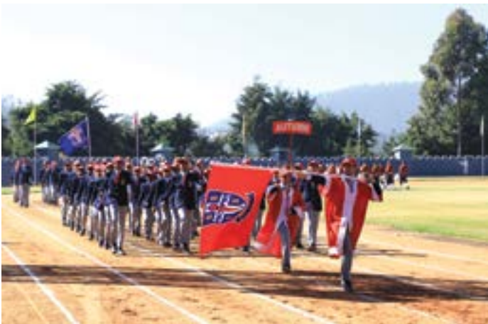
March past of the students of Autumn House