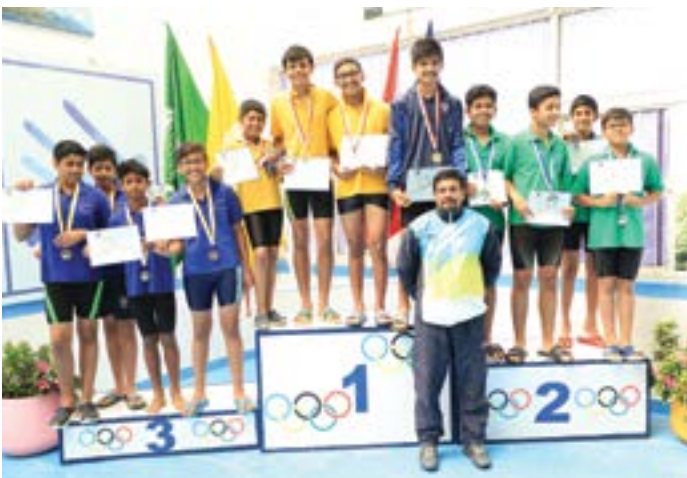
Boys: Winners on the podium