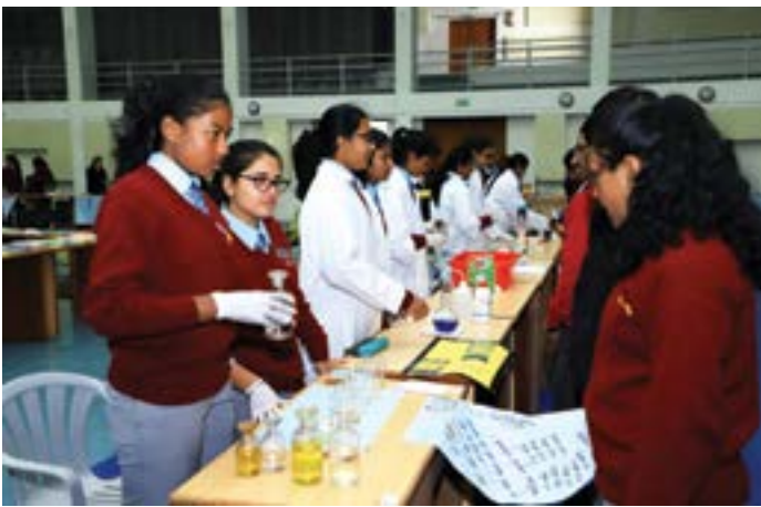
Colour juggling with chemicals