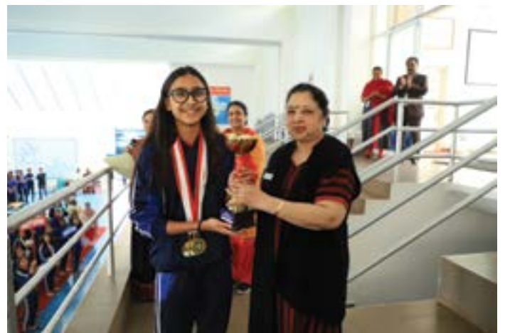
The Senior Vice President distributing the individual championship trophies

“Excellence is the gradual result of always striving to do better.”