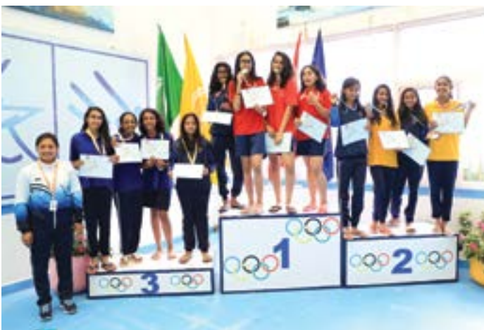
Girl students standing on the winner's podium