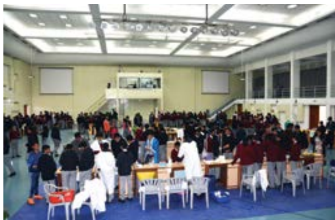
The science exhibition in progress