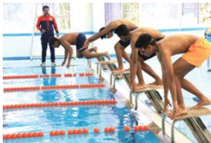
Start of boys' freestyle event

The Annual Inter-house Swimming Championship was held in the heated swimming pool of GSIS from 28 February to 29 February 2020. The swimming championship is an occasion our swimmers look forward to every year. The cold weather didn't dampen the enthusiasm of our students as they gathered at the poolside to participate in their annual swimming carnival.