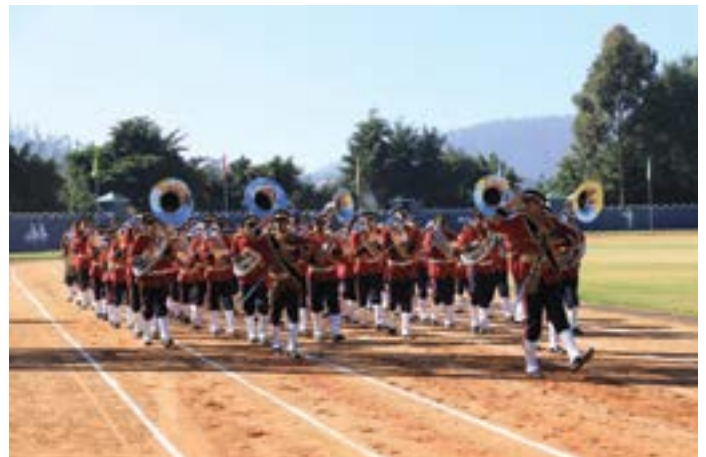
March past of the brass band

Members of the Prefects' Council assembled in the open air stadium of the Palada campus for the swearing-in ceremony. Parents, guardians, members of staff and other students were seated in the pavilion to witness the event. Mr Navin Chawla, IAS (Retd) , former Chief Election Commissioner of India, was the Chief Guest of the Investiture Ceremony . Mr Navin Chawla joined the 1969 batch of the Indian Administrative Service (IAS) and served the nation for 36 years. During his illustrious career as a civil servant, he has held important assignments in the Ministry of Information and Broadcasting, Department of Consumer Affairs and in the Ministry of Environment and Forests and rose to the level of Secretary in the Government of India.