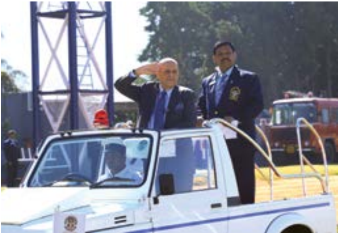
Inspection of the Guard of Honour