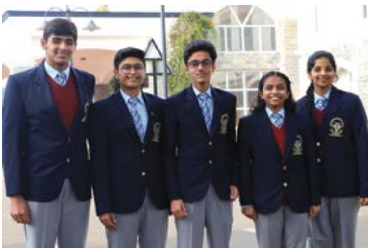
Students who took up the Jio Vichaar Entrepreneurship Challenge (JVEC)

Reliance Jio Infocomm Limited is a telecom network company in India and has its headquarters in Mumbai. JIO stands for 'Joint Implementation Opportunities'. It is the largest mobile network company in India and third largest mobile network company in the world. The Jio Vichaar Entrepreneurship Challenge (JVEC) is a secondary school entrepreneurship competition introduced by Reliance Jio Infocomm Limited and Wheaton College , Massachusetts in the United States.