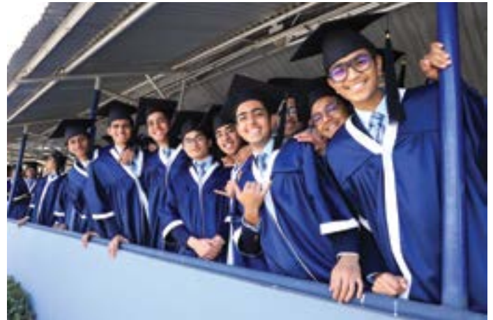
Graduands of 2018 – 2020 batch