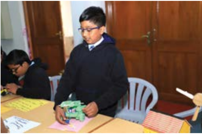
Model of an electromagnetic crane