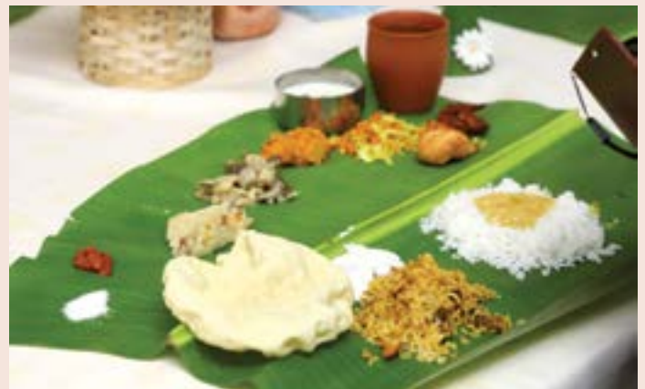
Indian cuisines cooked and presented during the competition

rule have played a role in introducing certain foods to India. Indian cuisine has also influenced other cuisines across the world, especially those from Europe, the Middle East, Southern Africa, East Africa, Southeast Asia, North America, Mauritius, Fiji and the Caribbean.