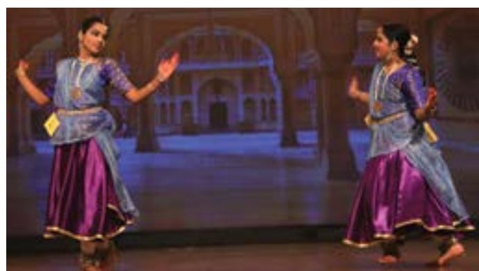
Winter House team