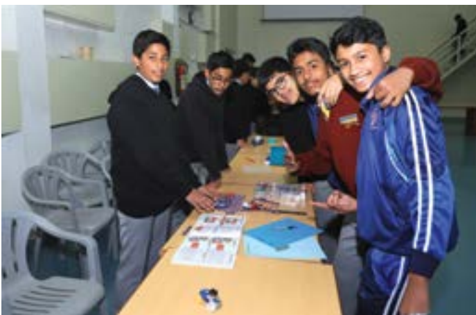
Students launching a flying saucer