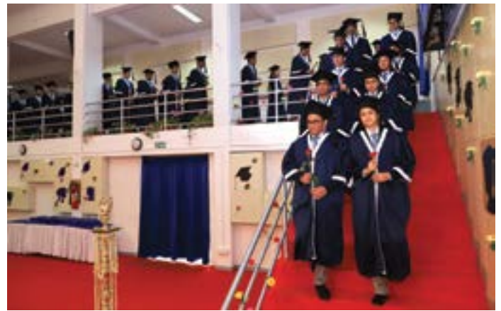
The Ceremonial March of the Grade 12 students

Graduation Ceremony of the Grade 12 students (2018 – 2020 batch) of GSIS was held in the auditorium of the Palada Campus on Saturday, 15 February 2020. 82 students of IBDP and 28 students of ISC, adorned in their graduation gowns and caps, attended the ceremony.