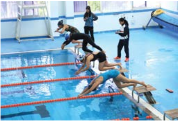
Start of the girls' freestyle event