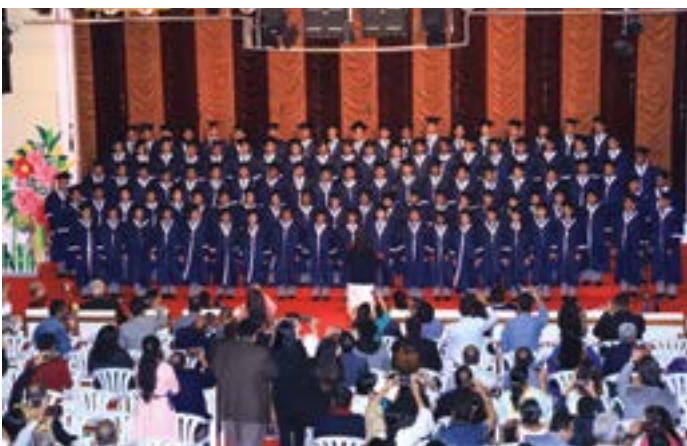
The graduating batch of Grade 12 students (2018 – 2020)