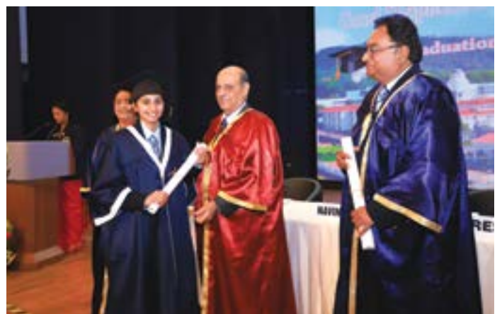
The Chief Guest presenting Graduation Certificates