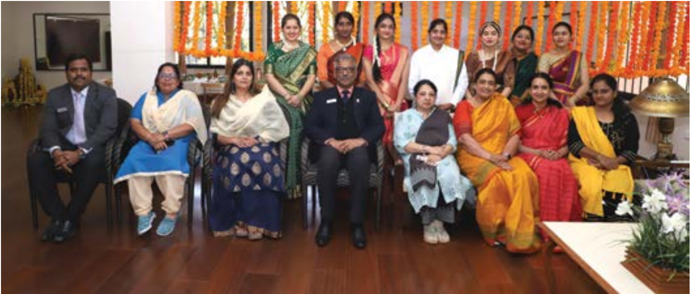
1st Place: Team Emancipation

“Indian food touches your soul before it touches your taste buds. There is heaven in every bite”.