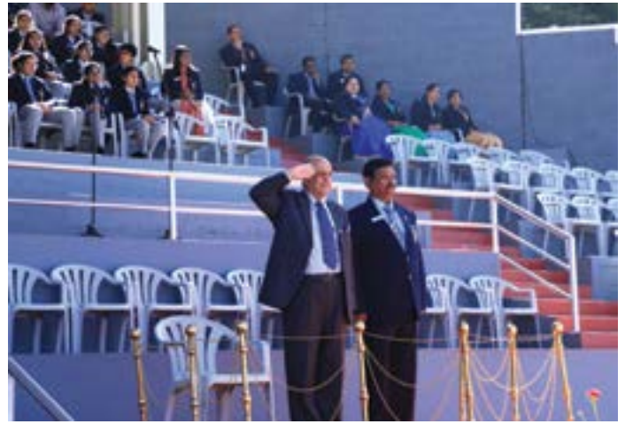
Mr Navin Chawla, IAS (Retd), took the salute at the ceremonial march past of the contingents