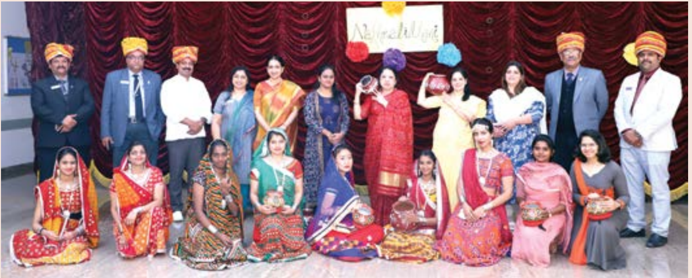
3rd Place : Team Elegance