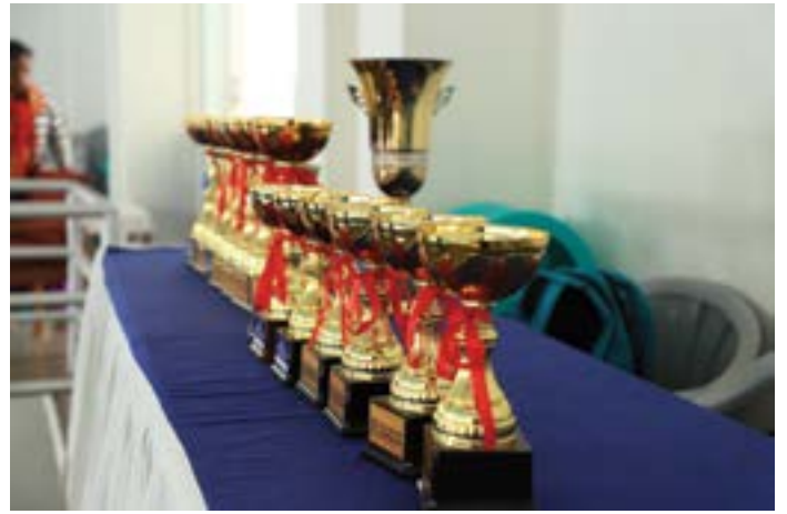
Trophies for the champions