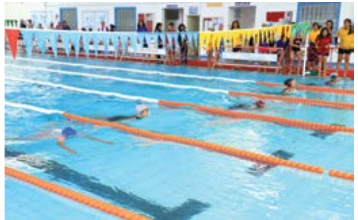
Girls' breaststroke event in progress

The following students won the championships in the different divisions: