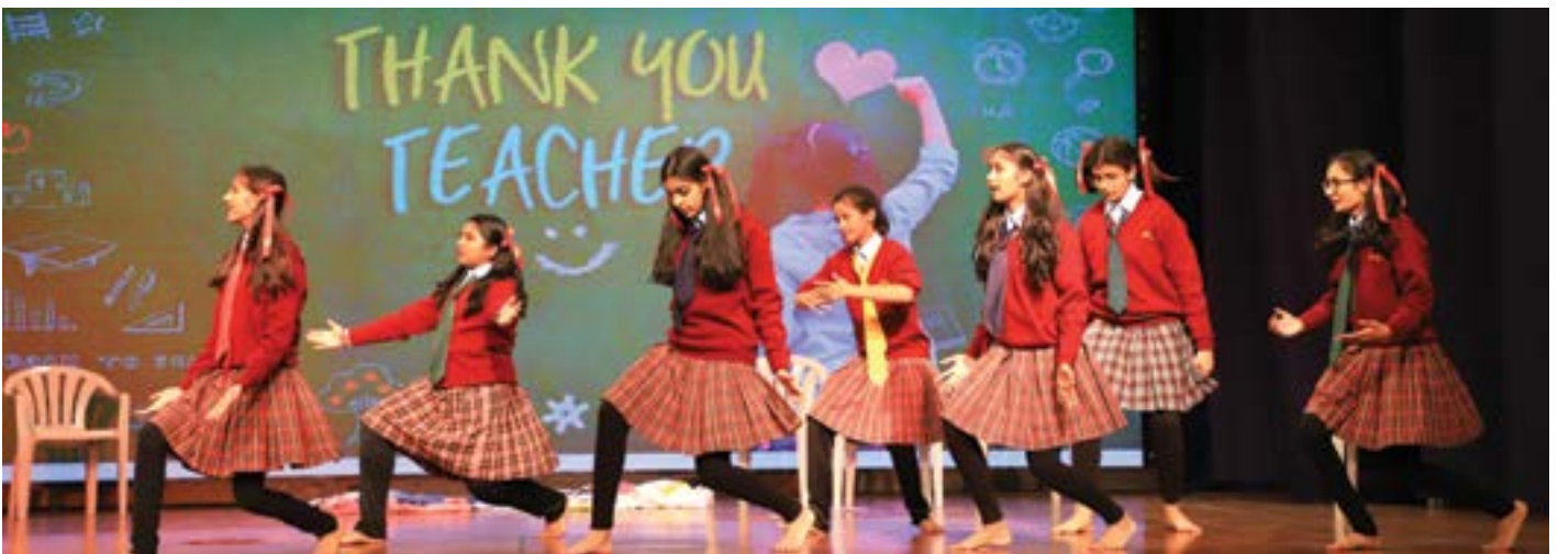
Third Prize: Summer House team

A folk dance is a dance developed by people that reflect the life of the people of a certain country or region. The Inter House Folk Dance Competition for girls of Middle School was also held in the Palada Campus auditorium of GSIS on the same evening. The result is mentioned below: