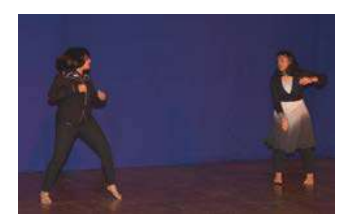
A dance performance