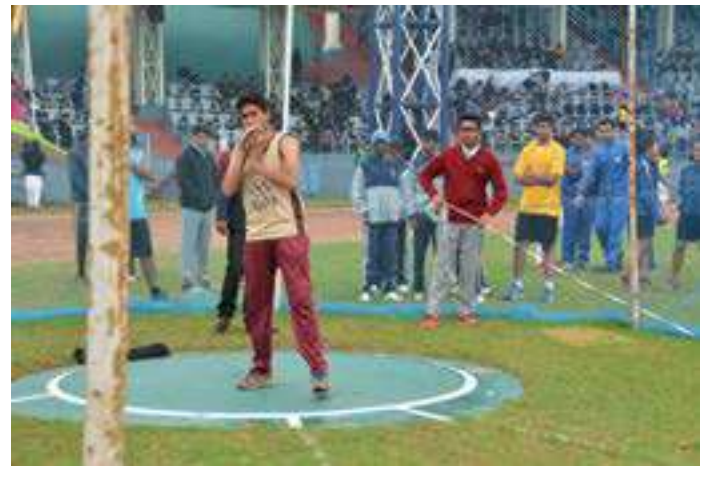
Boys' Discus throw