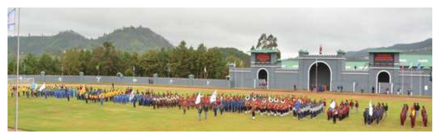
Students of participating schools assembled on the athletic field