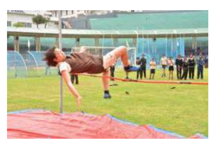
High Jump event in progress