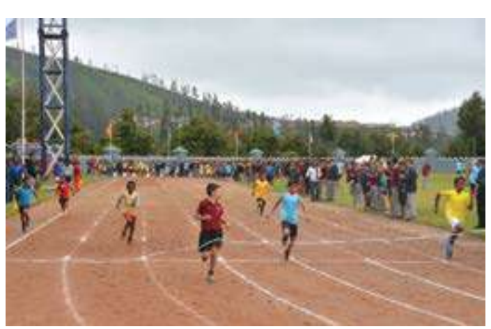
Finish of the Boys' 100-metre event