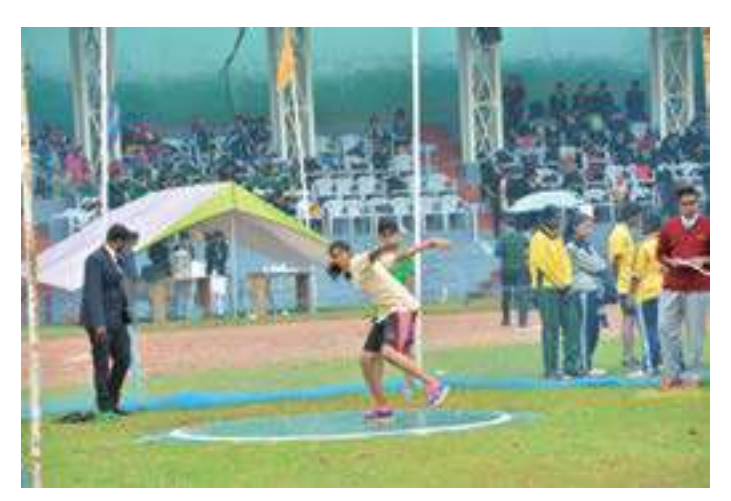
Girls' Discus throw