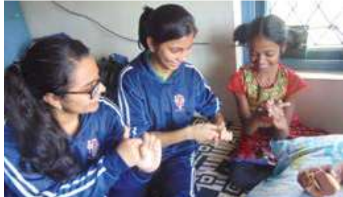
Girls of IB-2 at Smyrna Fellowship Trust

It is always said, 'We rise by lifting others.' That is what a charitable trust does! Last week, I visited a charity home called the SMYRNA FELLOWSHIP TRUST which is a public trust helping disadvantaged people lead their lives and providing them with food and shelter, and all other basic requirements. The Trust was established to guide and support social work that was rapidly growing and making a difference in the lives of hundreds of underprivileged people in the Nilgiris. Their very first task was to reach out to needy children empowering them to break the cycle of poverty. They looked after and cared for disabled children. They also helped many of them attend school who would otherwise not have been able to afford it. Their service soon expanded to reach out to the poorest of society, providing a home for young girls and looking after abandoned older people, destitute women and disabled persons in the Nilgiris.