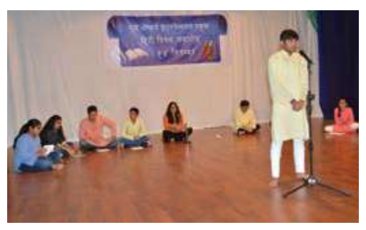
'Kavisammelan' in progress