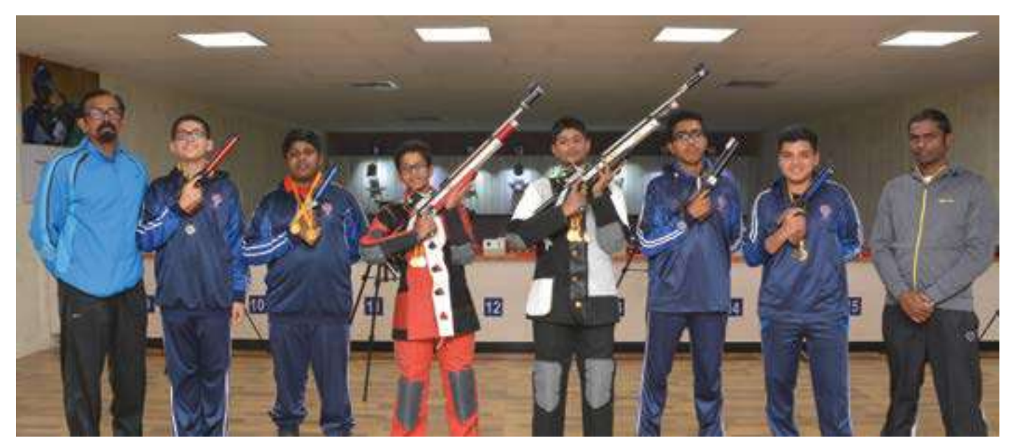
GSIS shooting team

The Tamil Nadu State Inter School Shooting Competition was held at Mission Academy of Shooting Sports, Chennai, under the aegis of Tamil Nadu State Shooting Association from 11 August to 15 August 2017. Ten students of GSIS participated in the event.