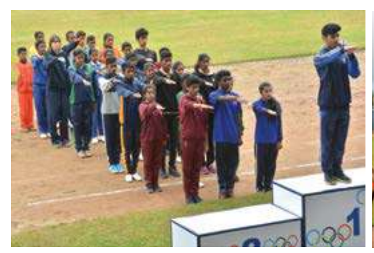
Athletes taking the Oath