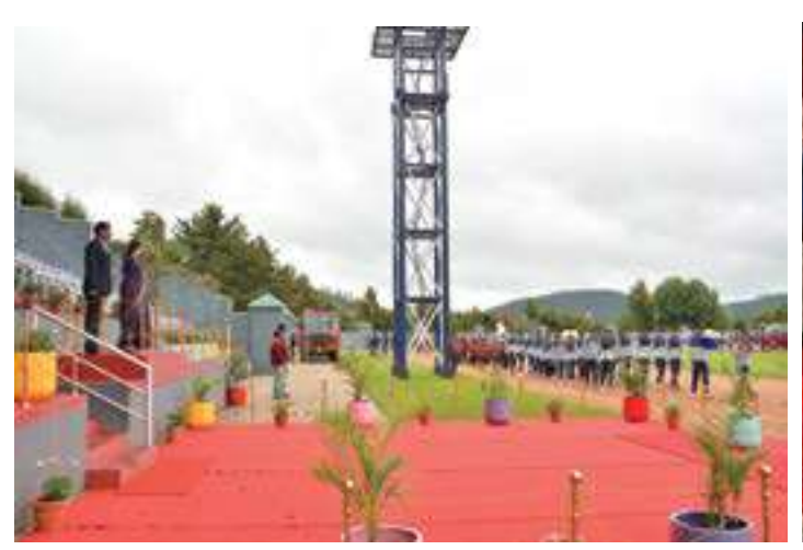
March Past of the athletes