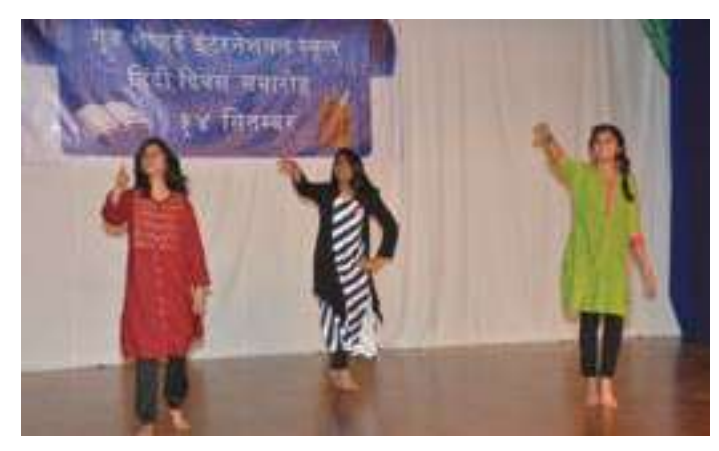
Girls dancing to the tune of Hindi music