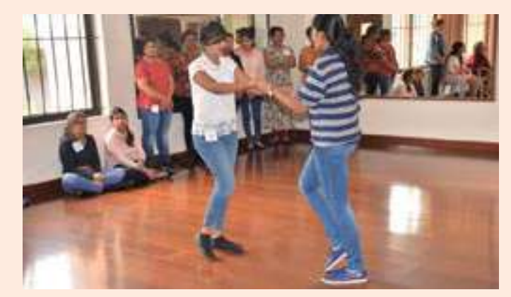
The 3 months' batch of girls learning to dance