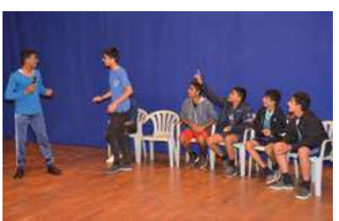
Senior boys presenting skits