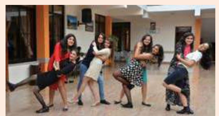
The 9 months' batch of girls learning the basic dance steps

traditionally refers to the five International Standard and five International Latin style dances. The two styles, while differing in technique, rhythm and costumes, demonstrate core elements of ballroom dancing such as control and cohesiveness.