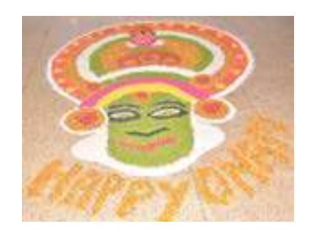
Flower carpets put together by staff

Students and staff celebrated Onam at GSIS on Monday, 04 September 2017. Onam is an important annual festival for Malayalees in Kerala and they celebrate this harvest festival with much fanfare across the world. According to popular legend, Onam is celebrated to welcome and honour Mahabali, a popular king who is said to have once ruled Kerala. It is said that on Thiruvonam , the spirit of the King Mahabali visits his people and the festival is a preparation to welcome him and show him that his people are prosperous and happy.