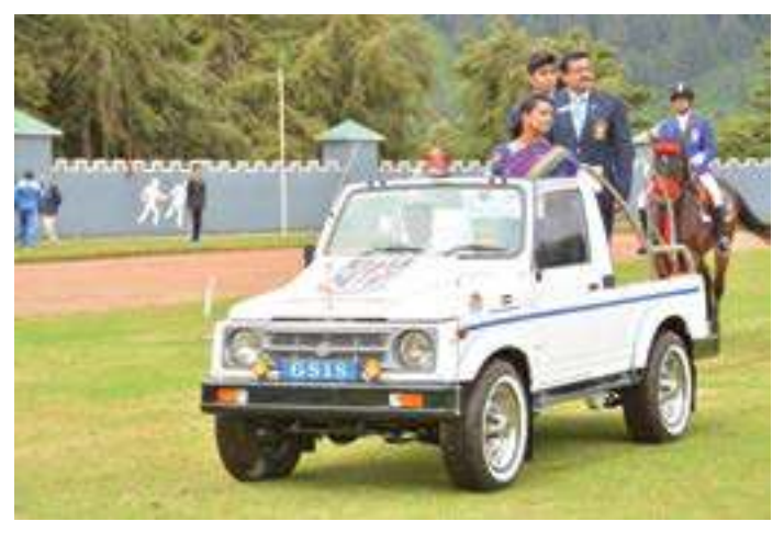
Inspection of the Guard of Honour