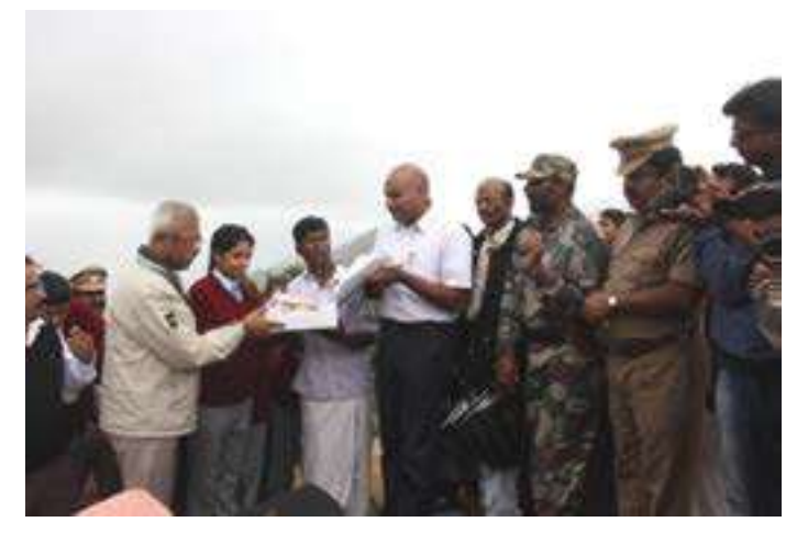
Distributing food to the people in the village

On the 6th of August 2017, a few of us from Grades 10, 11 and 12 visited Kinnakorai in the Nilgiris. We started off from school at 9.00 in the morning after having a sumptuous breakfast, not yet mindful of the value of the food. We had fun in the bus as we danced and played games. It took us two hours to reach our destination. Kinnakorai has several hattis. As soon as we alighted from the bus it started drizzling and so we could not spend much time in the open. We visited many hattis .