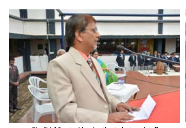
The Chief Guest addressing the students and staff