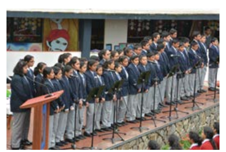
The Indian music choir singing vande mataram