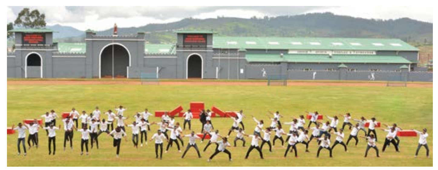
Senior boys dancing