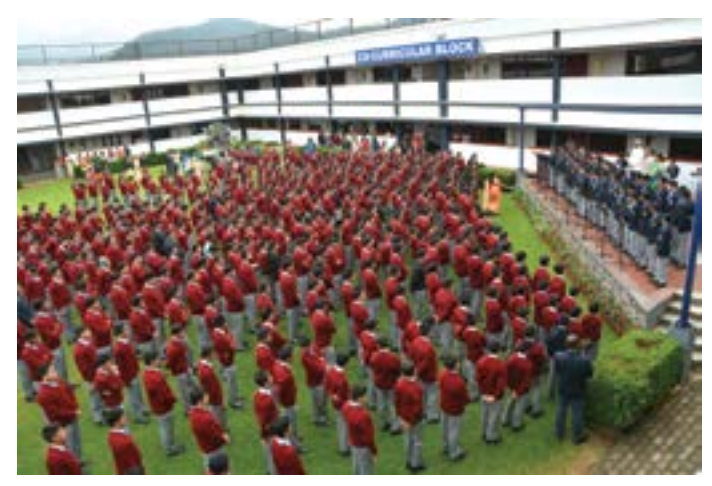
The assembly in progress