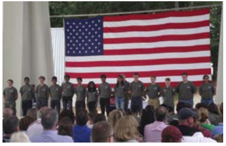
Students at the space camp