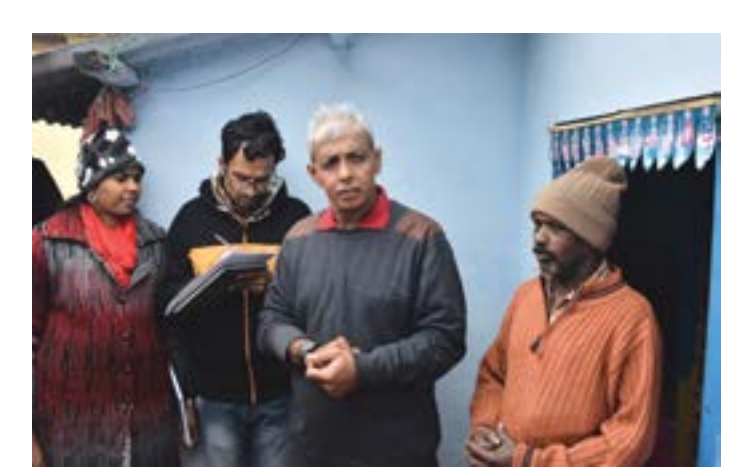
A trip to a nearby village

The participants also gained a great deal of inputs from each other as the members of each group kept changing: while once a group comprised teachers from the same IB subject group, for another activity there were heterogeneous groups. The highlight of the workshop was a trip to a nearby village with a focus on exploring the concepts that each group chose. The various presentations that followed took the leaders by surprise as all the groups had chosen different topics and a great deal of study had been undertaken by all the members. Many assumptions were proved false and the entire exercise was an eye-opener for all.