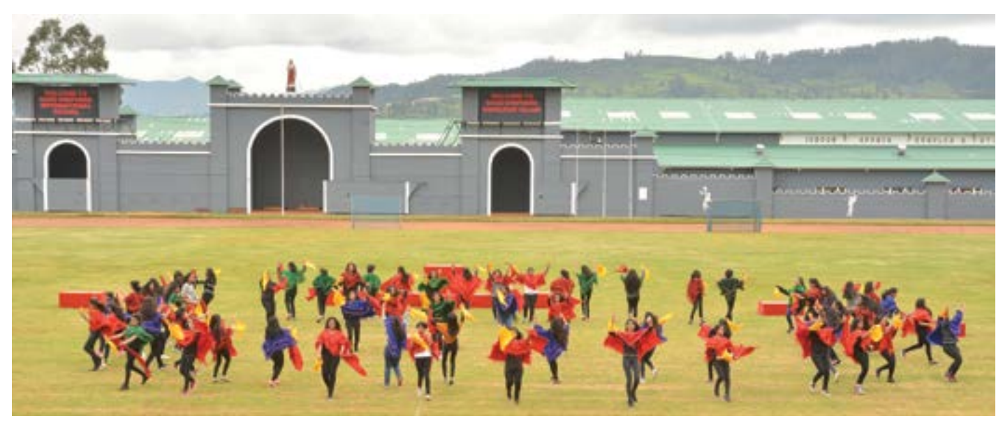
Senior girls dancing