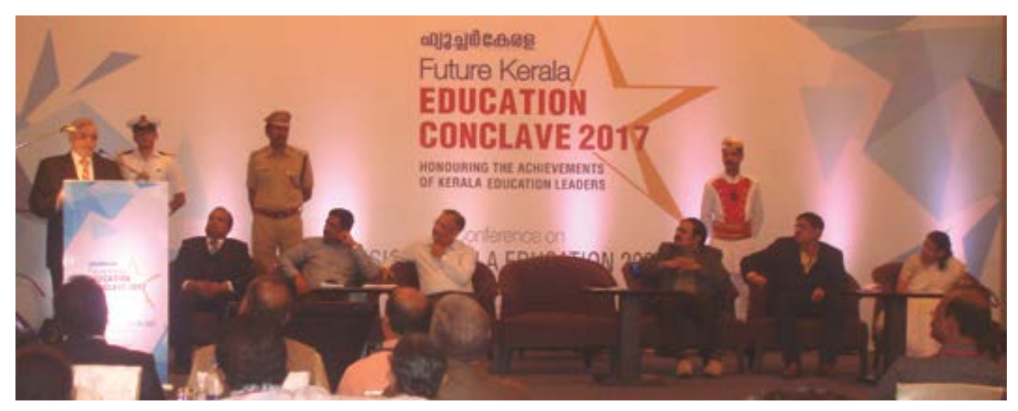
The Honourable Governor of Kerala, Shri Justice (Retd) P Sathasivam, delivering his address

education environment is constantly changing, and using the present technology we can revamp our education sector. We have to promote, help and fulfil a commitment to build world-class educational institutions across the state, keeping up with the international standards."