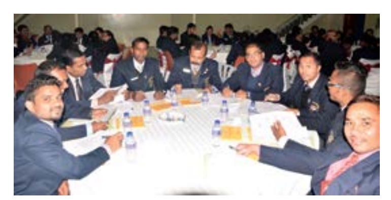
Members of staff attending a workshop

Good Shepherd International School organized a two-day orientation programme in its Palada Campus on 18th and 19th of July 2017 for the benefit of the new and existing academic and co-curricular teachers working in both the campuses. This programme was organized before the start of the new academic session to enhance innovative teaching techniques, share and gain knowledge and make the teaching and learning process more relevant and related to day-to-day situations.