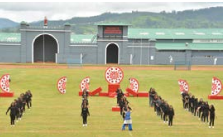
Senior girls dancing to the tune of the music

In the cultural programme that followed in the stadium, our junior and senior students choreographed and showcased a number of Indian folk dances accompanied by Bollywood background music. They displayed spirited movements in their colourful costumes infusing a pleasant charm to the afternoon. They enthralled the gathering for more than an hour with their colourful and lively dances much to the delight of the audience.