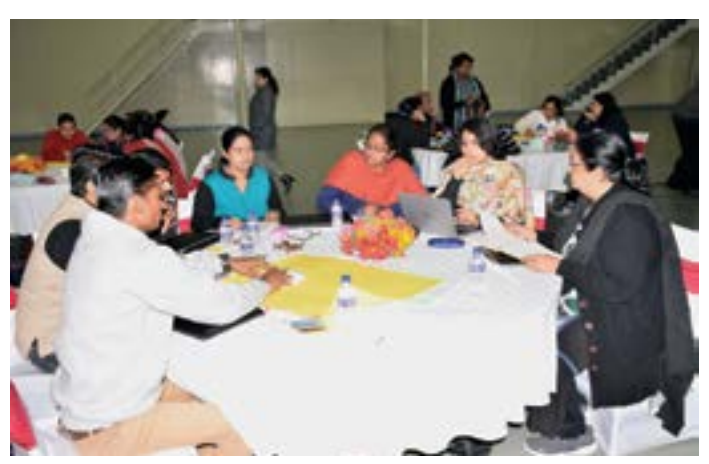
The workshop in progress