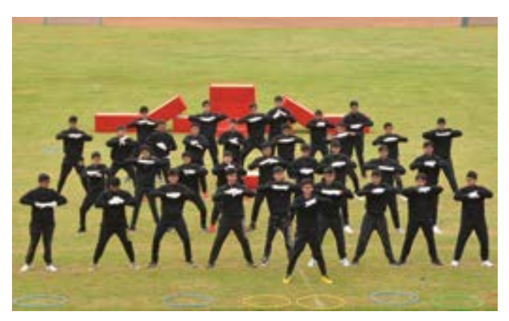
Senior students dancing