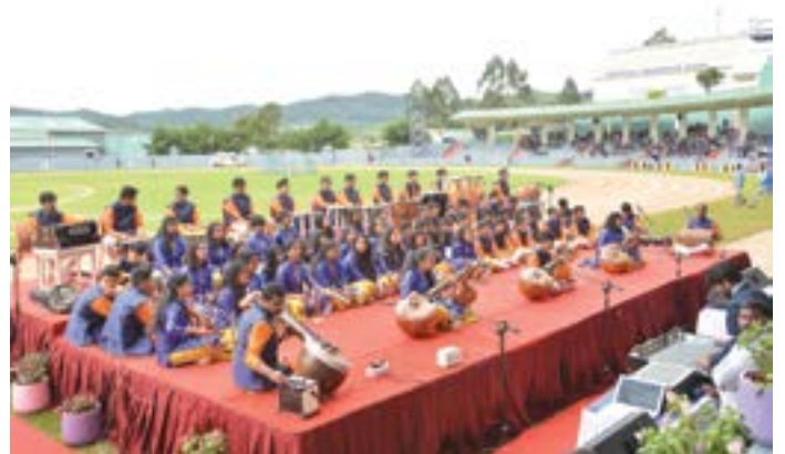
Indian music ensemble