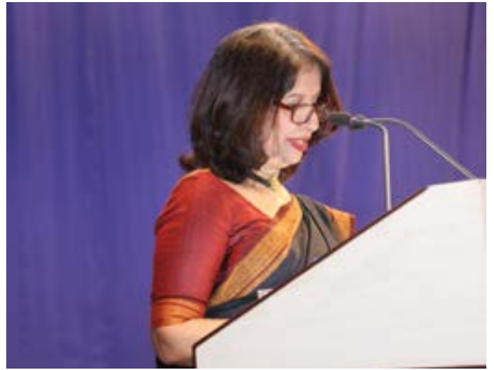
Address by the chief guest, Smt. Nirupama Rao