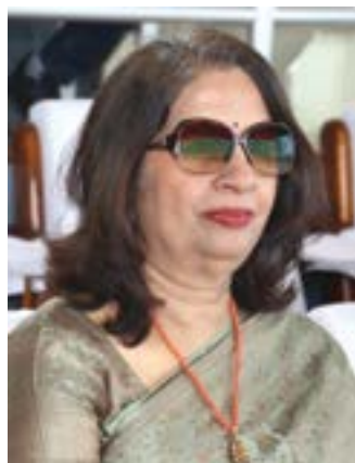
Smt. Nirupama Rao