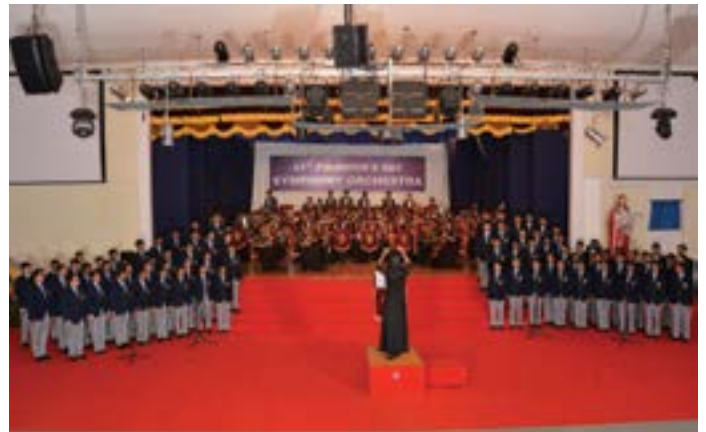
Music rendition by the Symphony Orchestra

But the event which mesmerised all was the grandeur of the jungle kingdom presented in a musical presentation, The Lion King , which is a story of Simba's journey to fulfil his destiny. It would be unfair not to give due importance to the well-synchronized Light and Dark presentation by the Fernhill students. As the night darkened, our little Shepherdians brought light through their message of the necessity to protect the environment. The musical ensembles, with their fine blend of notes and tunes soothed the charged air of excitement.