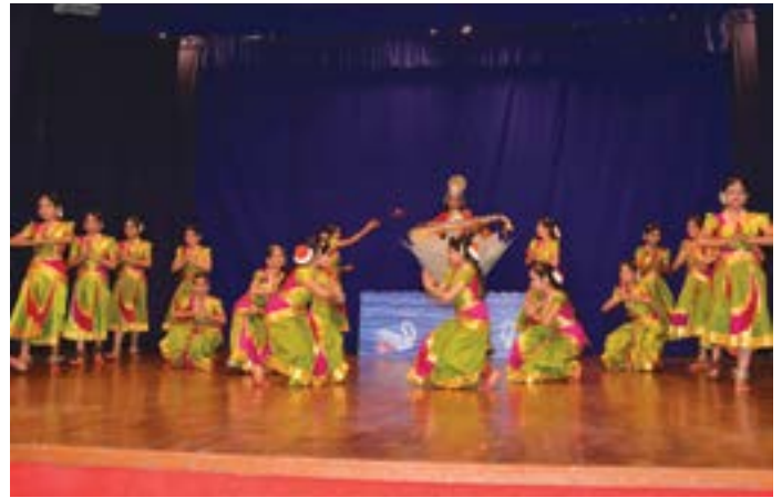
Pooja dance: Saraswathi Vandanam