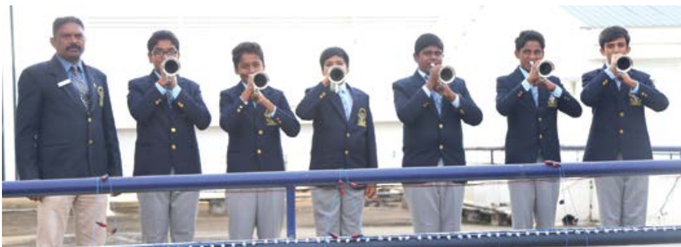
Bugle call announcing the arrival of the chief guest