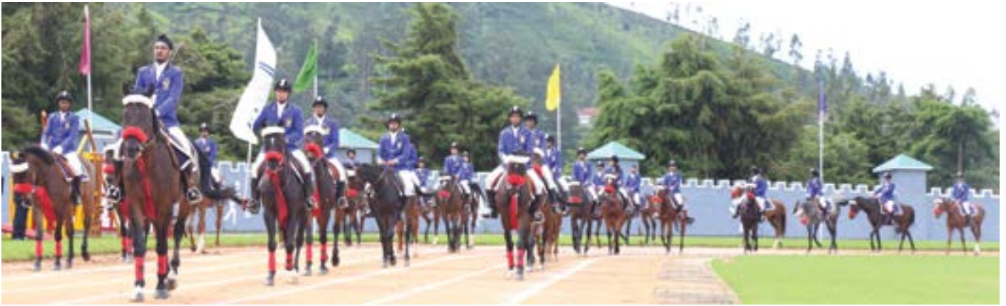
The Horse Contingent