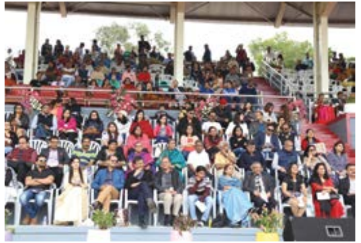
View of spectators in the stadium