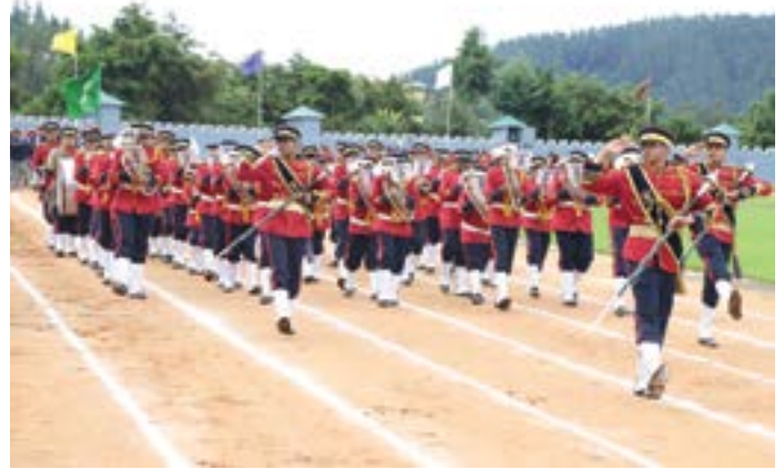
March past of the Brass Band