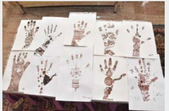
Creative and innovative mehendi designs

The Mehendi Design and Nail Art Competitions for the 3 months' batch of girls were held at Good Shepherd Finishing School on 17 August 2017. The results of the competition are mentioned below: