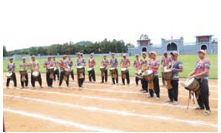
Percussion Ensemble: Boys playing African djembe drums