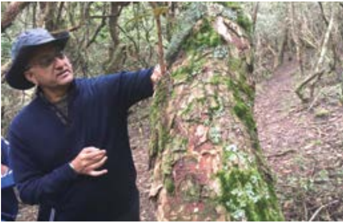
Checking for the presence of lichens on the trunk of a tree