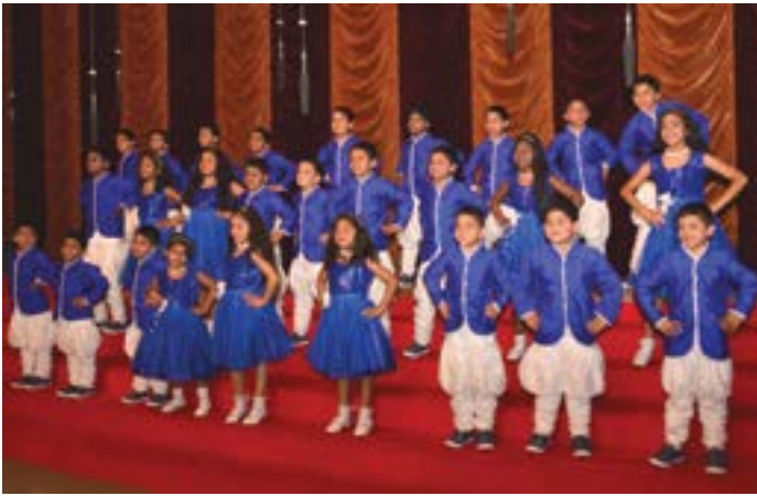
Junior School presentation