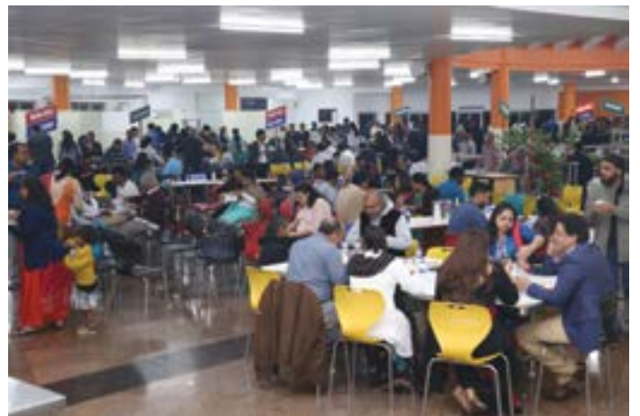
Parents and guardians in the dining hall