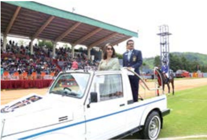
Inspection of the Guard of Honour