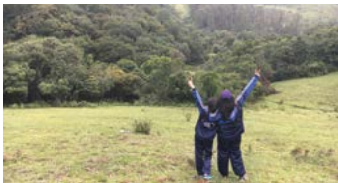
Enjoying the pristine beauty of the Shola rainforest

We have spent more time indoors in front of screens. We have become less aware of the plants, insects, worms and birds in our backyard and neighbourhood. Students' alienation from nature is a concern and it is harmful to their spirit and health. They are no longer able to identify common plants and animals in their backyard. Ecological issues cannot be taught without a student being passionate enough to embrace the environment and having a passionate guide who can make the discipline come alive.