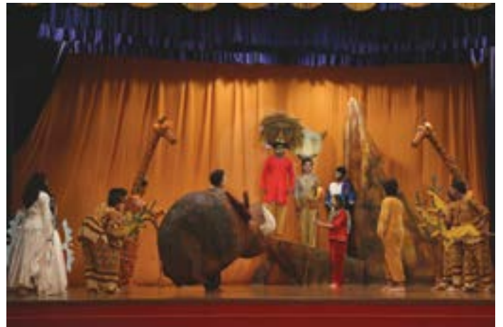
Students performing a stage show: musical presentation – Lion King