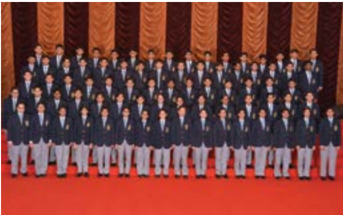
The school choir singing the school prayer song