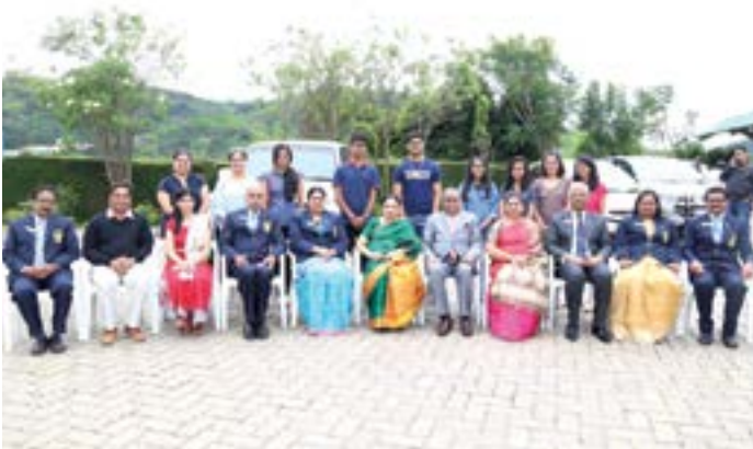
The Old Shepherds along with the Principal