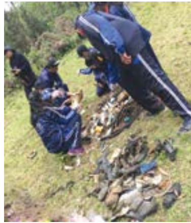
Collection and disposal of trash, refuse & garbage waste in the shola forest