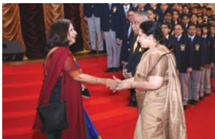
A warm welcome to the chief guest!