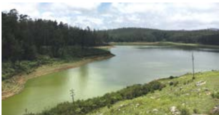
The Kamraj Sagar Lake, Ooty