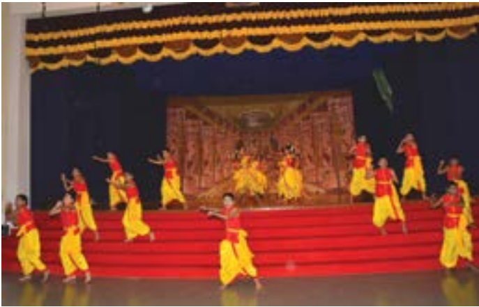
Junior students performing a Marathi folk dance