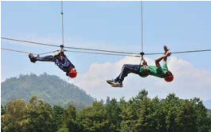
Display of mountaineering skills