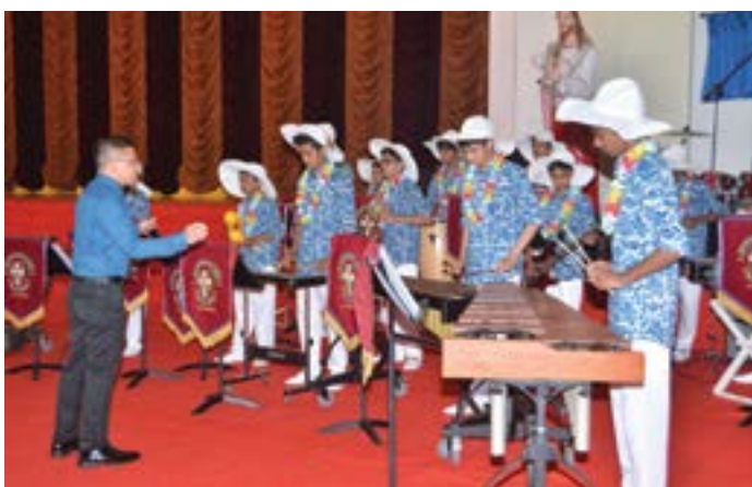
A musical presentation