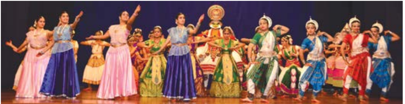
Ashtalakshmi dance: Dances of India