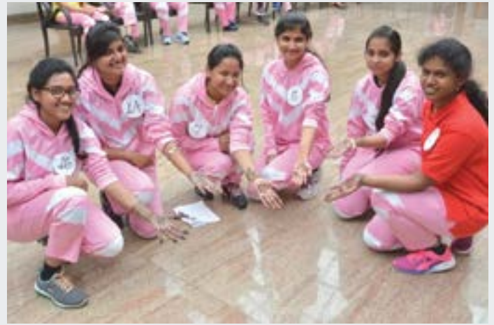
Mehendi design competition in progress