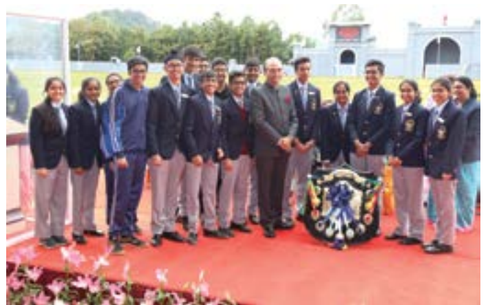
Winter House: Winner of the Cock House Shield