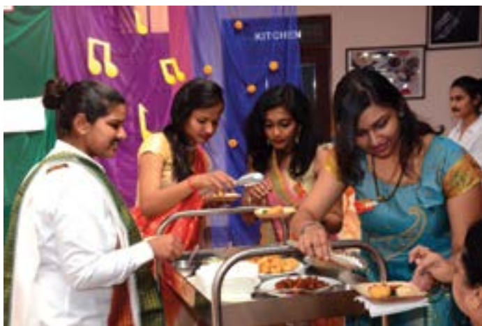
Members of the team, Elegance, serving food to the guests