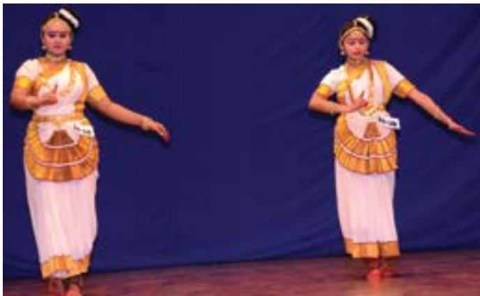
Summer House team