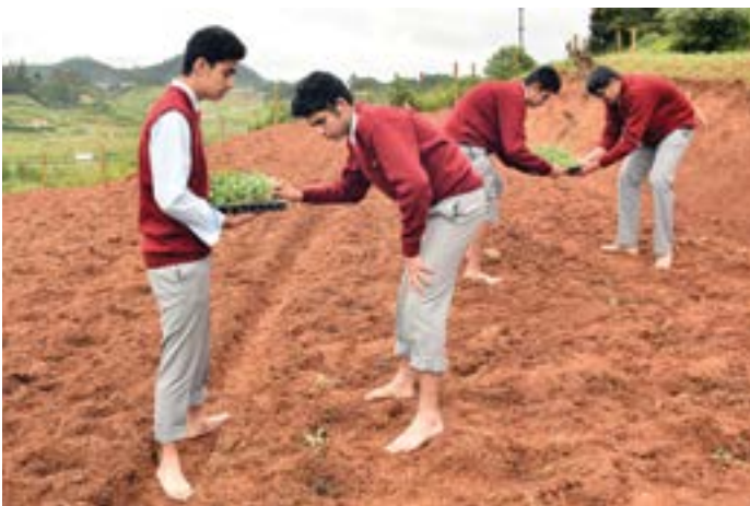
Students planting saplings