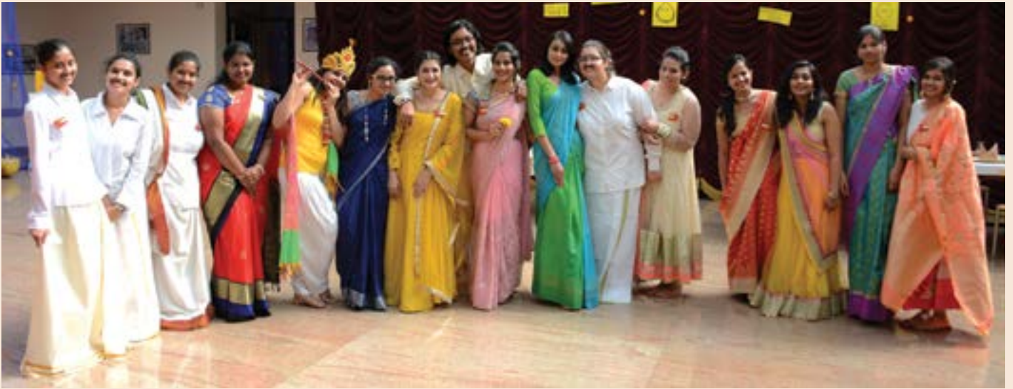
Winners : Team Elegance