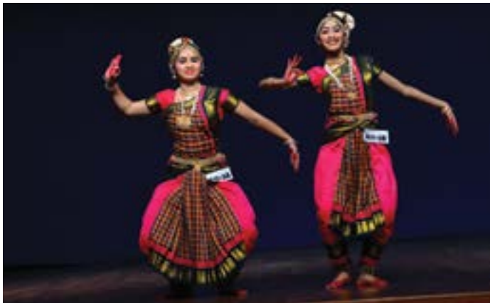
Spring House team