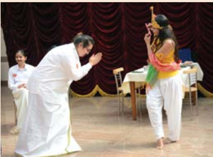
Girls enact a skit