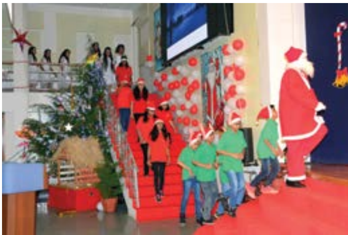
A nativity scene enacted by students