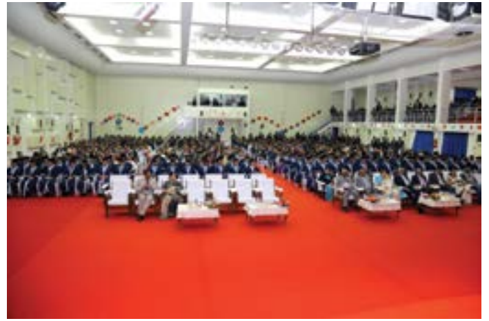
Dignitaries, parents, guardians, teachers and students in the auditorium