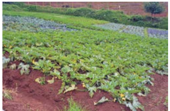
Vegetables grown at the Palada Campus

Education is the key to tackling youth unemployment and poverty worldwide. The organization, TEACH A MAN TO FISH UK LIMITED , is an international education charity, committed to tackling global poverty. The organization works with schools to set up school businesses. The School Enterprise Challenge , run by TEACH A MAN TO FISH UK LIMITED , is a global business start-up Awards Programme for schools around the world with up to $50,000 in prizes available for the most entrepreneurial schools, teachers and students. The organization supports schools across Africa, Asia & Latin America to set up enterprises as a hands-on way to teach practical & business skills and to generate extra income in the process. This free Awards Programme guides and supports teachers and students to plan and set up real, sustainable school businesses. Students get the chance to gain hands-on experience of running a real business and generate