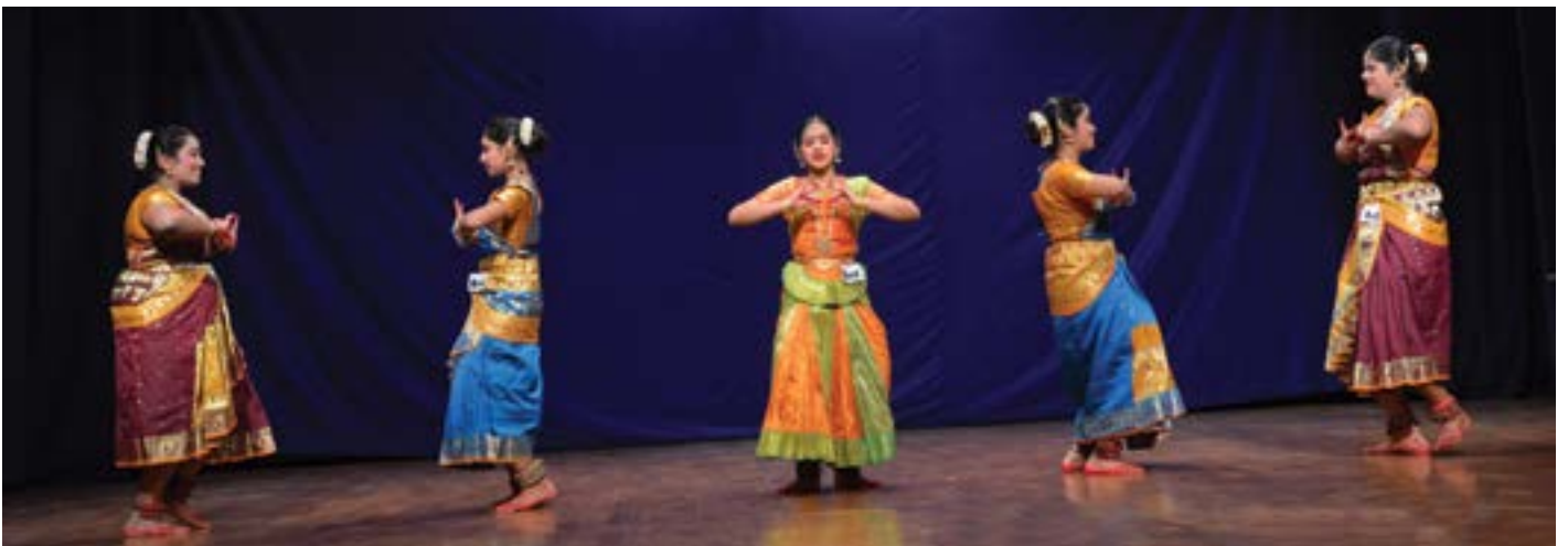
Winter House Team

Overall Winner in Classical Dance Competition : Summer House