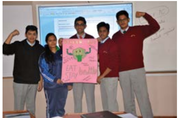
Students presenting a business plan

real profits to help support their school or a social cause of their choice. Schools have set up an amazing variety of businesses.