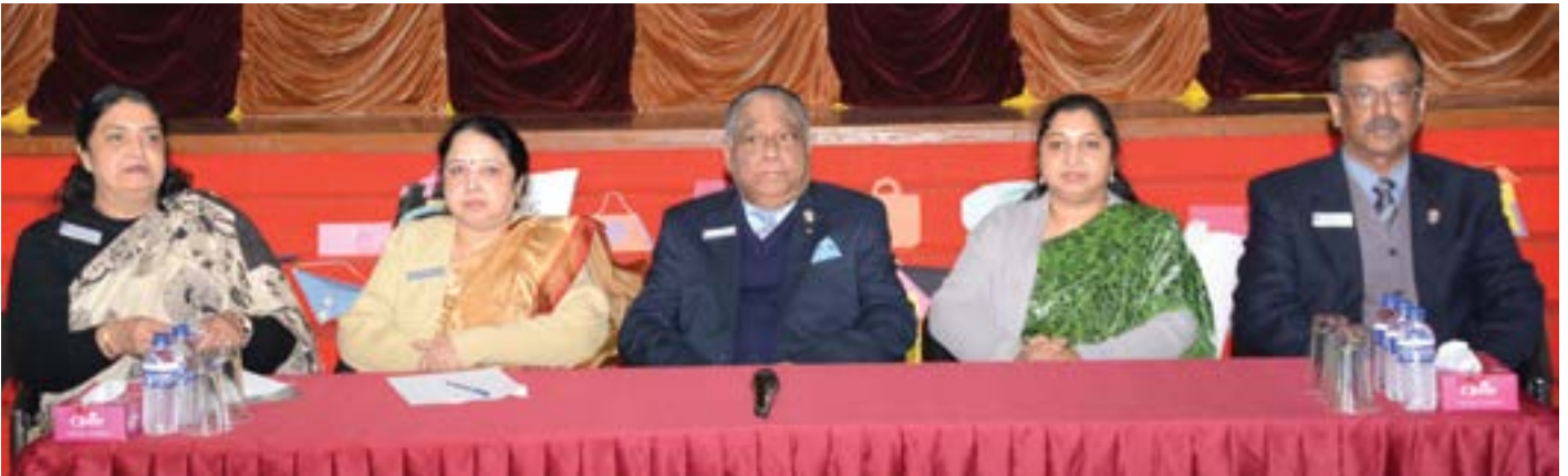
The Open Forum in progress: Addressing concerns and requests