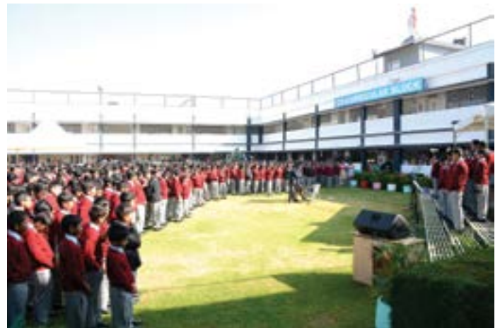
Students and faculty assembled on the co-curricular block quadrangle during the special assembly