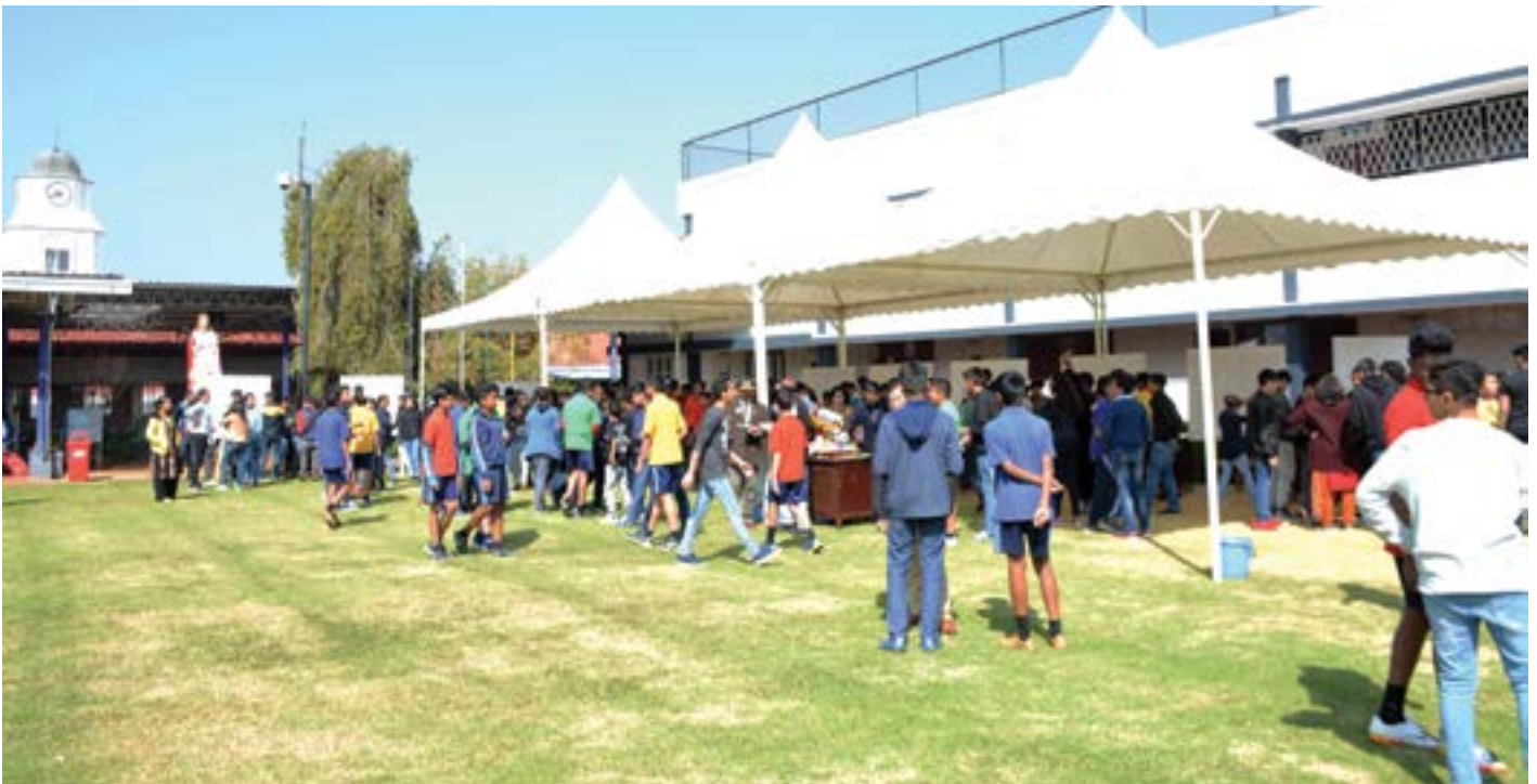
Students enjoying their activities on the Republic Day

flag. Concluding on an inspirational note, she shared with the audience her experience of participating in Republic Day parade in New Delhi and the rigorous training the cadets had to undergo before the event.