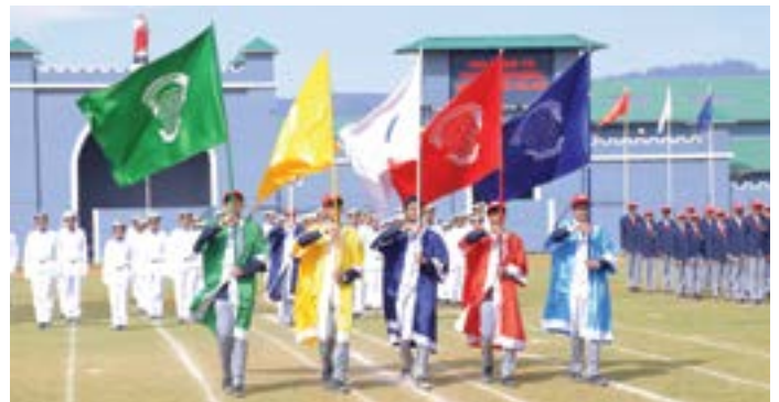
The Head Boy and the Boys' House Captains carrying their flags during the swearing-in ceremony

by the Prefects' Council unequivocally conveyed the confidence, the determination and the fearlessness imbued in the incoming Prefects.