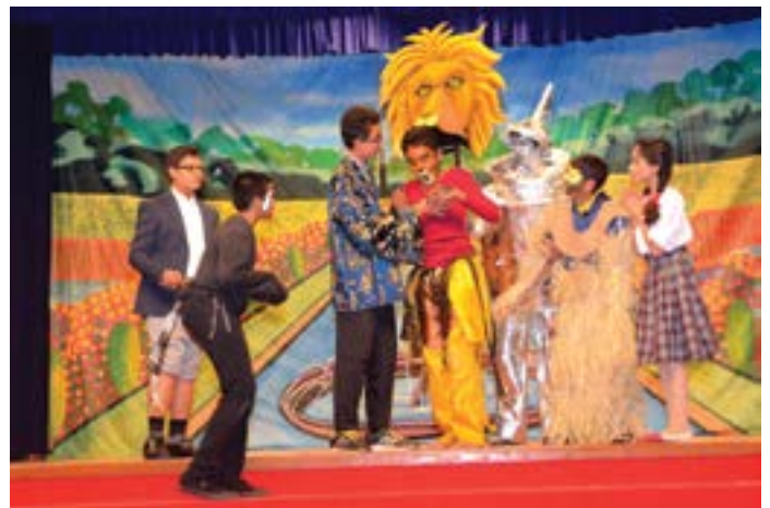
A scene from the play, 'The Wonderful Wizard of Oz'

The Inter House Dramatics Competition for students of Middle School was held on Monday, 20 November 2017. The results are as mentioned below: