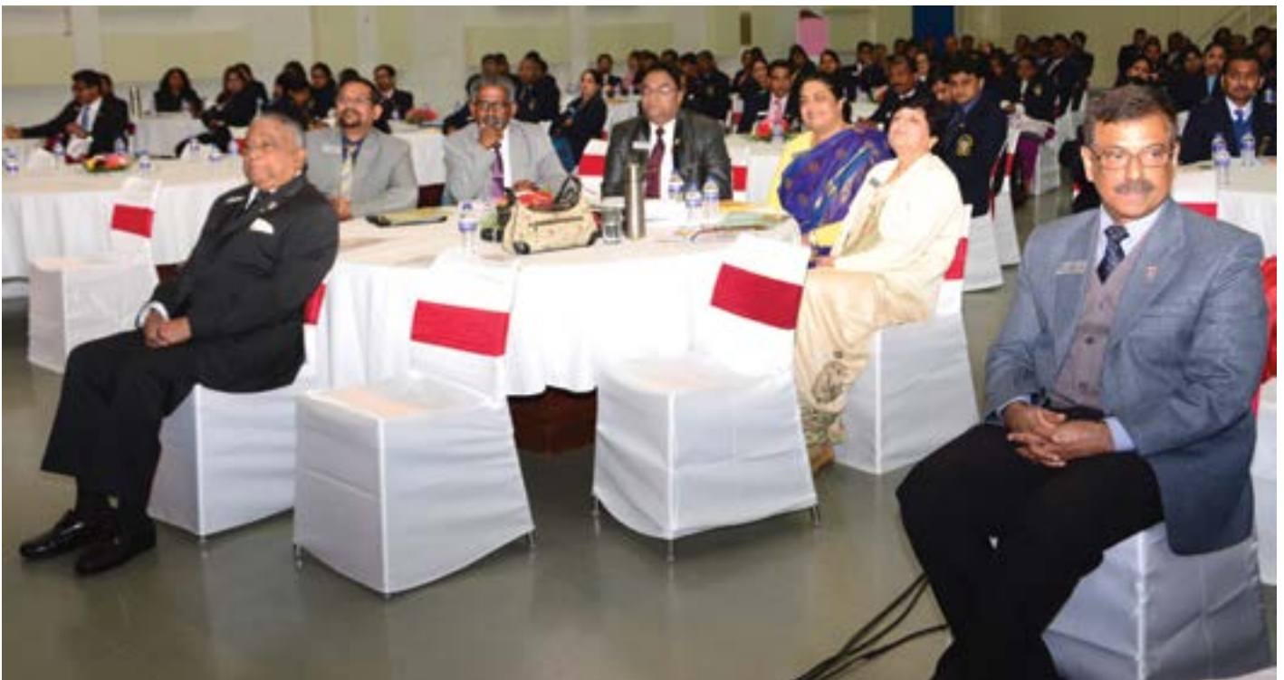
The Orientation Programme in progress

This year, the staff of Good Shepherd International School returned from a hearty vacation to an invigorating, two-day long Orientation Programme . The sessions on the two days, 17 and 18 January 2018, spanned from 9 am to 4 pm with tea and lunch breaks.