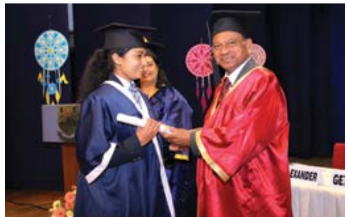
Distribution of graduation certificates

a visually aesthetic crescendo when the graduating students clasped candles in blue votive candle holders and oscillated them to and fro ever so gently as they belted out the hymn 'Pass it On' in a darkened auditorium. There were gasps of amazement from the audience and on this poignant note, the students walked down the aisle and hugged their eager parents!