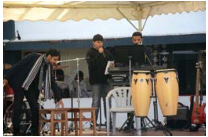
Performance of young singers and budding musicians