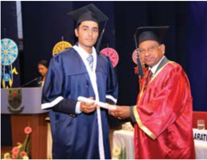
Distribution of graduation certificates