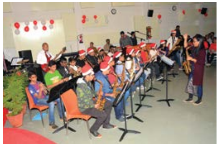
Choir singing Christmas carols

The students and staff of Good Shepherd International School commenced this year's festive celebrations in a wonderful display of music and theatre, accompanied by seasonal speeches.