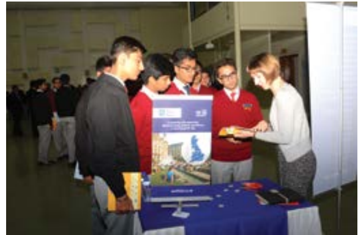
Students speaking to the delegates

Students have to decide their career paths after plus two, the final stage of their school life. It is very important for students of grades 11 & 12 to choose a career so that they can set professional goals, follow a career path and develop a strategy for getting where they want to be. Students have to choose a career based on an honest self-evaluation of their talents, abilities and interests. Many of them might have already chosen their subjects depending on their interest of career choice.