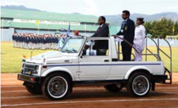
Inspection of the Guard of Honour