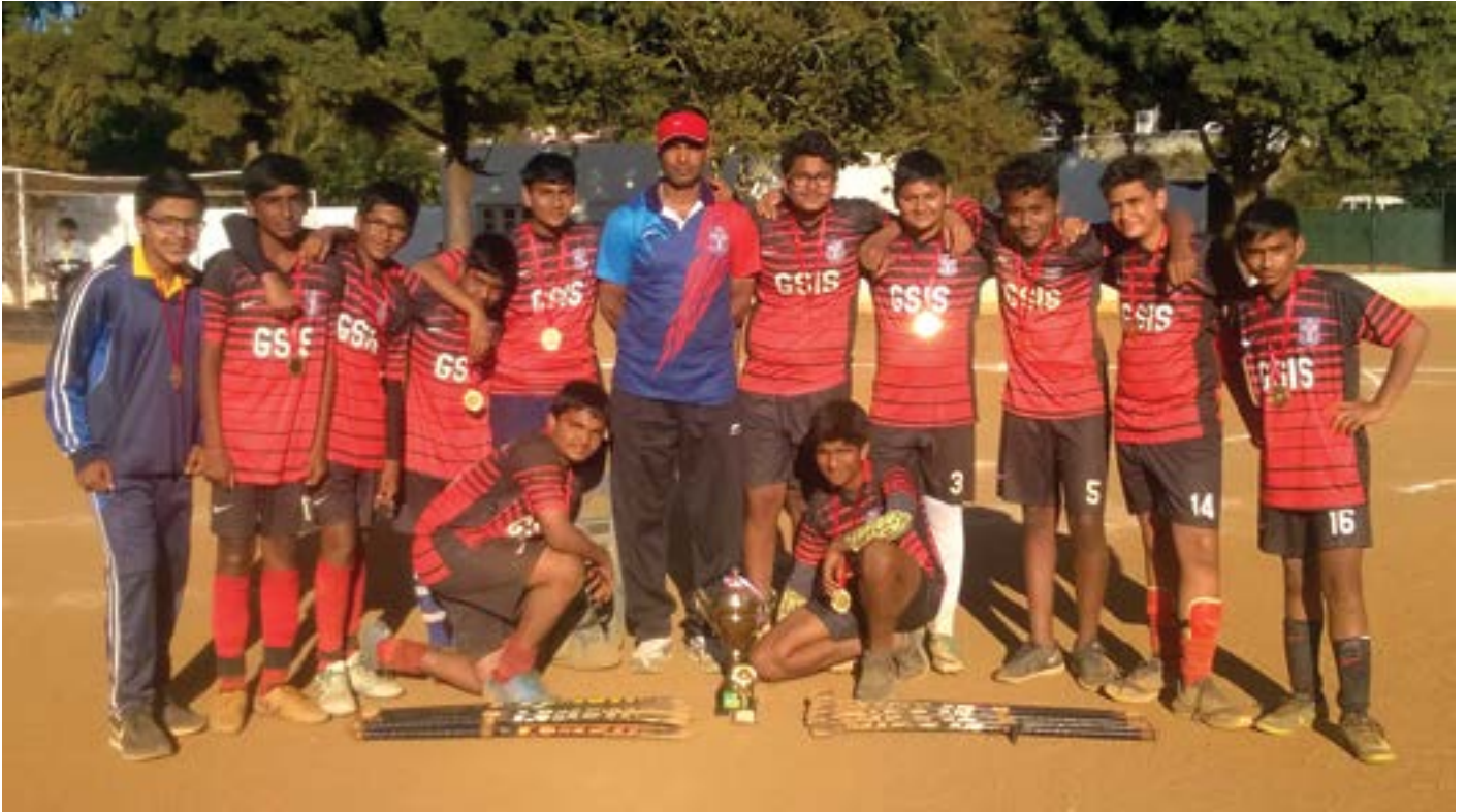
GSIS Hockey Team (U-14 yrs division)

The Annual Inter School Hockey Tournament for boys was held at Brindavan Public School, Coonoor, on Saturday, 03 February 2018.