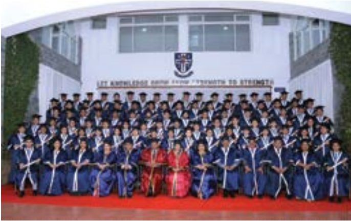
The graduands of Grade 12