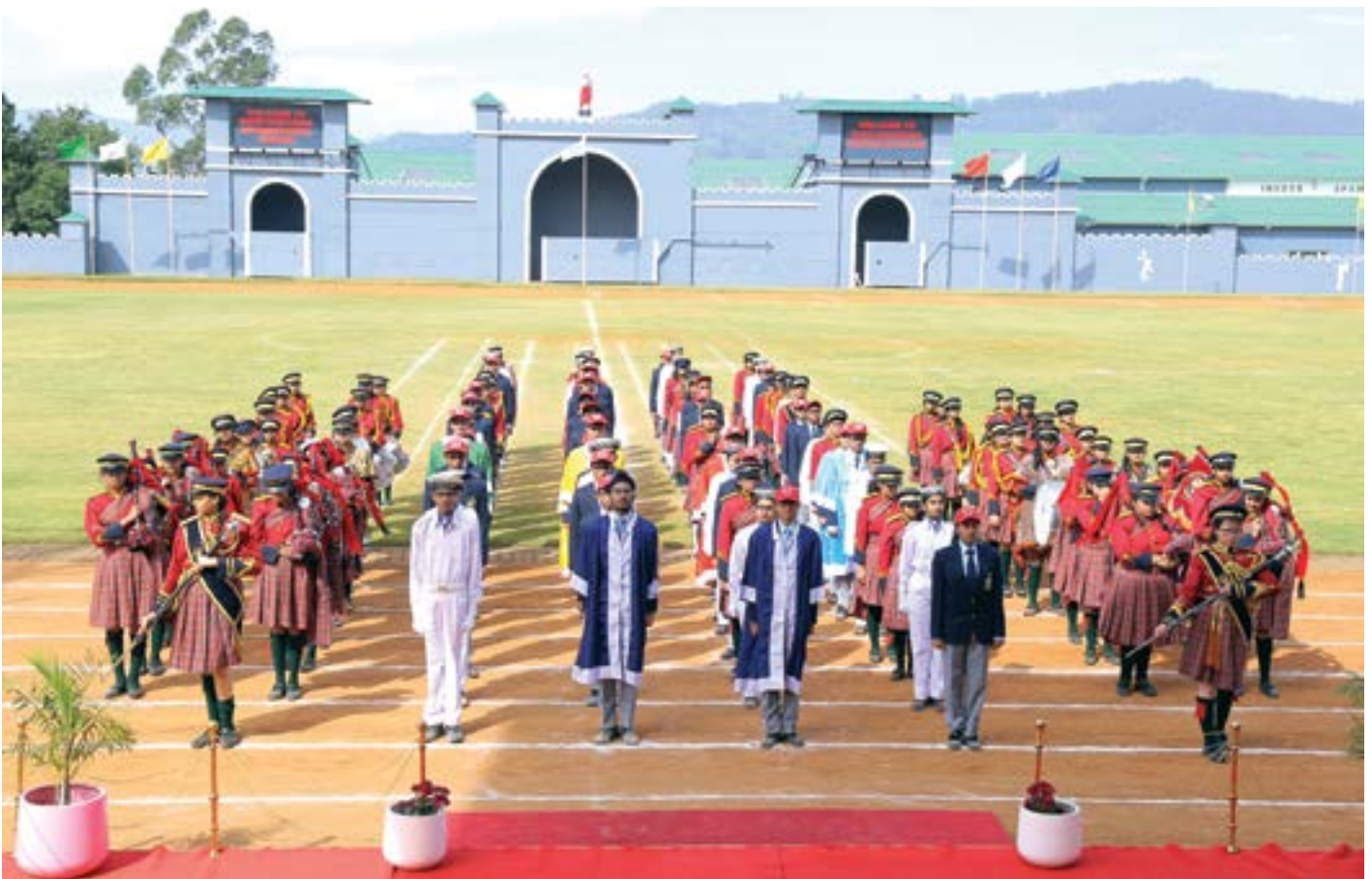
Members of the new Prefects' Council