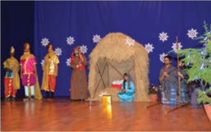
Students performing the Nativity Play