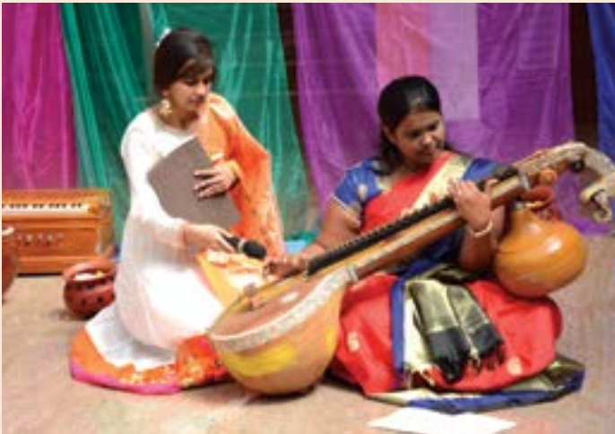
A student playing the veena