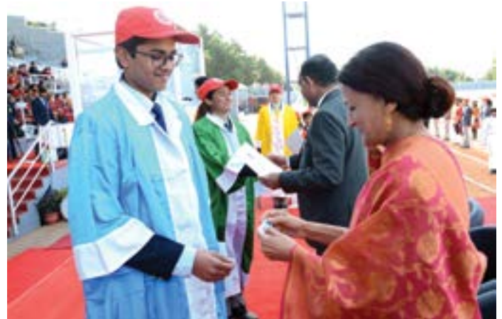
Award of badges and certificates