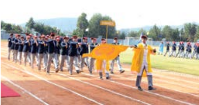
March past in progress