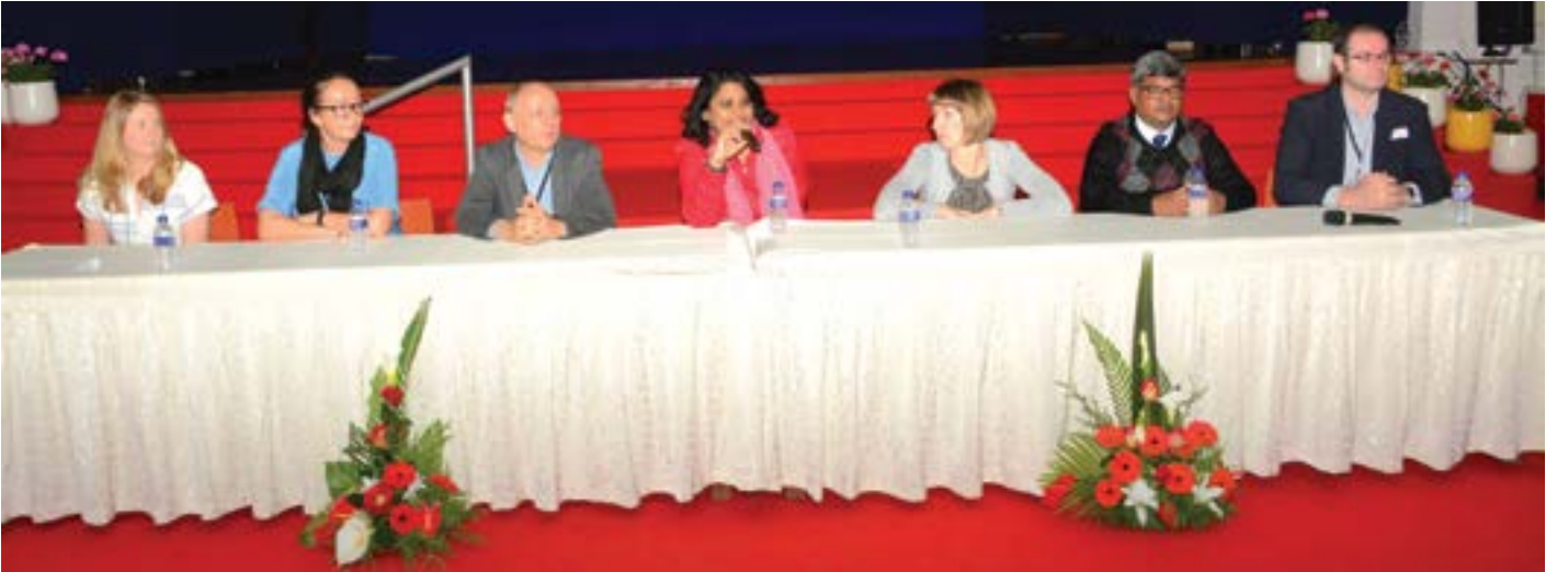
Delegates of UK Universities making presentations on studying in UK