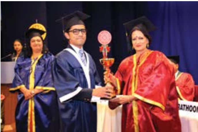
Distribution of special prizes