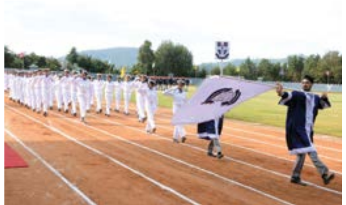
March past of the Sea Cadet Corps