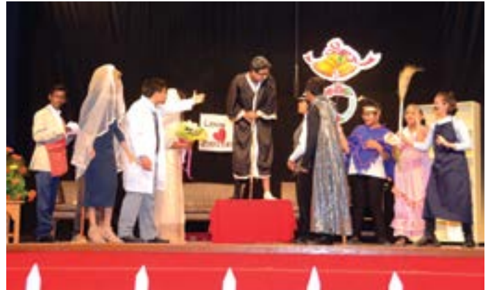
Scenes from the play, 'Fools'