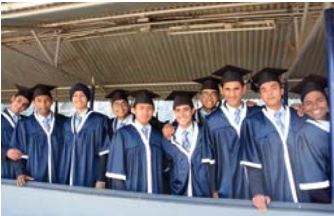
Graduands in their gowns and graduation caps