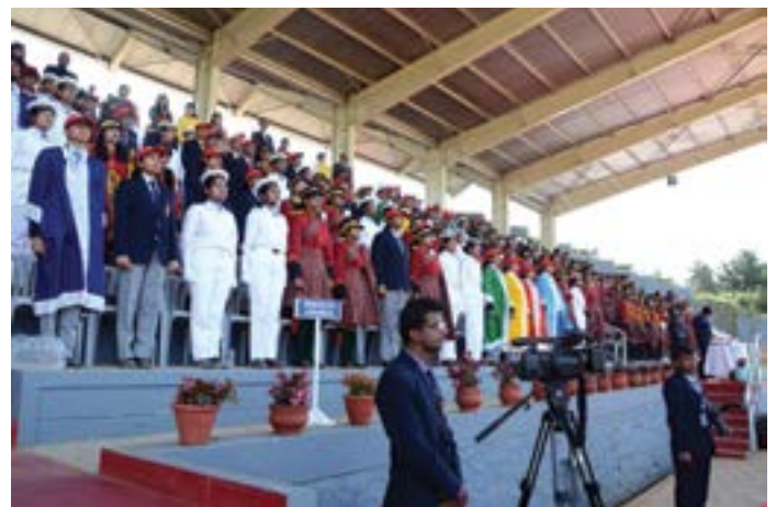
Students, parents and guardians in the pavilion

“Do not follow where the path may lead, go instead where there is no path and leave a trail.”