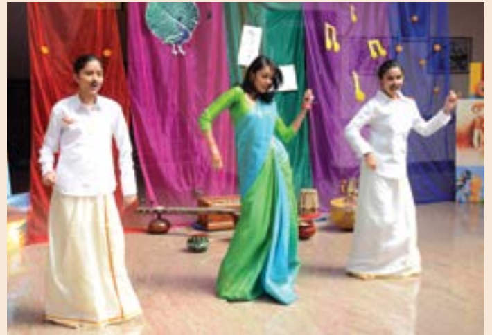
A cultural programme in progress