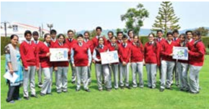
Idea generation team