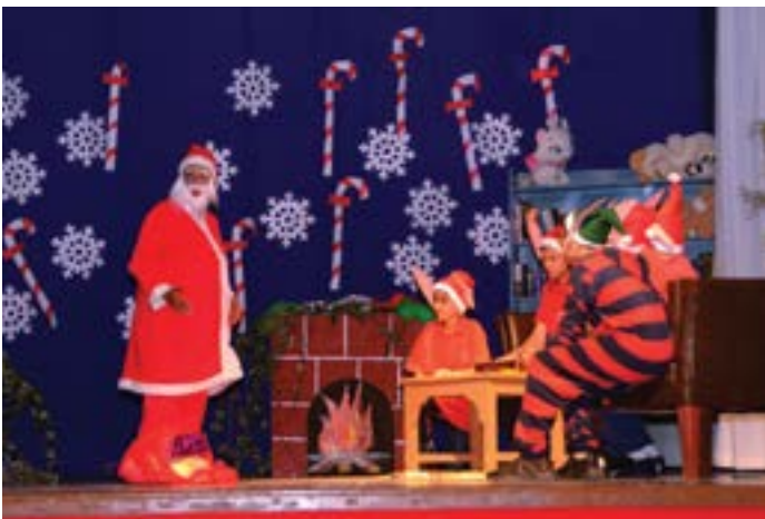
A scene from the play, 'Elf'