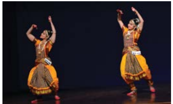
Summer House team