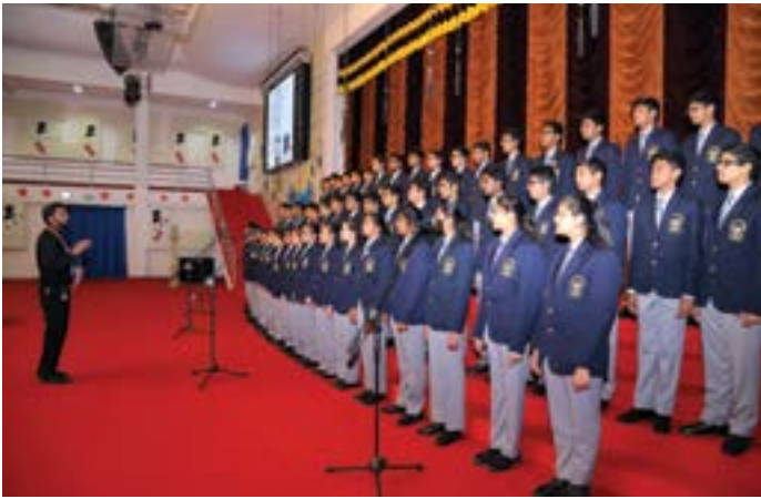
The school choir