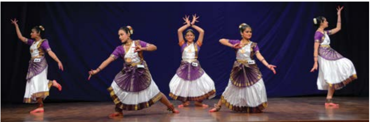
Autumn House Team