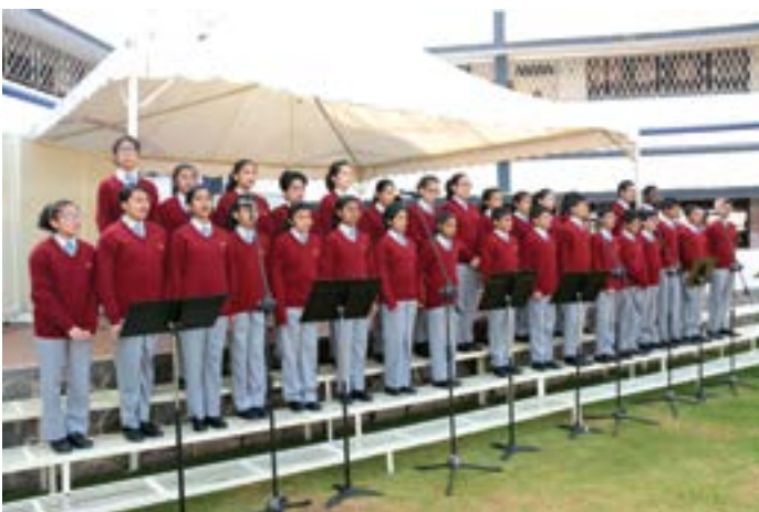
The school choir singing patriotic songs