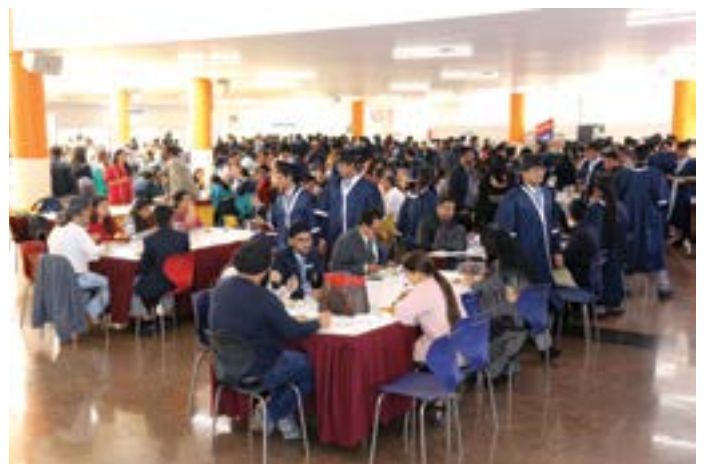
The Graduation luncheon in the school dining hall