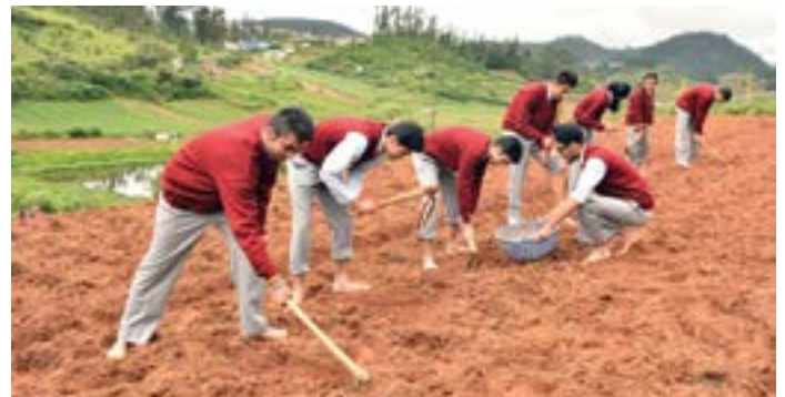
Students tilling the land to break up the soil