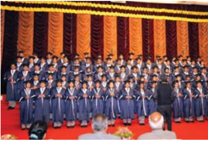
The outgoing batch of Grade 12 students singing 'Pass It On'