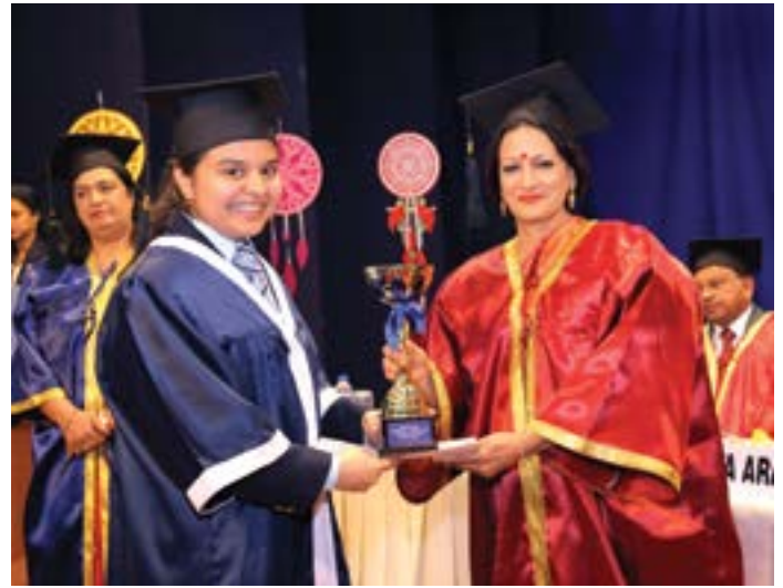
Distribution of special prizes