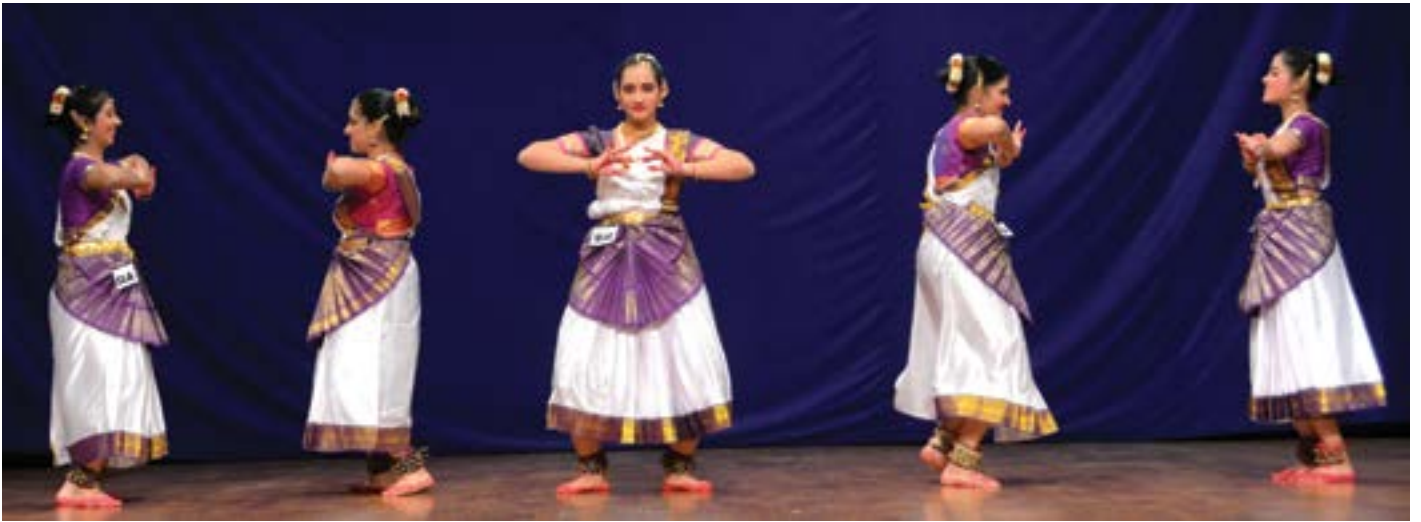
Summer House Team