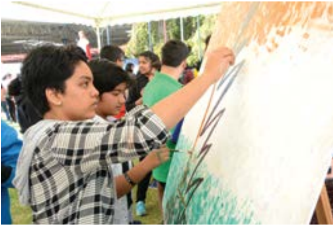
Students participating in drawing and painting