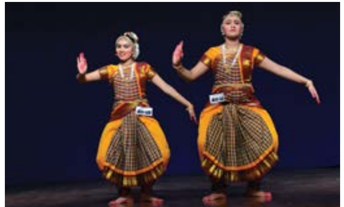
Winter House team