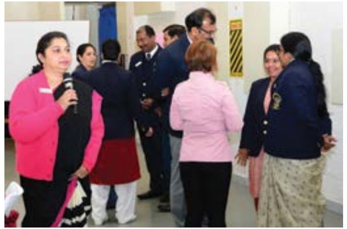
An interactive session in progress