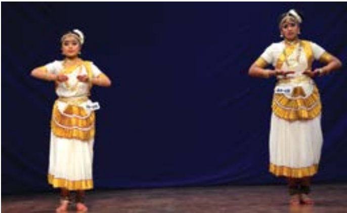
Autumn House team