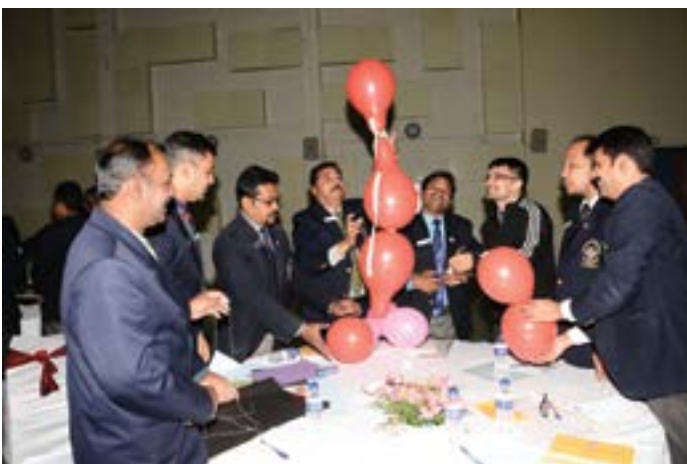
Teachers participating in various activities