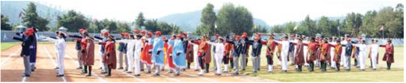
Oath-taking ceremony in progress