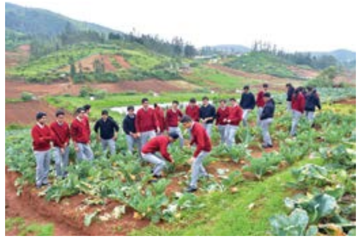
Students harvesting cabbages