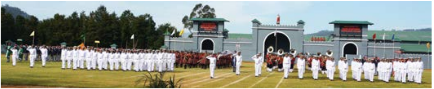
Students assembled on the ground for the parade