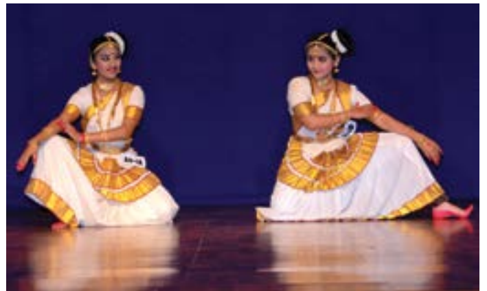
Spring House team