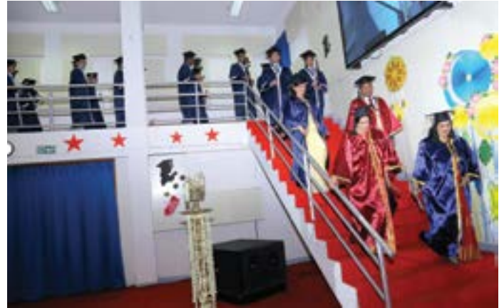
The Ceremonial March