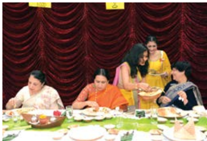
Special Invitees enjoying the diverse flavours of Dakshin cuisine

The Inter House Indian Cooking Competition of the 9 months' batch of girls for the year 2017 – 2018 was held in the Atrium of the GSFS Campus in Good Shepherd Knowledge Village from 25th to 27th of January 2018. The event named The Tastes of India , was an excellent opportunity for one to taste the flavours of different popular Indian cuisines and enjoy the hospitality of the students of GSFS.