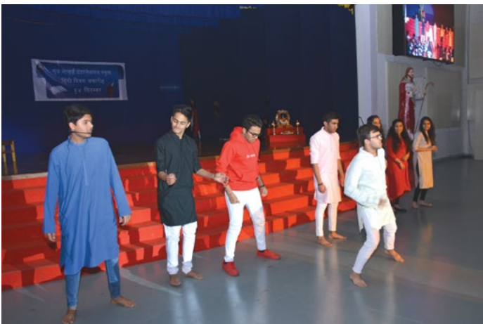
Students of Grade 12 dancing