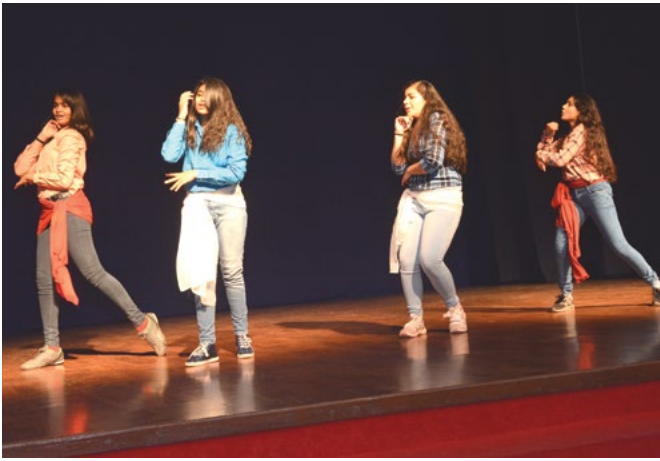
Dance performance of girls