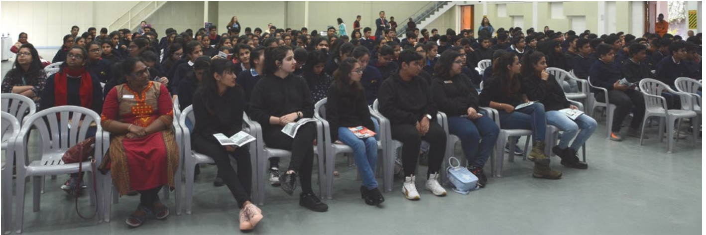
Students attending the American Universities Fair

options in the US. Students were seeking information on university education in the US. The Admissions Officers addressed the students of Grades 11 and 12 and they offered a range of academic programmes at undergraduate and graduate levels. The students were spoken to on the changing trends of university education. They also distributed their brochures to the students.