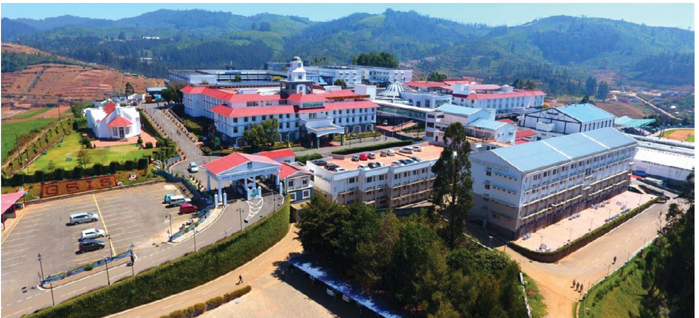
Good Shepherd International School – Palada Campus

EducationWorld in association with C fore, Delhi has concluded its annual EducationWorld India School Rankings 2018 - 2019 survey.