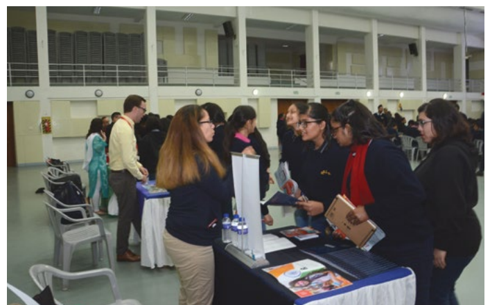
Our students seeking information from the Admissions Officers