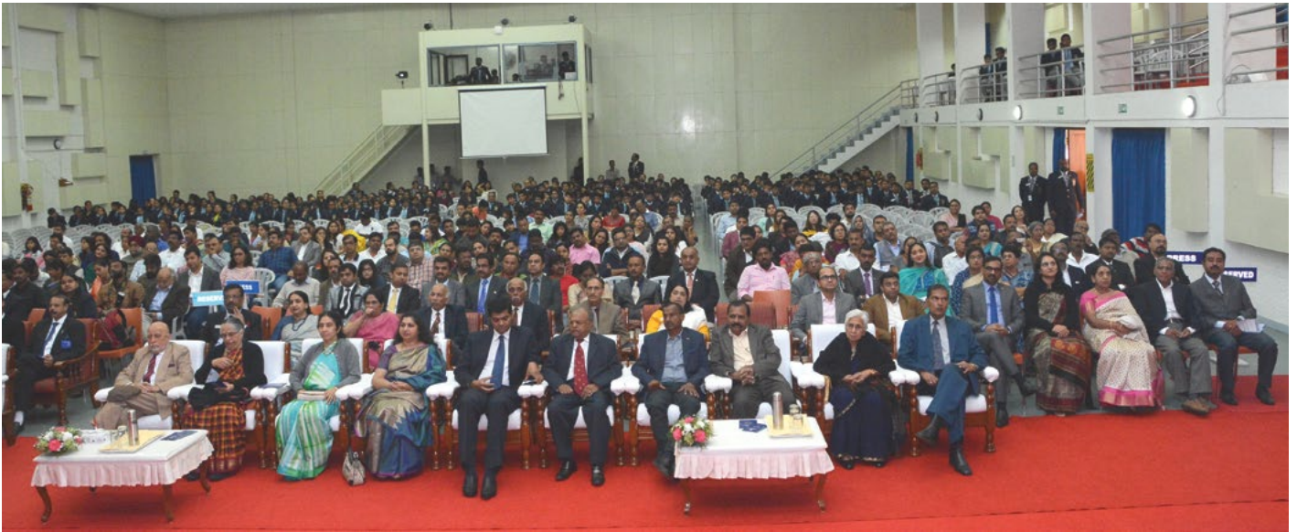
A view of the audience in the auditorium during the Dr P C Thomas Initiative Trust inauguration