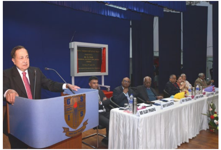
Mr N Ram speaks at the Dr P C Thomas Initiative Trust inauguration