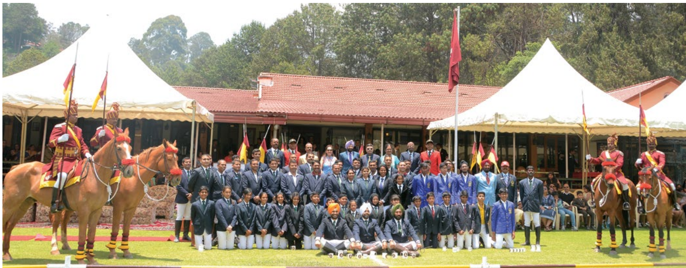
Our equestrian team along with the other participants at the Wellington Gymkhana Club Ground