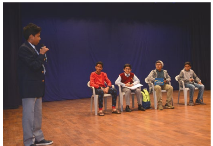
Skit by students

"A good teacher can inspire hope, ignite the imagination, and instil a love of learning," a famous quote by an American politician, Brad Henry , summarizes everything about the guiding force of our lives.