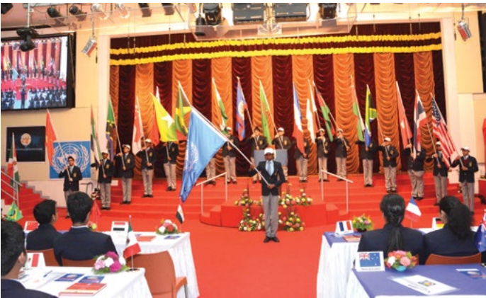
Flag presentation ceremony