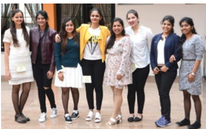
3 months' batch: Winners in jive