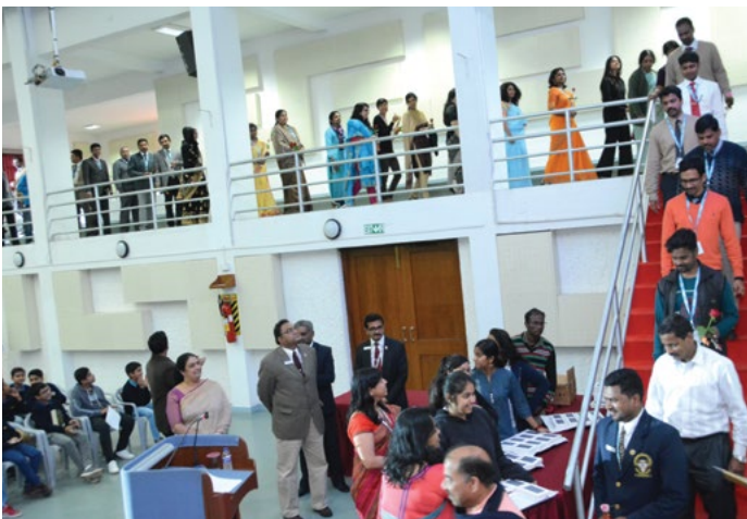
A grand reception to the teachers on their entry to the auditorium