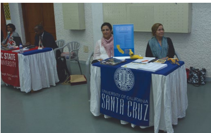
Admissions Officers from US Universities at GSIS