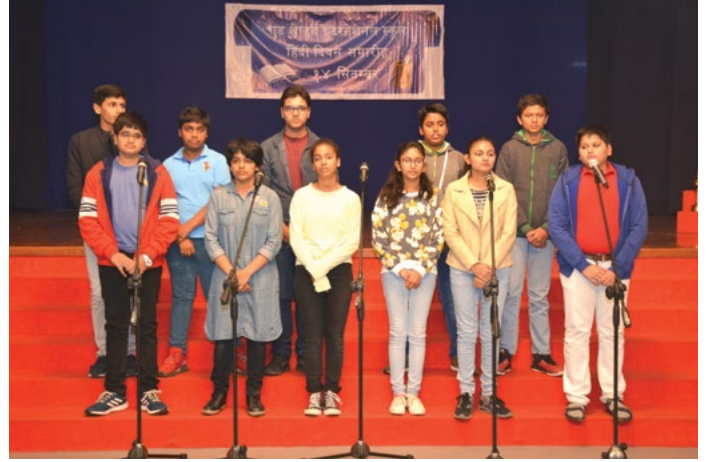
Middle School students singing a patriotic song