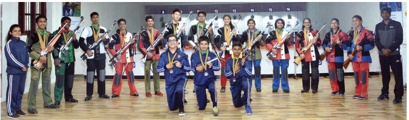
The shooting team representing GSIS

The Tamil Nadu State Inter School Shooting Championship for boys and girls was held at Mission Academy of Shooting Sports, Anna Nagar, Chennai, under the aegis of Tamil Nadu State Shooting Association from 18 August to 22 August 2018. Ten boys and six girls of GSIS participated in the championship. The results of the competition are given below: