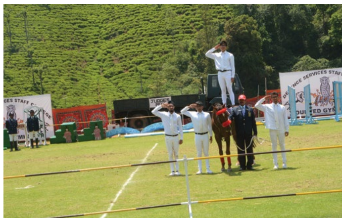
Our Mounted Gymnastics team along with the instructor