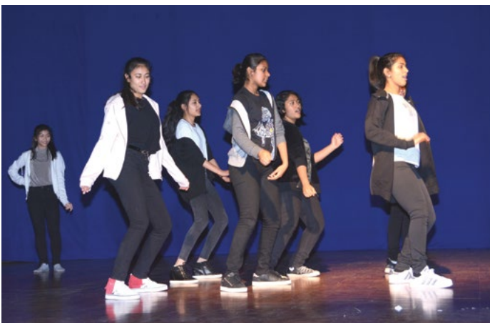
A fine dance performance