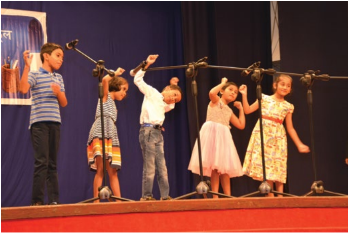
Junior students of the Fernhill Campus performing an action song