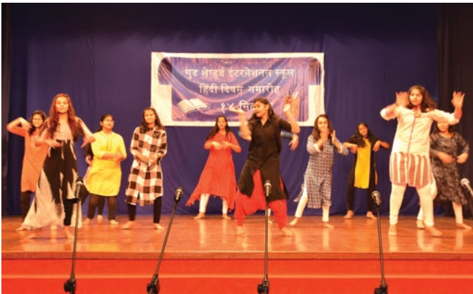
A dance performance of Grade 9 girls