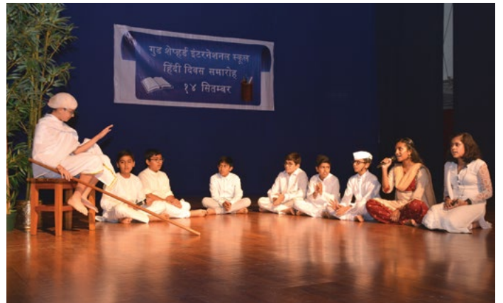
Students presenting a skit