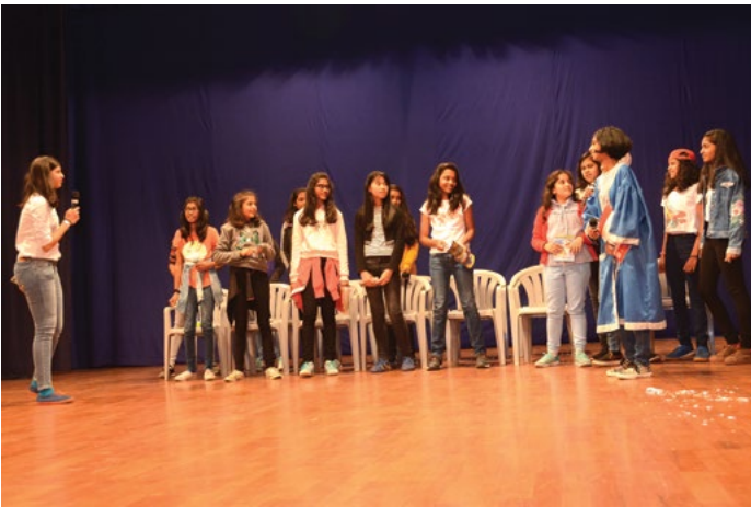
Girls presenting a skit