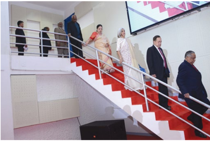
Arrival of the chief guest