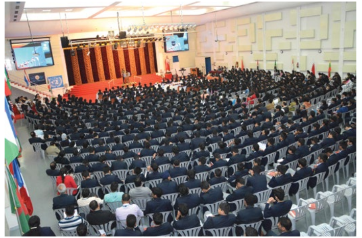
A view of the Model General Assembly meeting