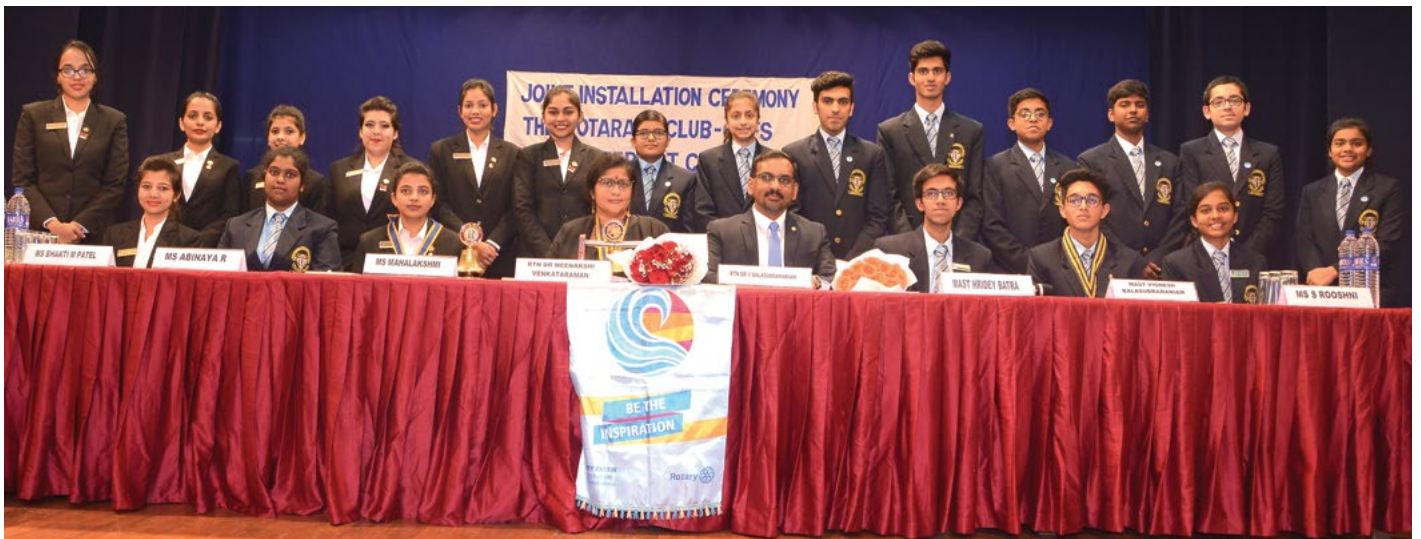
New Office-Bearers of the Interact and Rotaract Clubs for the year 2018 - 2019