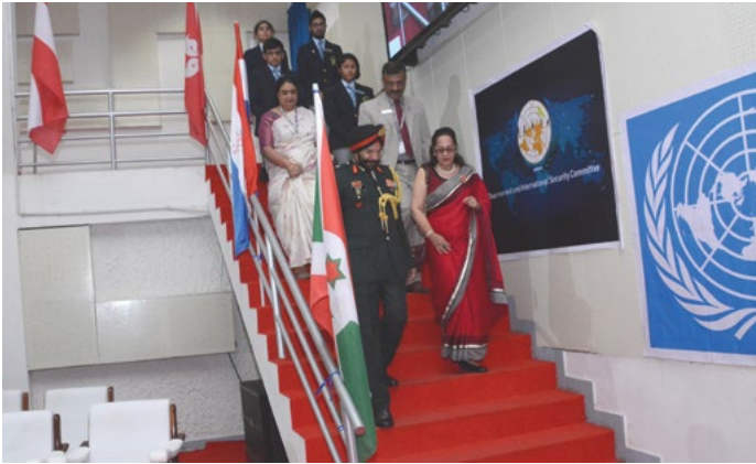
Arrival of the chief guest