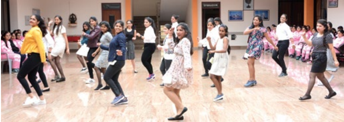
3 months' batch of girls performing cha-cha-chá