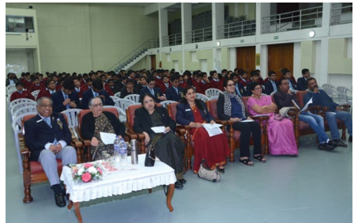
A partial view of the audience

soon installed. The Chief Guest presented the Collar, the Badge and the Gavel to the new Presidents of the Interact and Rotaract Clubs. The new Interact and Rotaract Presidents also addressed the congregation. Dignitaries and invitees of Rotary Club of Nilgiris West were also felicitated on the occasion.