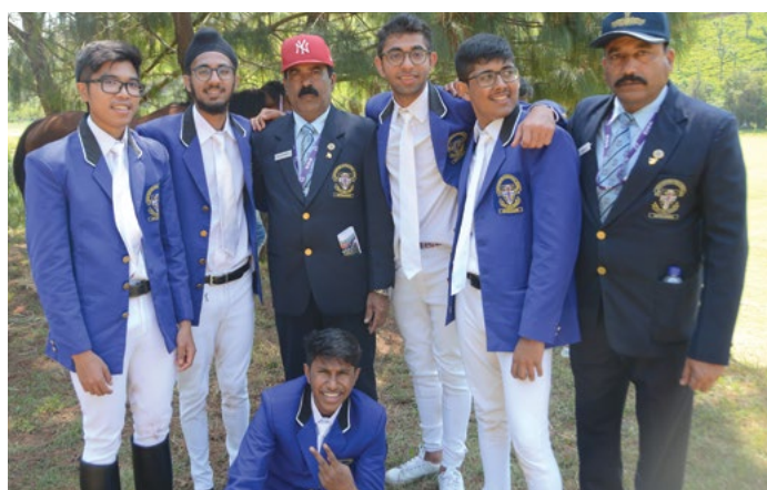
GSIS Equestrian Team along with the instructors