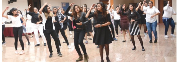
9 months' batch of girls performing jive