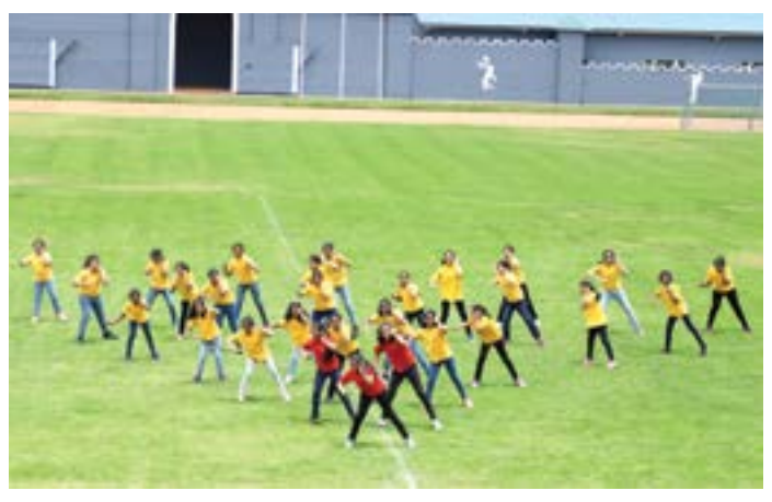
Grades 4,5 & 6 girls: The Junior School girls danced a Jazz funk dance in a diva-like dance style