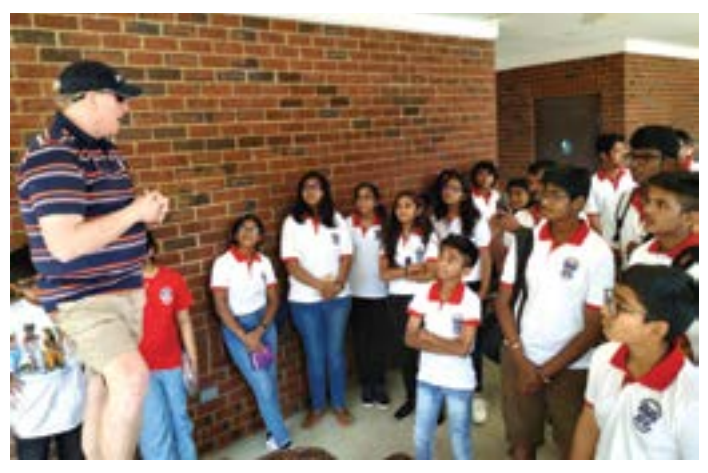
Our students in Decatur during the pizza party