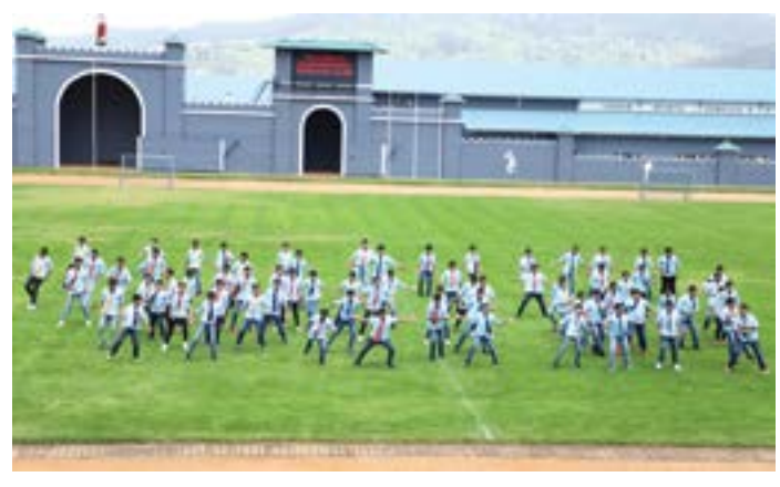
Grade 8 boys danced to the song, 'Let Me Love You', in Hip Hop form of dance