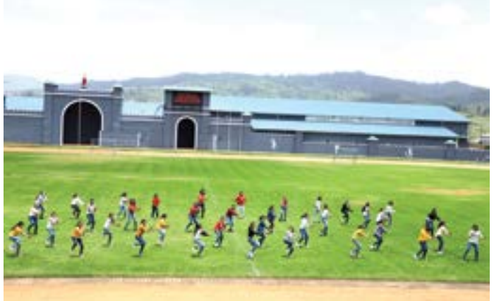
Grades 7 & 8 girls performed an energetic dance to the tune of the song, 'Mi Gente'

Instructors from Naresh Kathak Entertainment (NKE) conducted a workshop for the students of Good Shepherd International School from 22 July to 28 July 2019. Instructors of this dance troupe are trained in different styles of dance like Kathak, Hip Hop, Contemporary, Jazz and Bollywood . The members of this troupe train celebrities, shake their legs with leading actors in Hindi movies, participate in award shows and other dance performances.