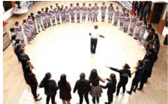
GSFS girls during the training session

Dancing is one of the most inspiring forms of art. It could serve as a powerful stressbuster for children. In the olden times, ballroom dancing was social dancing for the privileged. Modern ballroom dance has its roots in the early 20th century. Ballroom dances are normally performed to the rhythm of western music, and couples dance counter-clockwise around a rectangular floor following the line of dance.