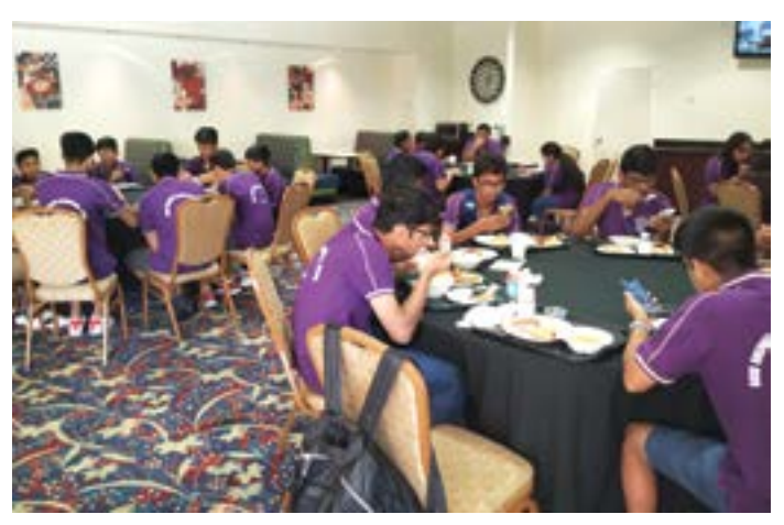
Students enjoying their food at a restaurant in the United States