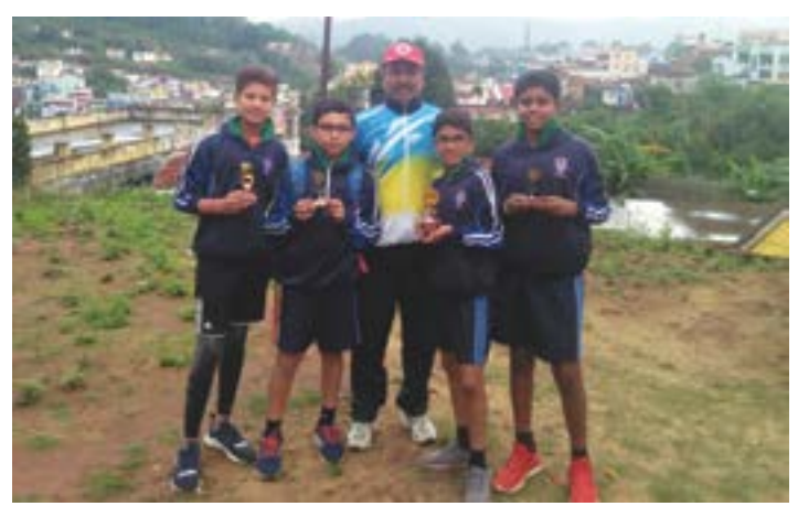
GSIS Table Tennis team seen along with the TT coach