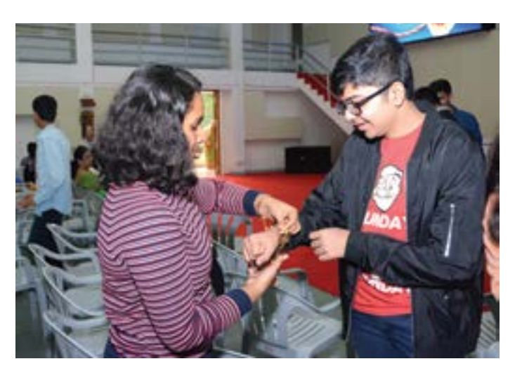
Celebration of brother-sister relationship

Students of Fernhill Campus, Palada Campus and GSFS celebrated Raksha Bandhan - the brother-sister festival - on Thursday, 15 August 2019.