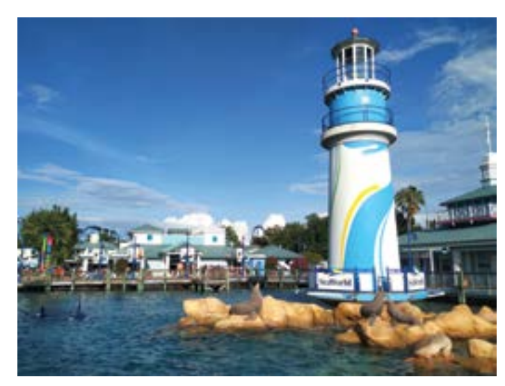
Orcas and Sea lions at SeaWorld in Florida