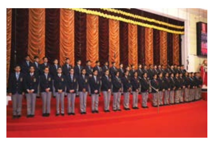
The Indian music choir singing 'Vande Mataram'