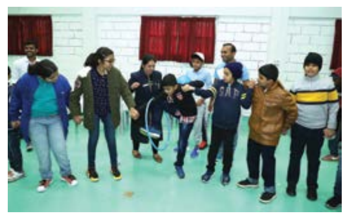
Students enjoying an icebreaking session