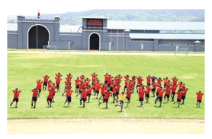
Grade 7 boys performed to a peppy song – 'Aala Re Aala'