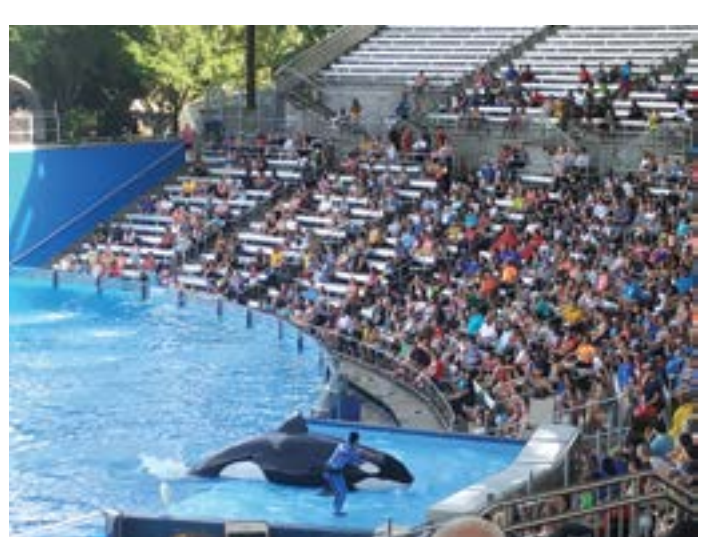
Live show: Students watching an orca performing at SeaWorld in Orlando