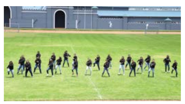
The ladies of GSFS performed a Bollywood Bhangra dance to the tune of the song 'Morni Banke'