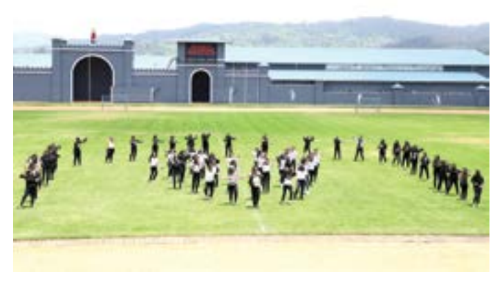
Grades 9 &11 girls danced to the tune of a remix song, 'Dola Re Bola'